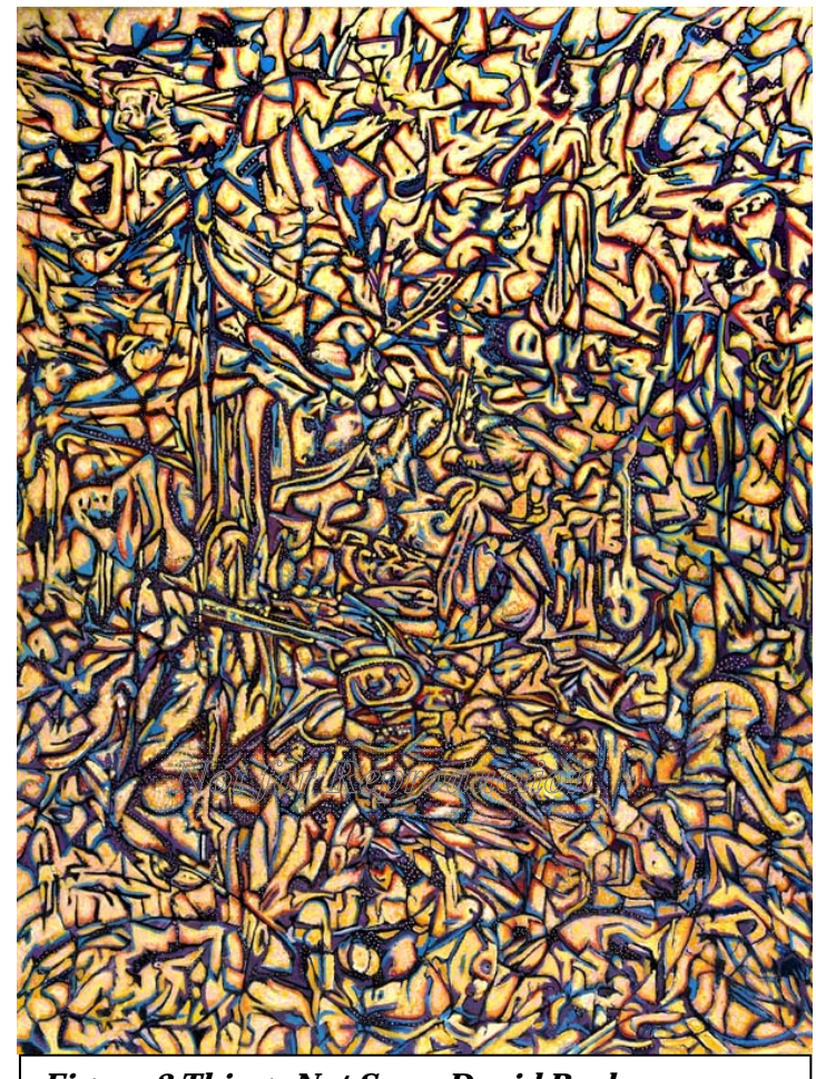
Figure 3 Things Not Seen, David Parker

Worringer's thesis is that abstraction refers to all art expressions that are nonnaturalistic — including geometric stylizations (e.g. Arabic) as well as figurative stylizations (e.g. Medieval, Byzantine). His general thesis can also be applied to Modernist experiments in pure abstraction as seen within the work of key painters such as Wassily Kandinsky, Piet Mondrian,