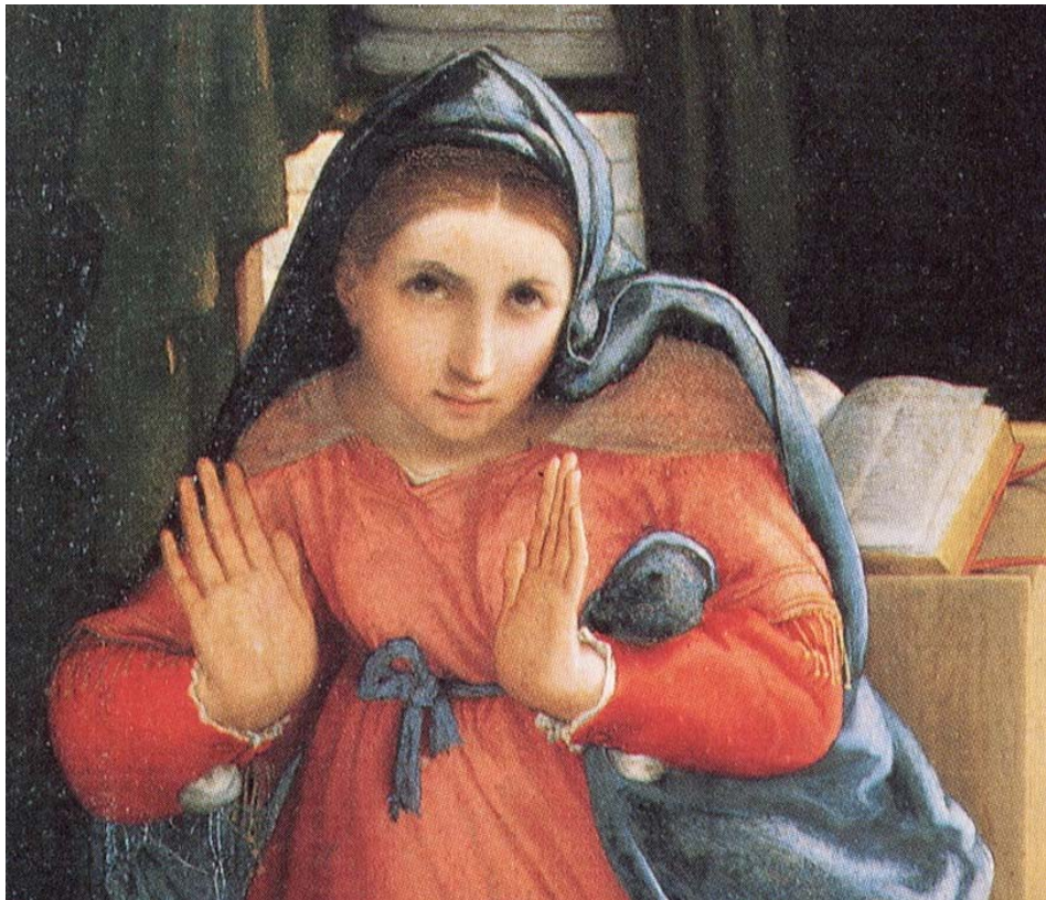
Figure 3 Lorenzo Lotto, Detail, The Virgin Annunciate

simple robes. In this state, already suggestive of blossoming pregnancy, Mary turns her back upon the higher learning of her reading book to directly engage the viewer with moon-faced awe and almond-eyed wonder. The startling proximity of the Virgin to the implied witness of the scene is highly unusual, ignoring traditional decorum which set the scene of sacred incarnation at a more reserved distance. Uniquely, Lotto places us, the implied observer, towards the center of the composition as if kneeling just before Mary and meeting the uncanny gaze of her outward looking eyes. This motif gives Lotto's image a vibrant immediacy which is further strengthened by Mary's youthful sensuality and emotive body language.