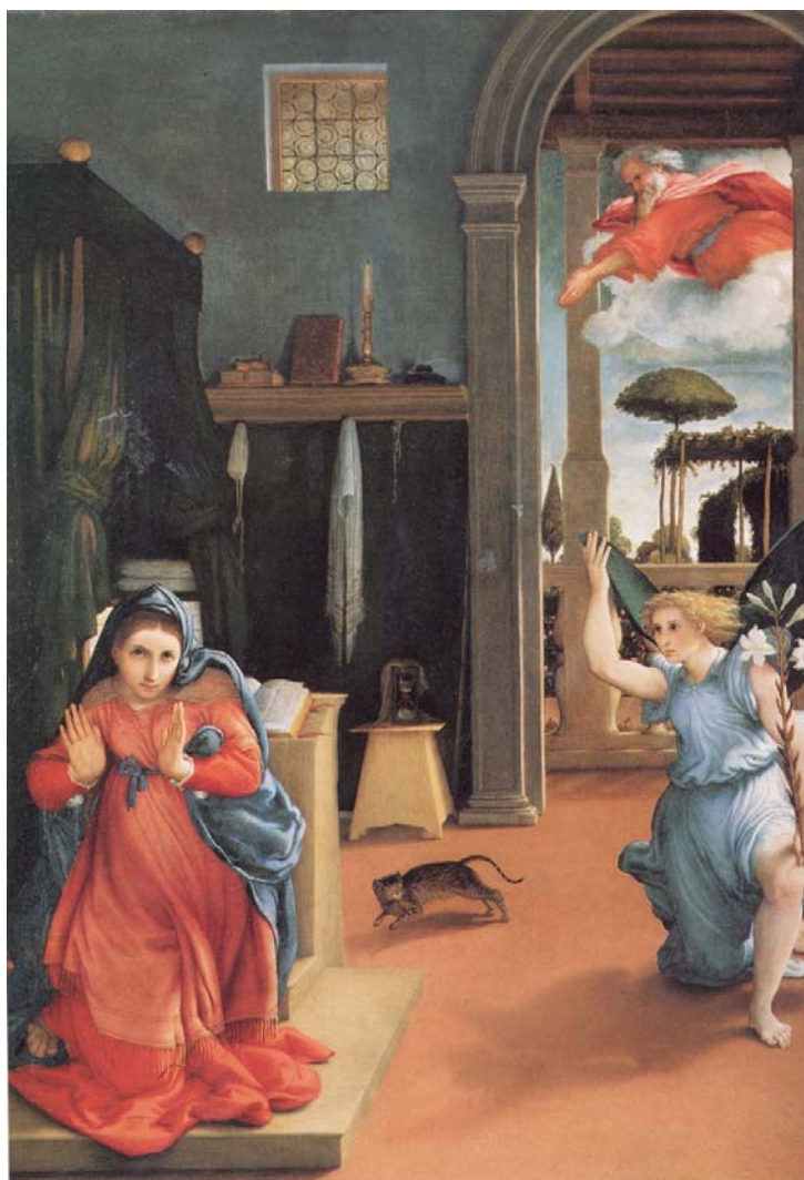
Figure 1 Lorenzo Lotto, The Annunciation , 1535, Pinacoteca Civica, Recanati