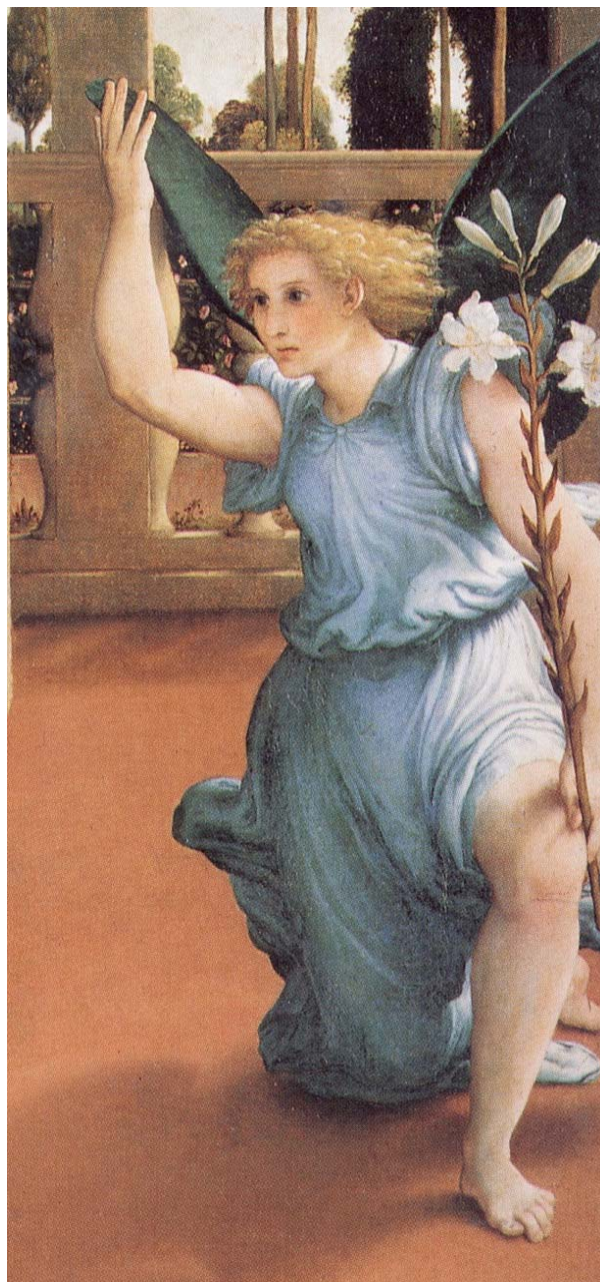
Figure 5 Lorenzo Lotto, Detail, The Angel Gabriel

Lotto's quirky cast of characters, which include the outside viewer, are dynamically linked together through emphatic eye contact that heightens the emotional tenor of the picture. This agitated zigzag movement begins at the upper right from where God stares down at the Virgin. As if stunned by this gaze, the Virgin turns and looks outwards towards the viewer. Included in the sacred action, we see the agitated and startled cat straight ahead, who, unaware of us,