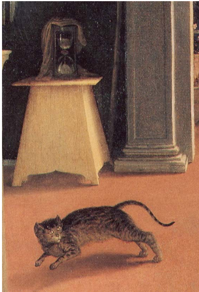
Figure 4 Lorenzo Lotto, Detail, Cat and Hourglass

with which the ancient Romans hailed the emperor. The early Christians subsequently used the same solemn gesture both in images of Christ greeted by his followers, and in orante figures shown in prayer. In this context, however, the gesture, coupled with the Virgin's gyrating body movement and enigmatic gaze resonates with shock and unease. The emotional tension is heightened by the unusual inclusion of a startled cat, who in a pose oddly echoing that of the Virgin, is shown in a twisted position with its front paws upraised completely off the ground (fig. 4). Moving its body quickly forward towards the left, the cat's head is turned backwards with frightened eyes fixed directly on the onrushing figure of the Archangel Gabriel.