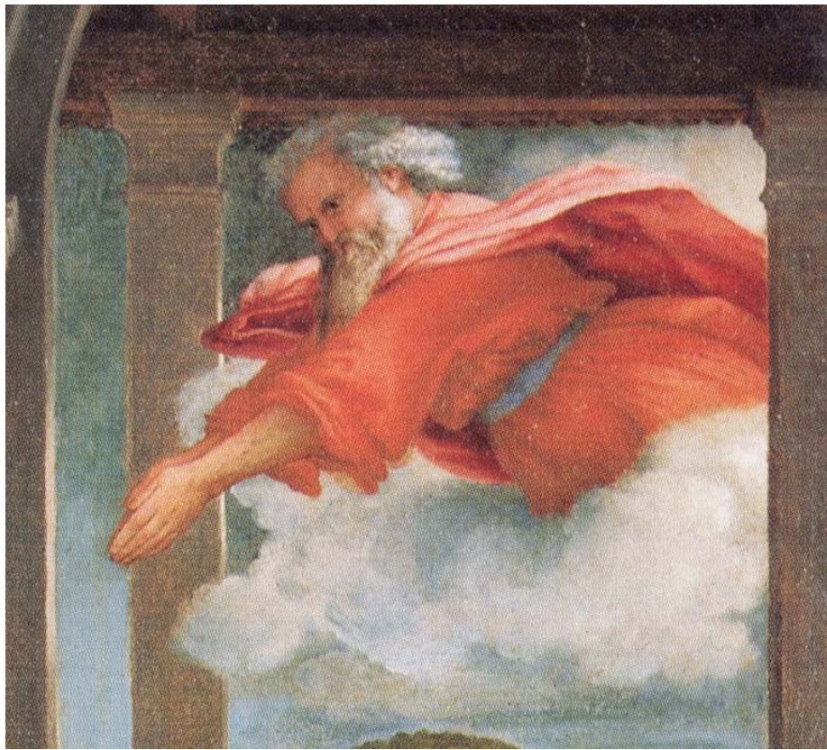
Figure 6 Lorenzo Lotto, Detail, God the Father

While it is rare to show God, the personification of the objective psyche, in scenes of the Annunciation, Lotto uniquely depicts Him as the God of Revelation: His head and His hair were white like wool and His eyes were a flame of fire,” (Rev.1:14) (Fig. 6). God’s heightened emotionality, along with the reactive Virgin and her animal companion and counterpart, the frightened cat, viscerally suggest the edgy psychological quality of numinous experience and its powerful archetypal energy. The blue and red coloration of God’s robes, which are echoed in those of the Virgin, suggests the poles of the archetype which stretches from spirit to matter, heaven and earth. Through the colors of the robes that touch her