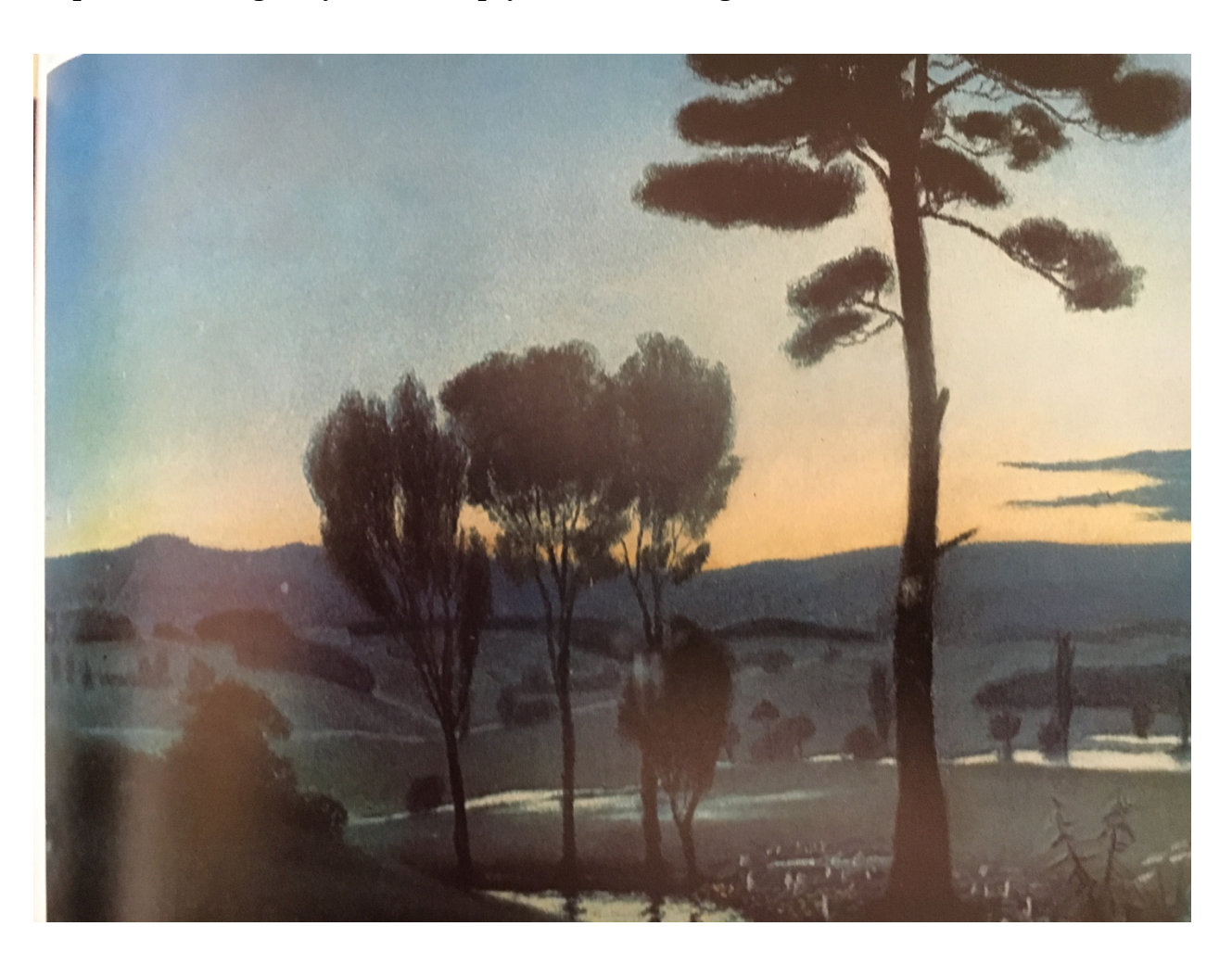
Figure 4 "Twilight" (C.G. Jung: Word and Image, 43).

Can trace elements of this painting be found in any of his own artwork? I think so and offer works from two different phases of his life as evidence. The first is a landscape that he painted during the years of his psychiatric training.