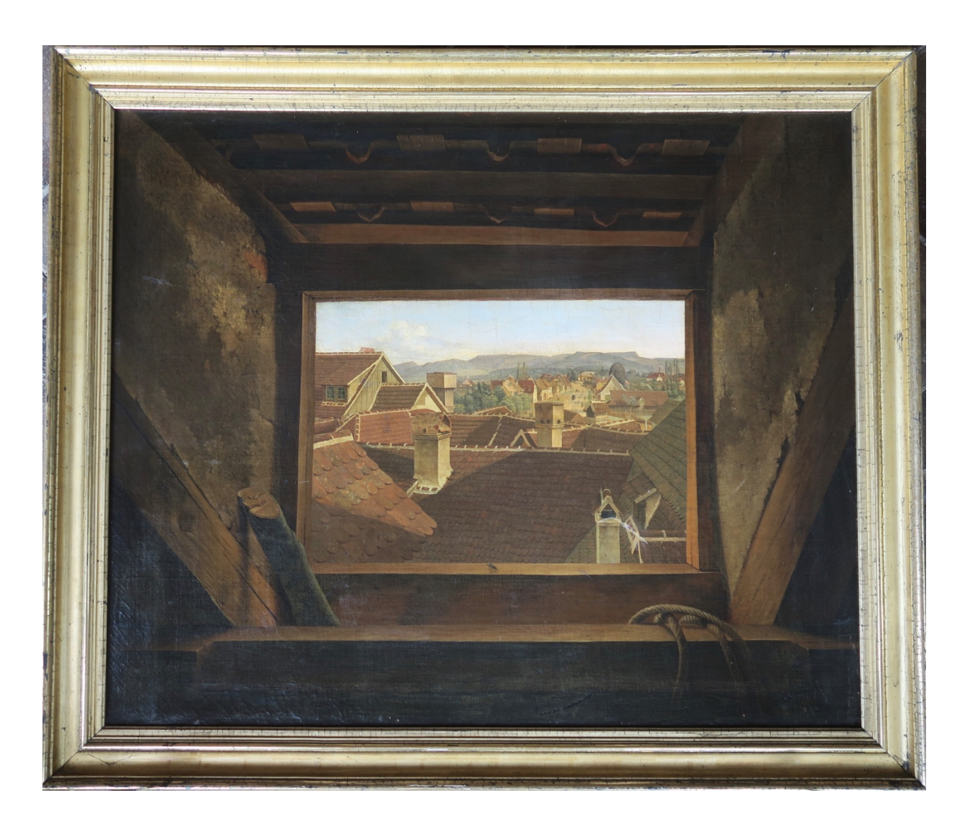
The Basel painting in the Jung Family Collection