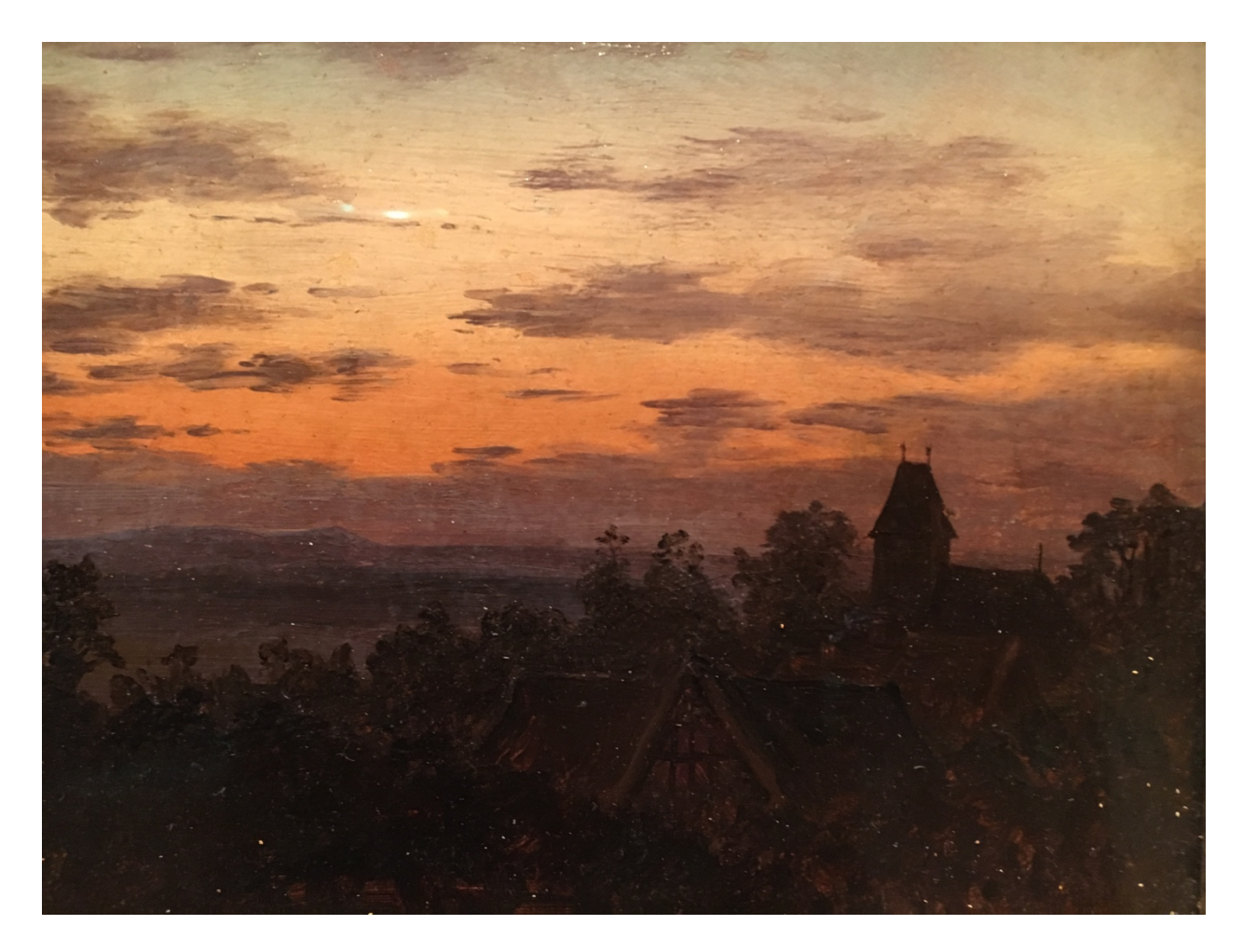
Figure 1 "Landscape at Sunset" (c. 1830), Metropolitan Museum of Art, New York.

I was surprised to learn that the painting Jung was was referring to was actually a much more intriguing work, an urban/topographic landscape seen from an entirely different point of view. (Figure 2)