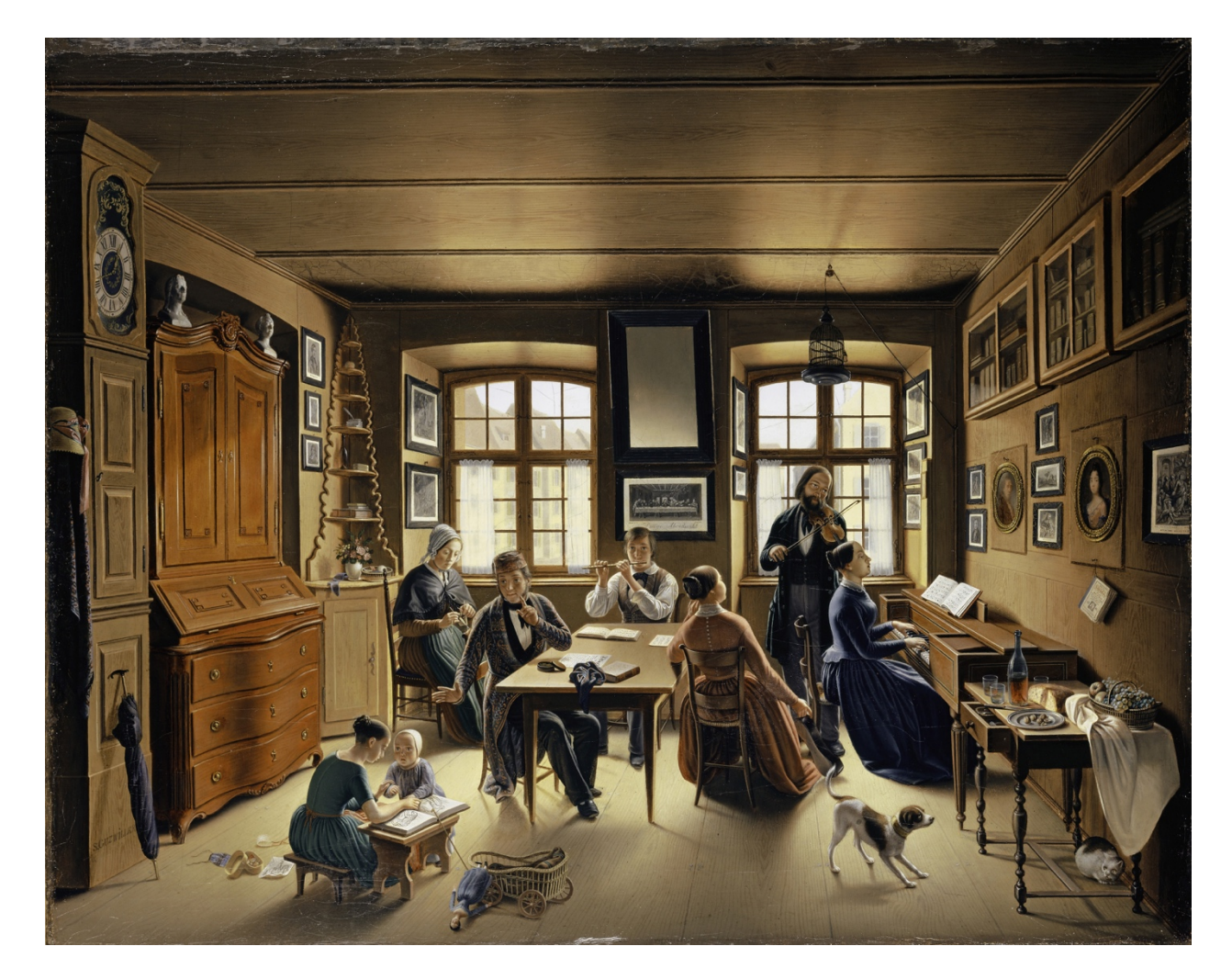
Figure 3 "Family Concert" (<a href="https://kunstmuseumbasel.ch/en/collection/collectiononline">https://kunstmuseumbasel.ch/en/collection/collectiononline</a>)

destruction. The suppressed Protestant religious imagination was to find its new home in the family parlor, which became a shrine in the new temple of Art. Gutzwiller's best-known painting captures a house where one could sit cozily surrounded by books, pets, family portraits and art prints.