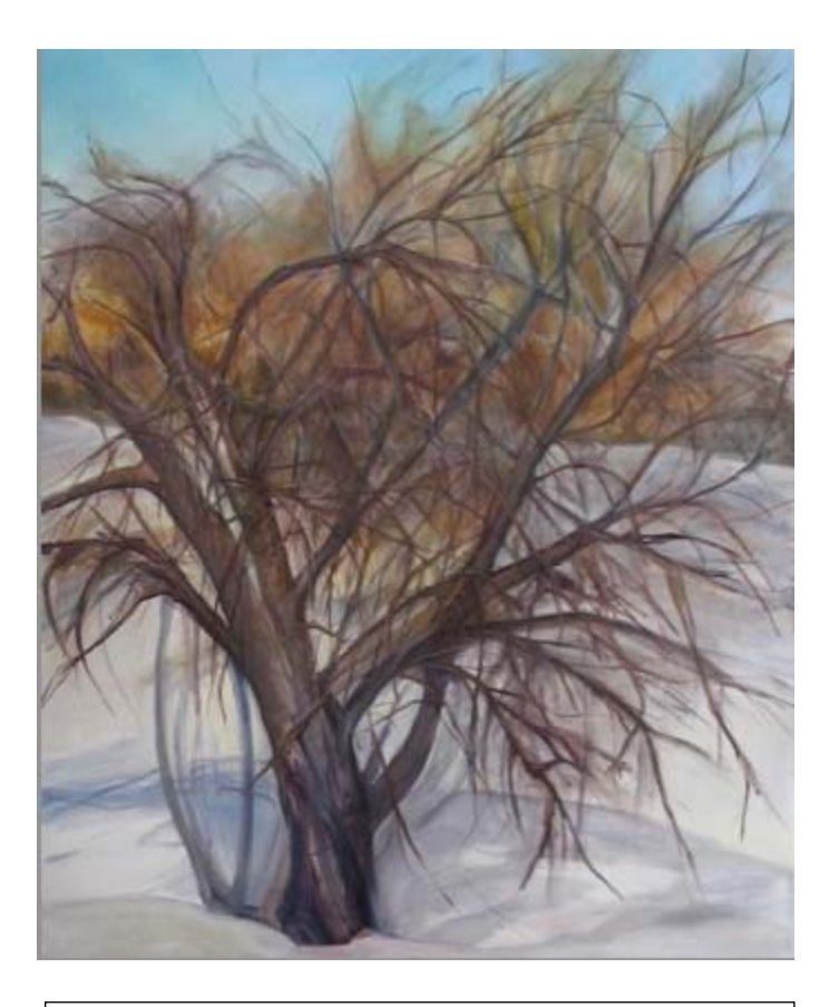
FIGURE 19. Albero Nudo Oil on Canvas 182.9 x 152.4 cm, 72 x 60in