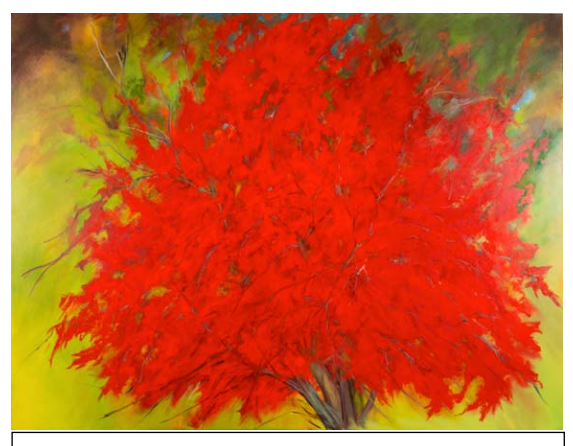
FIGURE 8. Albero Rosso, Oil on canvas, 182.9 x 243.8cm, 72 x 96in

abundant pink spring buds, the promise of summer's verdant greens, and the magical explosion of reds and yellows in autumn, me within the shelter and safety of our sun-porch with its charming French pane windows; the one room un-shadowed by domestic violence. It was for me, a place for daydreaming. I wish