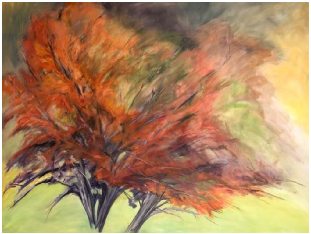
Biancospini , by Jennifer Pazienza, Oil on canvas, 182.9 x 243.8cm, 72 x 96in