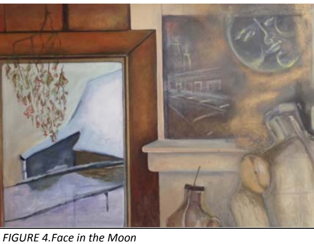
Oil on canvas, 21.9 x 152.4 cm, 48 x 60 in

Like the brick and mortar that were so fundamental to my grandfather's trade, in Beautiful Dreamer: Landscape and Memory, images and words, canvas and computer are my materials and tools. Beautiful Dreamer is a privileged site of old and new construction, of continual renovations characterized by layer upon layer of active waiting, breathing through thresholds, imagining and re-imagining possible worlds. It is where I labor, in gratitude, to understand and heal the psychic havoc wrought by early loss, domestic violence and Kantian aesthetics.