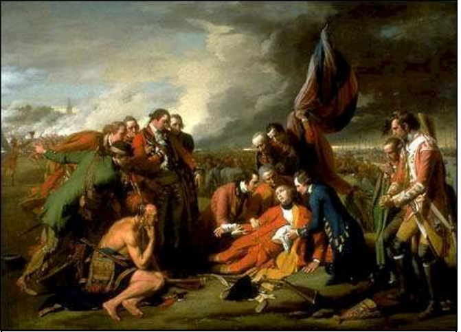
FIGURE 17. The Death of Wolfe, Benjamin West

FIGURE 16. Kanata, Robert Houle, 1993.