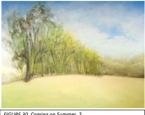
FIGURE 30. Coming on Summer, 2 Oil on canvas, 182.9 x 137.2cm, 53 x 72in

While my paintings certainly "question new art theories and provide solutions to painterly problems, they are fundamentally responses to the poetry of place and an inner landscape where I make sense of the world and my place in it" (Smart, 2010, p.7).