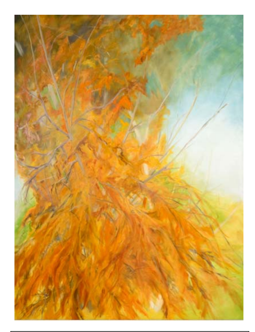
FIGURE 28. Bramosia, Oil on canvas, 243.8 x 182.9cm, 96 x 72in