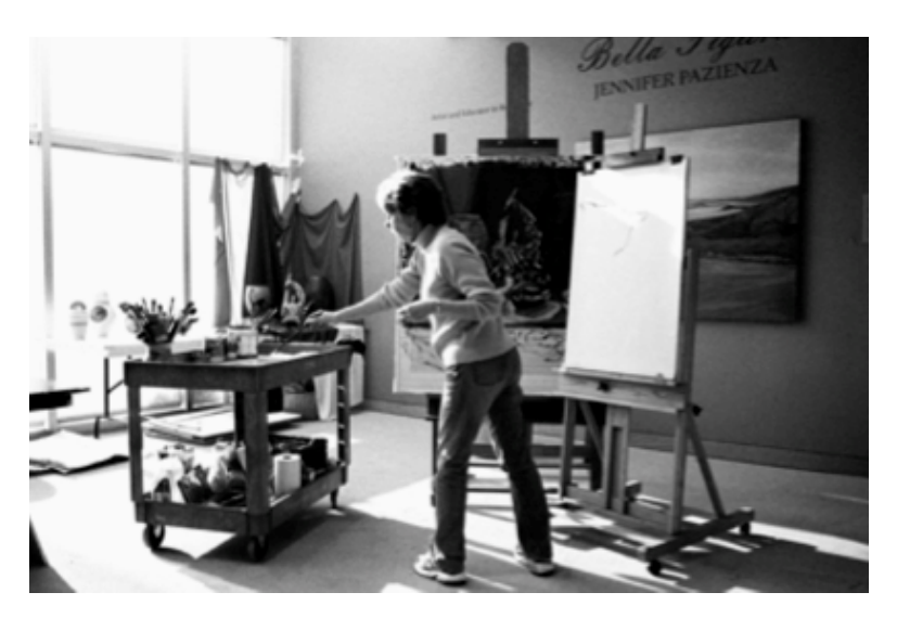
FIGURE 12. Artist in Residence The Beaverbrook Art Gallery The images in this paper are strictly for educational use and are protected by United States copyright laws. Unauthorized use will result in criminal and civil penalties.

Until Beautiful Dreamer , I restricted the theory of re-creation to art curriculum practices (Pazienza, 1989). Believing that I painted from natural, rather than symbolic worlds, I could not see how my art making was a matter of re-creating worlds (Goodman, 1978). Unwittingly, certain modernist dualities the sensorial and the symbolic, the actual and the aesthetic—were still influencing my thinking. That changed in another decisive moment when, about five years after a major illness, surgery and lengthy recovery, I served as artist and educator in residence for New Brunswick's provincial art gallery, The Beaverbrook (Fig. 12, Lindsay West 2007). There I was, working away, when without warning a docent came into the open studio. At the sound of his voice, the glass bubble I was painting in came crashing down around me. In a heartbeat, I recognized I needed a different way of being or I would forever be sweeping up shards. I pondered Thich Naht-Hanh's (1987) mindfulness practice, inter-being, a posture that dissolves boundaries and creates spaces where reverie and presence can co-exist.