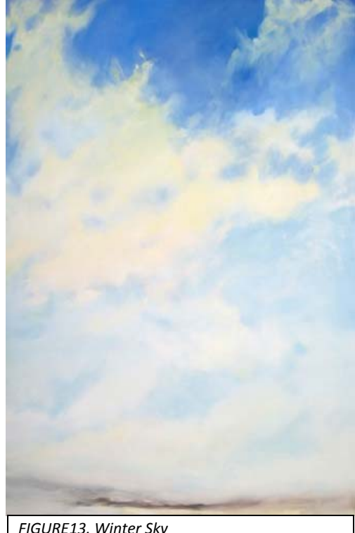
FIGURE13. Winter Sky Oil on canvas, 243.8 x 182.9cm, 96 x 72in

"for the intertwining of my body with the things it perceives is