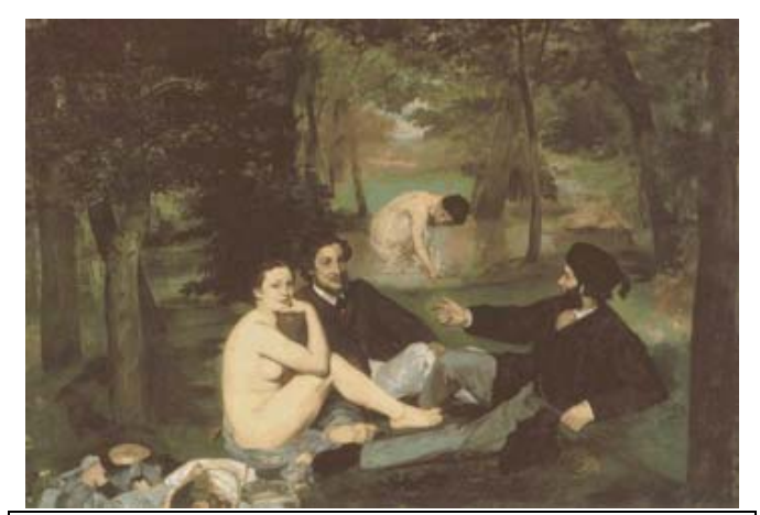
FIGURE 14. De jéneur sur l'herbe, Eduoard Manet, 1863.

of recessed or illusionistic space in painting-- over some 400 years since the Renaissance-- to flat space, signals a shift in how that space is gendered and ultimately valued or devalued. The aesthetic of flatness owing to art critic Clement