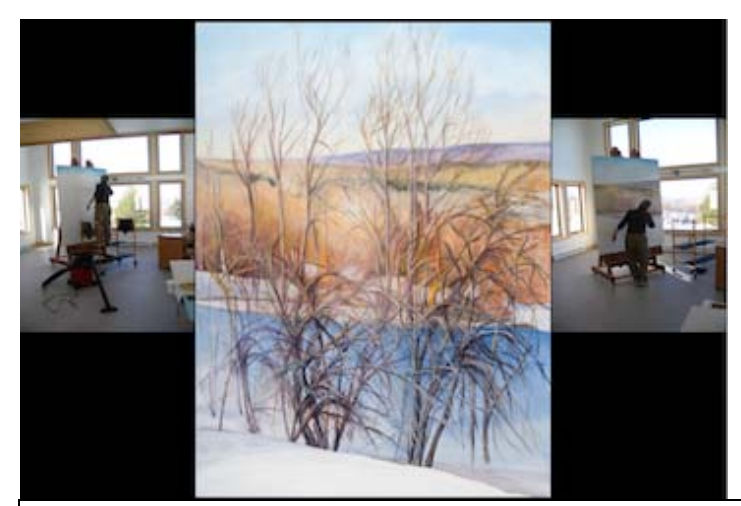
FIGURE 24. Nel Cuore dell' Inverno Oil on canvas, 182.9 x 137.2cm, 72 x 54in

(Fig. 24) I live his assertion that, "doubt itself is an active state...instead of meaning a lamentable loss of certainty...doubt is the positive possibility of certainty" (p.177). With James (1882) I see how the element of faith...as belief in something concerning which doubt, is still theoretically