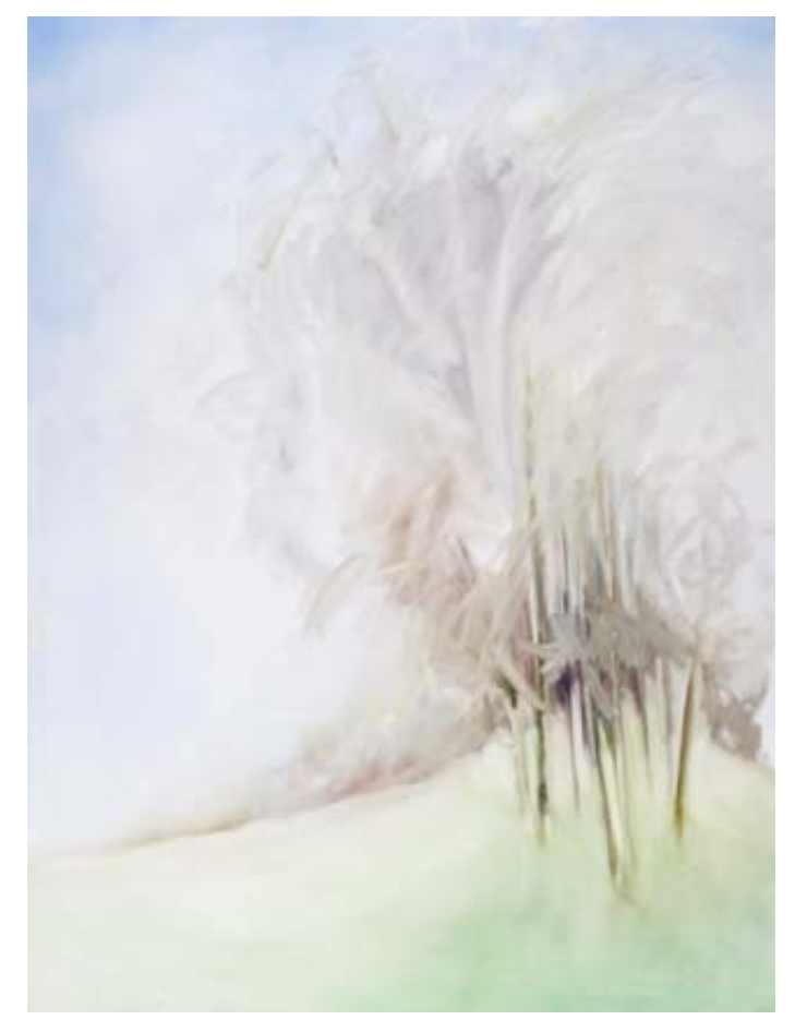
FIGURE 31. Coming on Summer, 1 Oil on canvas, 182.9x137.2cm, 72x54in

...there are artists who concentrate on...the damage, the blood, the mangled bones, the explosion of pain, in order to rouse and shock. And there are those who hardly mention the circumstances of the wound, they are concerned with the cure. (Sagar, 2006, p. xi)