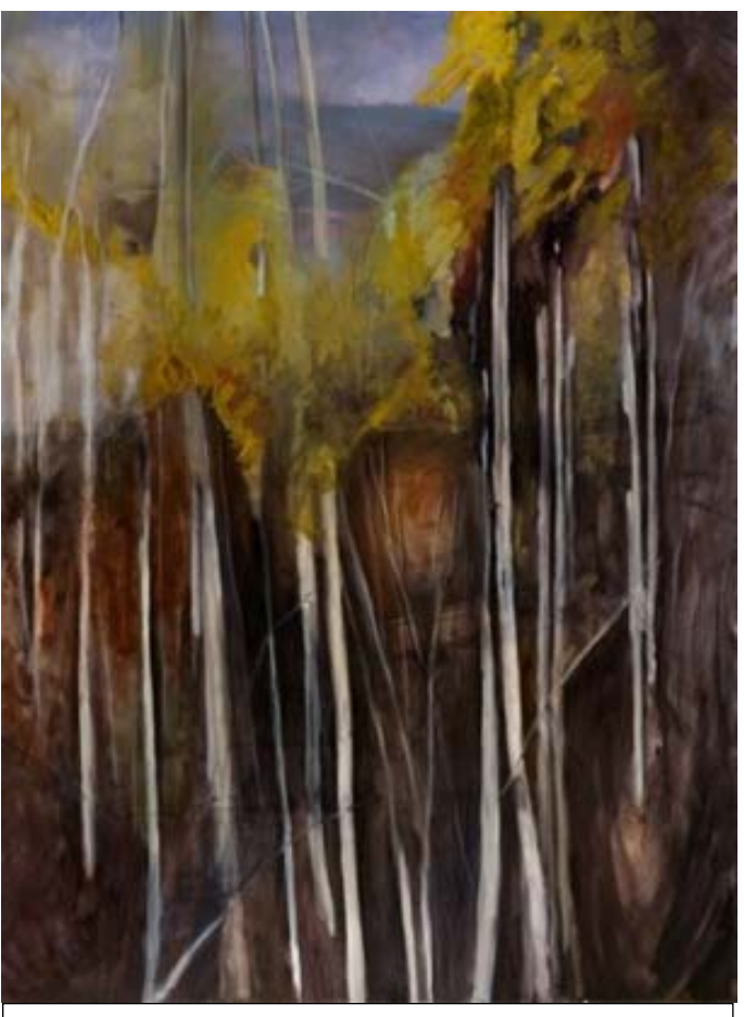
FIGURE 6. Giallo Oil on canvas, 182.9 x 137.2cm, 72 x 54 in

That was eight years ago. This morning, with works from my series Landscape—Love & Longing (Fig. 5), I ask, in a world fraught with polluted politics, global environmental degradation and economic greed—a world where the race to keep up with the next best technological bell and whistle is often run against the wellbeing of its citizenry—of what value is a painting practice, particularly one with an eye for landscape and beauty?"