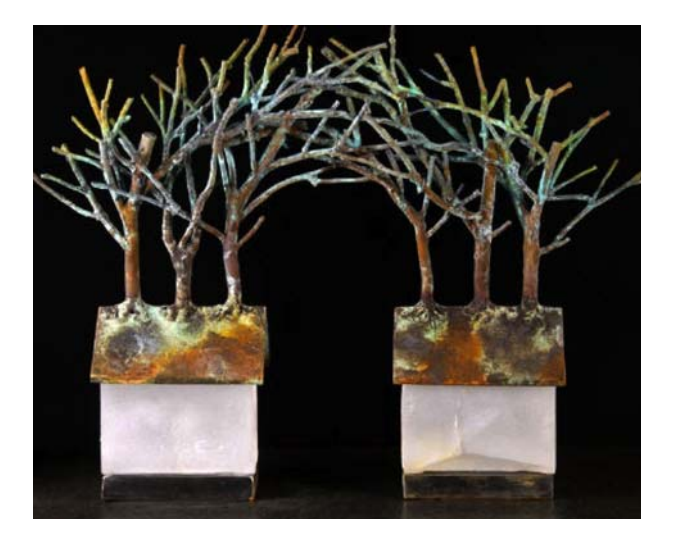
FIGURE 20. Crusty Branch Vessel, Peter Powning, 2004 Ceramic, 182.9 x 137.2cm, 72 x 54in, Retrieved June 9, 2015. From:<u>http://www.powning.com/peter/index.php?option=c</u><u>om_g2bridge&view=gallery&ltemid=90/&g2_itemId=796</u>.

FIGURE 19. Albero Nudo Oil on Canvas 182.9 x 152.4 cm, 72 x 60in