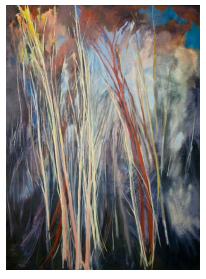
FIGURE 18. Scuro, Oil on canvas, 243.8 x 182.9cm, 96 x 72in

and institutions of relative and differential power..." (p. 25)...Where talk of beauty returns "on the basis of a 'principled aesthetic' that acknowledges the complex intersections of the aesthetic and the political, as they relate to questions of gender..." (p.29). Aesthetic criteria that looks at gendered judgments, what is said as well as gendered images, what is seen (Fig. 18).