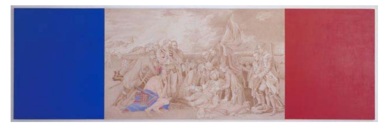
FIGURE 16. Kanata, Robert Houle, 1993. Retrieved June 9, 2015. From: http://www.gallery.ca/en/search?ga_search=kanata&ga_category=Entire-Site

which was the perennial problem of Canadian identity, and of course there was the question of the $1.8 million dollars paid for it. Five years later the National Gallery acquired Canada's Anishinabe artist Robert Houle's (1993) Kanata (Fig. 16) a re-creation of Benjamin West's (1770), The Death of General Wolfe (Fig. 17).