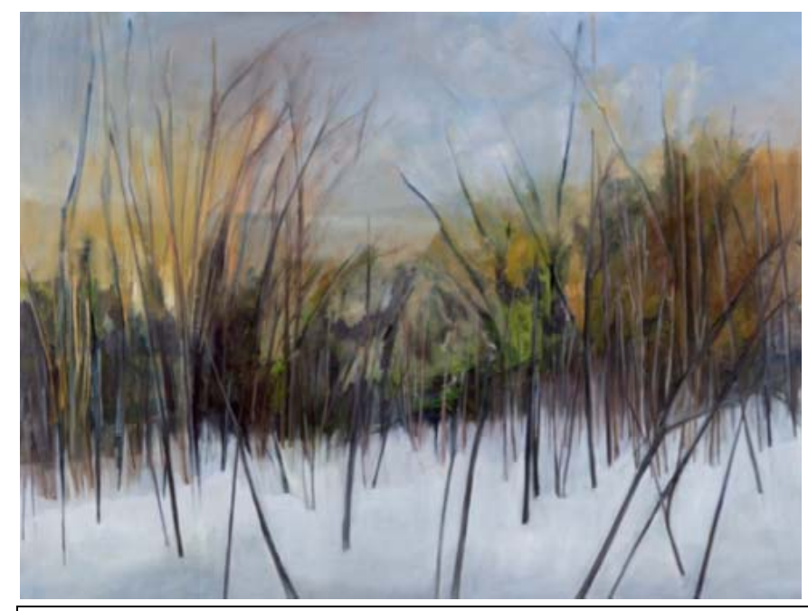
FIGURE 22. Early Winter, Oil on canvas, 182.9 x 137.2cm, 53 x 72in

on TV, in movies, songs and poems, or those I had actually experienced, the maple tree in front, the peach tree in the back garden, our trip to the Catskill Mountains, school