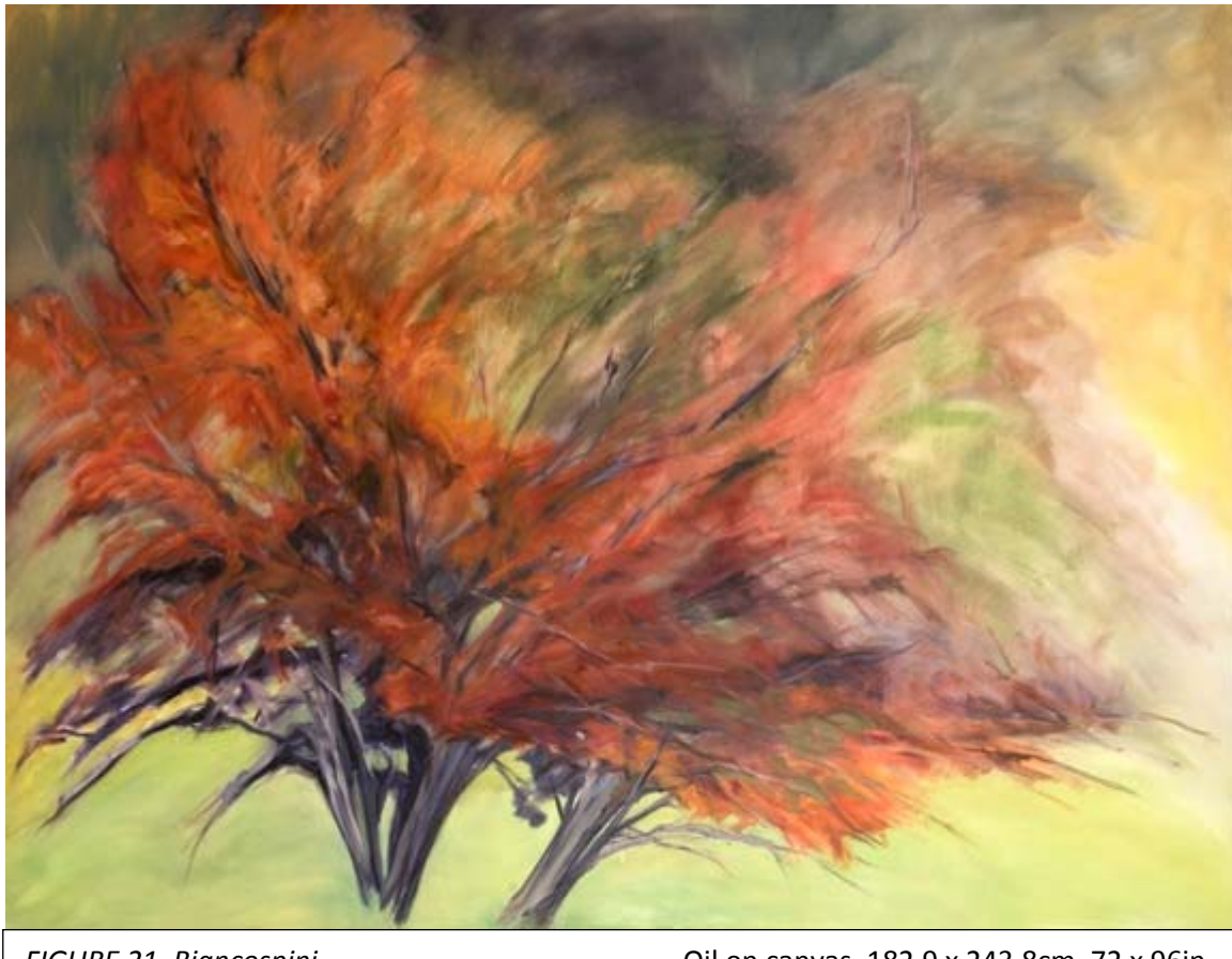
FIGURE 21. Biancospini