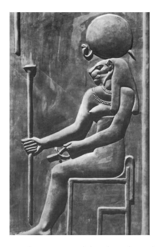
Lion-headed goddess Sekhmet seated, wearing sun disk with pendant cobra on head, holding <u>ankh</u> and papyrus scepter. Egyptian relief.

Bastet was also associated with an important musical instrument, the sistrium. Cats often on the handle of this instrument. Its music was associated with fertility and regeneration and was linked to the cat's reproductive power.