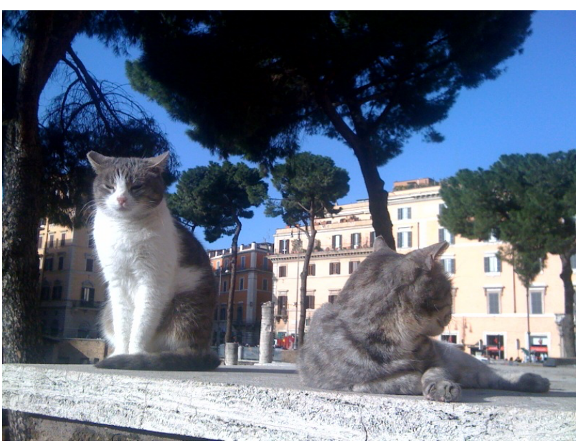
Photos taken with my IPhone in the heart of Rome on December 23rd, 2010