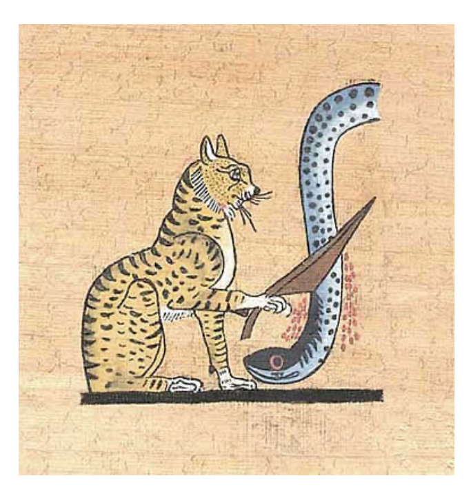
The sun, god Atum-Ra in the form of a cat confronting Apophis, the serpent of darkness. Tomb fresco, Deir El-Medina 1300BC