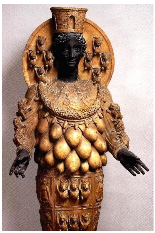
Artemis was represented with many breasts and animals in the lower part of the body (including cats) as a universal mother, nourishing life many of these statues are found (Clockwise from top left - 1-Fountain in Villa d'Este in Tivoli 20 km from Rome, 2- Musei Capitolini in Rome – 3- Vatican Museum, 4- Archaeology Museum in Naples.)