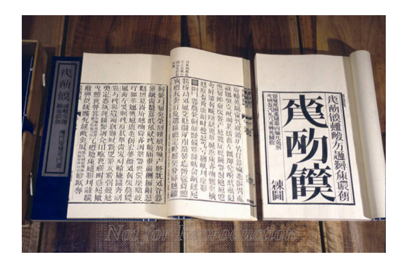
Figure 5: Pseudo Chinese Characters

One needs to know about four thousand Chinese characters in order to read the newspaper. The amount of devotion and work that went into the carving of these wood blocks and inventing four thousand meaningless Chinese characters that were different from the ten thousand existing Chinese characters was monumental!