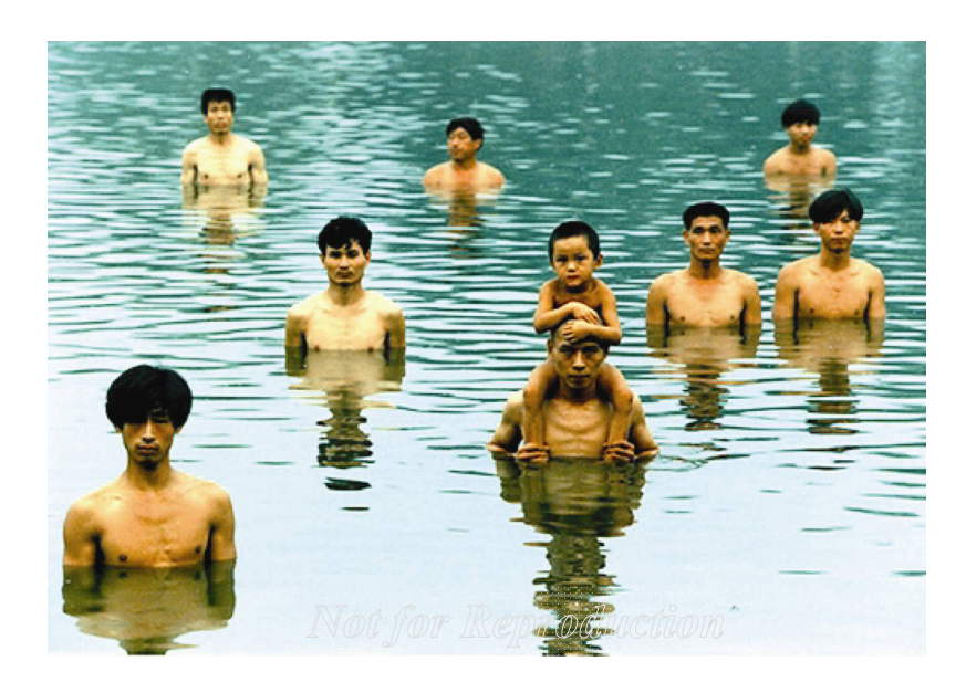
Figure 7: To Raise the Water Level in the Fish Pond

The first time I saw Zhang's work was at the 1999 exhibition of Chinese modern art in San Francisco titled "Inside Out—New Chinese Art." It was a photographic image of a pond with forty men, half submerged in water, looking at me directly (or so it seemed). Their mood was quiet and dignified. The artist was in the middle, carrying a small boy on his shoulder. The work was titled To Raise the Water Level in the Fish Pond . This image moved me and stayed with me, especially when I found out that the men with the artist were migrant workers who all came from poor rural areas of China to work in Beijing. These men were the neglected and invisible populace, yet they were also the greatly needed work force that built the turbo-charged economy of post Cultural Revolution China. Zhang said: "It is about changing the natural state of things, about the idea of possibilities" (Goldberg, 2009, p.19). I wondered: "Could the