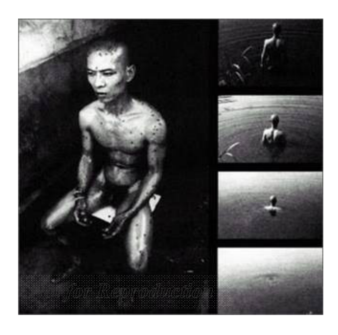
Figure 9: 12 Square Meters