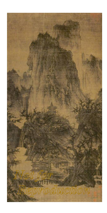
Figure 1: Chinese Landscape Painting