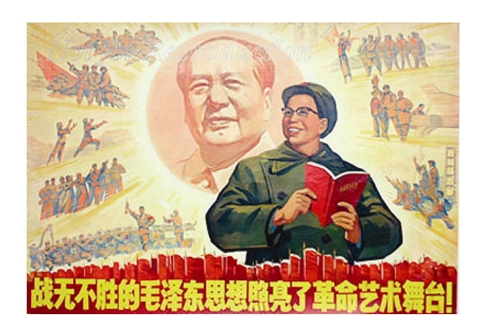
Figure 2: Revolutionary and Propaganda Art

In the early 20th century, Chinese art was dominated by landscape painting. During Mao's era, revolutionary and propaganda art were the sanctioned form of artistic expression. I propose that Chinese avant-garde art is