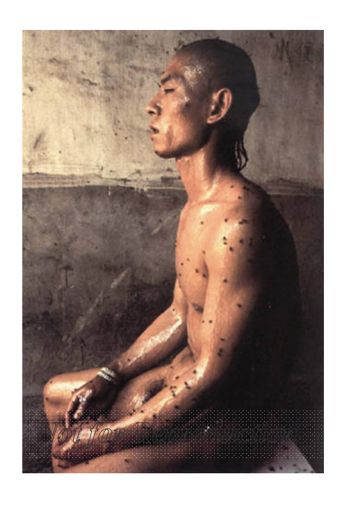
Figure 8: 12 Square Meters