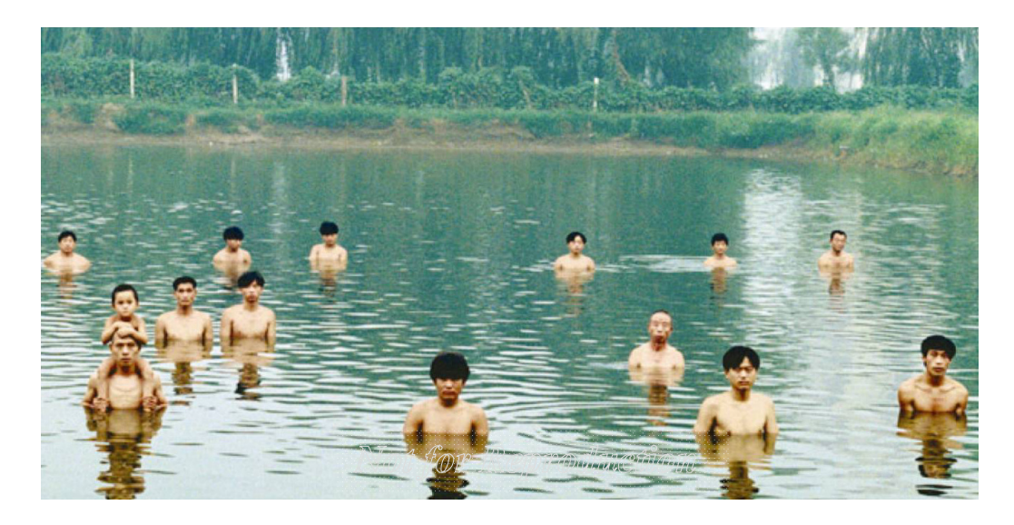
Figure 6: To Raise the Water Level in the Fish Pond

The body, often his own naked body, was Zhang Huan's medium in his early performance art.