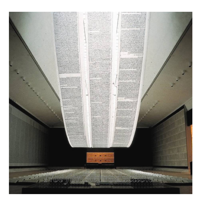
Figure 4: Book from the Sky

had been conceived and carved by the artist, who had worked on them meticulously for a period of over three years. The atmosphere of the installation was serene, elegant, and even comforting. But as one drew closer, everything changed. These printed characters were unreadable and meaningless. NOBODY could read them.