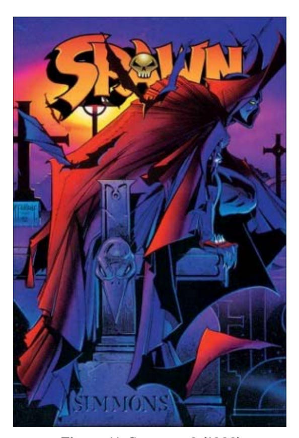
Figure 11: Spawn n.2 (1992)

Even without reading any sample of Spawn's comics, the narrative provided above can already lend itself to be interpreted as symbolically as any myth or fairy tale towards understanding deeper layers of today's human psyche's problems, conflicts and challenges. In summary, the essential plot tells us that Spawn is a cursed and revengeful creature with a flawed mind, who,