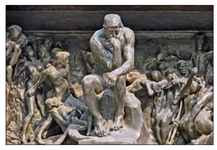
Figure 10: Top of the Gates of Hell (A. Rodin)