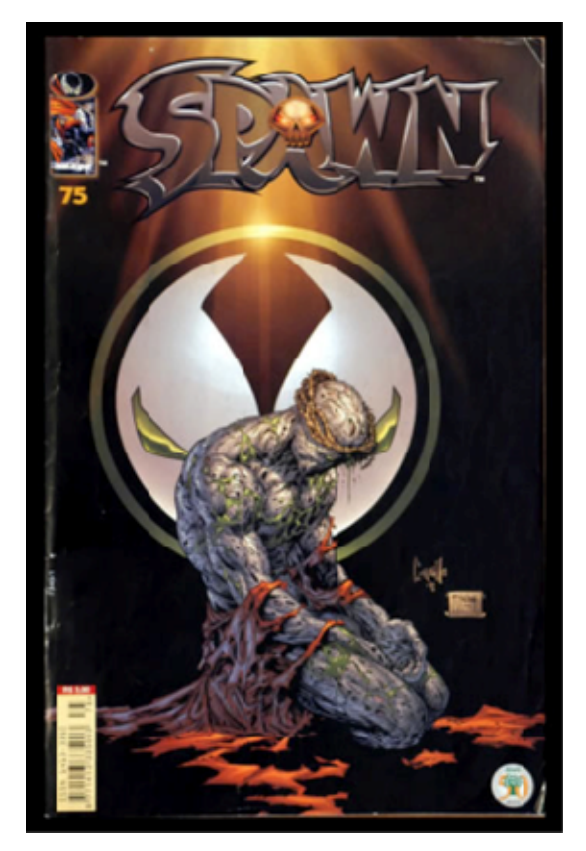
Figure 24: Spawn n.75, Sacred Ground (1998).

Similar to the way that violence is a magnet and, like a 'Pandora's box', it is difficult to keep it restrained after the arousal cascade is triggered, the flipside of the scapegoat archetypal (sacrificial) role is to absorb into his flesh and psyche (back into the 'box') the same violent and disturbing emotions caused by the horrors of collective wounding of war.