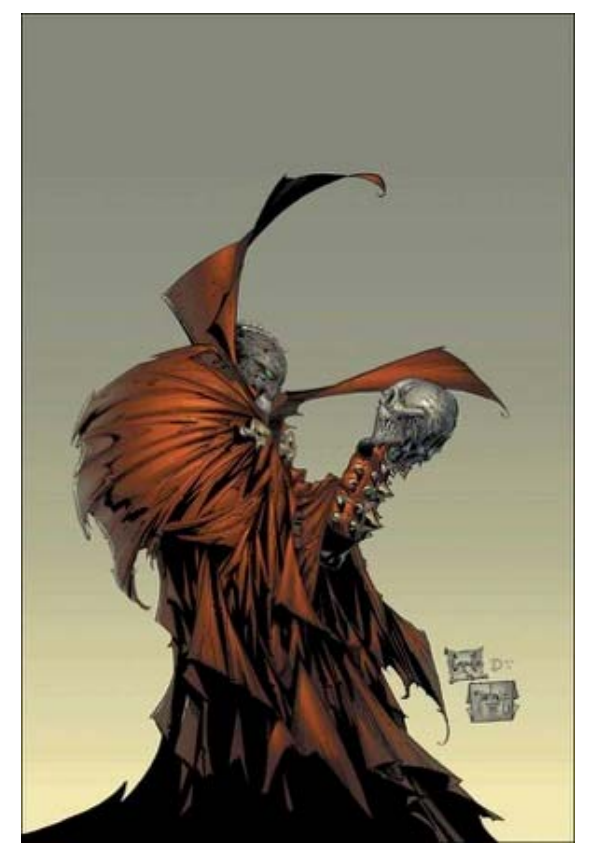
Figure 2: Spawn n. 81 (1999)

could be so deeply connected with archaic and shadowy aspects of our human condition.