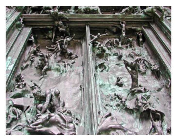
Figure 16: another view from below of The Gates of Hell (A. Rodin)