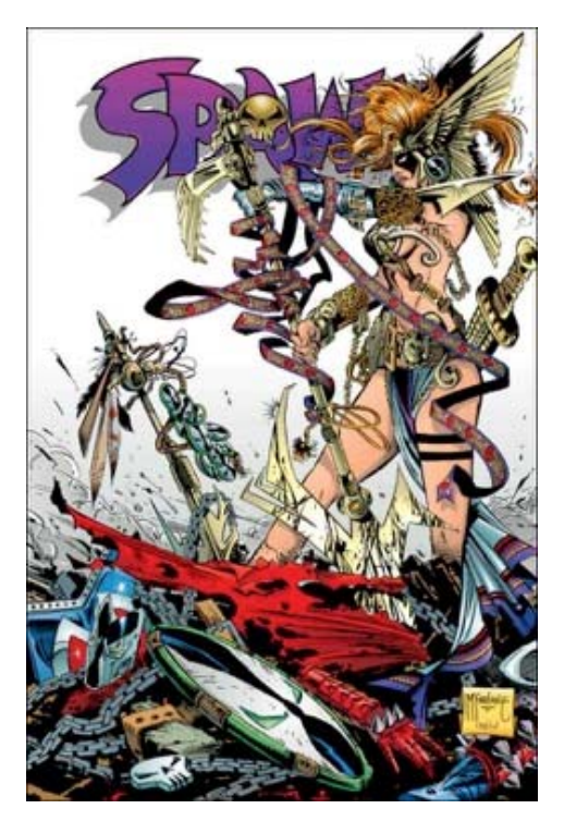
Figure 18: Angela, an angel hunter of Spawns

And, finally, on a more psychological level, Spawn meddles with destructive, obscure and paradoxical human desires and emotions that are hard for us to deal with and accept as part of our own selves and our human nature. This conflictive aspect of our souls, namely, the frequent inability and insufficiency to withhold the tension of the opposites, opens room for unconscious and shadow projections to take place. This leads us to the scapegoating mechanism, which is a very complex psychological phenomena, also beyond the scope of this article but, nevertheless, fundamental in our next topic for analysis: Spawn can also be seen as a metaphor for post-traumatic stress disorder<sup>15</sup> (PTSD) symptomatology, which has afflicted thousands of soldiers who have survived war. I will come back to this correlation of Spawn, the scapegoat phenomena and the PTSD among war veterans later in this article.