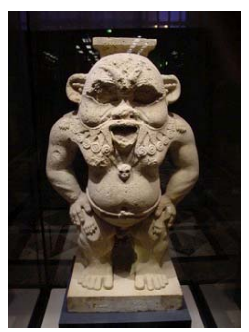
Figures 8 and 9: Clown (Spawn n. 12); Bes, Egyptian deity

Gradually, however, as the saga unfolds, Spawn learns more about himself, his personal history, his ancestral origins, and his damnable fate. He strives to use his new skills with more wisdom in order to reverse the evil curse and become the savior and redeemer for mankind. A key figure in his learning process is the old, wise ex-Spawn Count Nicolas Cogliostro<sup>6</sup>. In spite of his support, Spawn's ultimate goal of reversing this evil curse is hindered for several reasons, the most relevant of which are the following (in parenthesis I suggest some possible interpretations): The memory of his past life as Al Simmons is flawed and fragmented, which confuses him and misleads him when making decisions that require judgment and maturity. (Postmodern secular society has become alienated from many of its mythical and sacred values and roots. Most of the urban population does not have sufficient historical knowledge or cultural conscious memory; thus, daily choices and decisions are often extremely individualistic, relativistic and misled<sup>7</sup>).