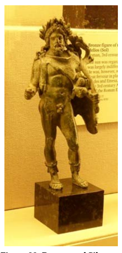
Figure 22: Roman god Silvanus.