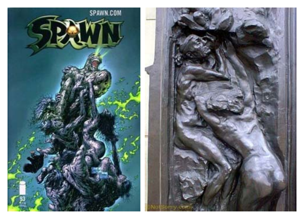
Figures 14 and 15: Spawn n. 93; detail from The Gates of Hell (A. Rodin)

In a more philosophical and ontological perspective, Spawn's 'dead-live limbo' condition is a constant reminder of the dreadful reality of our finitude and the inevitability of death on a symbolical and concrete level.