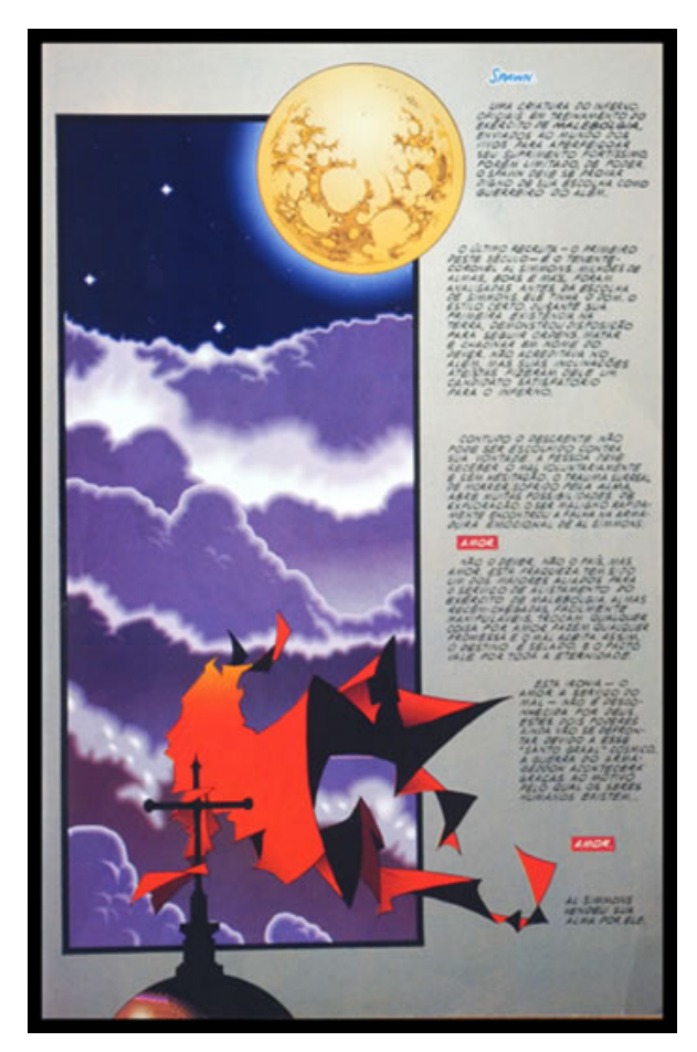
Figure 13: Spawn n. 11 (1993), first page.

It is now becoming clearer that Spawn meddles with many issues that can be disturbing and even controversial, which go beyond the excesses with cruelty and violence. Spawn, as other canonical comic book superheroes are, is a fertile and compelling field for an in-depth psychological survey. The more we look into it, the more it reveals different levels of meaning, which are, in fact, interrelated. Although it is not possible and neither is the objective of this article to expand our analysis into this large scope of possible areas of interpretation, I find it important at least to mention a few of them, for these other dimensions of human knowledge are always present as a "noisy" background in our psyche, which influence directly or indirectly our perception of ourselves, of our immediate environment, and consequently our daily behavior. Moreover, these considerations combine for a comprehensive visualization (like contemplating a mandala) of the controversies and taboos that Spawn and other comics' cultural phenomena may arise.