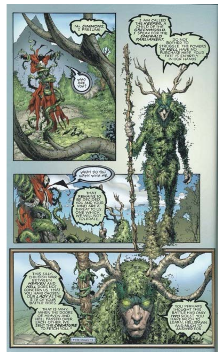
Figures 21: Spawn n. 75, Sacred Ground (1998)