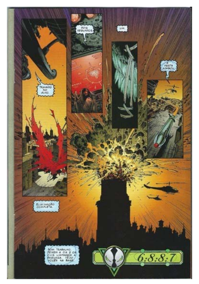
Figure 19: Spawn n. 35 (n.36 in the US, 1995)

Then, in Spawn No. 105, named Retribution Overdrive , published in February 2001, there was another reference that corresponds even more obviously to the coming 9/11 attacks: