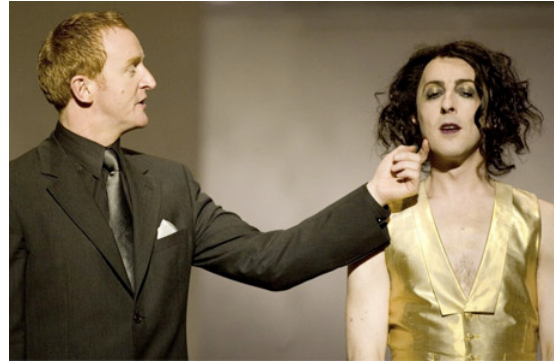
Image 2 Alan Cumming as Dionysus, Tony Curran as Pentheus, from alancumming.com .

Knowing that The Bacchae was written as a stage play, readers can imagine how this scene would be staged. Pentheus slowly walks around Dionysus, stroking the god's long hair, touching the god's smooth cheeks. The king describes the body of Dionysus in erotic terms. He acknowledges the beauty of Dionysus, but then rushes to reassert his own heterosexuality, claiming to only notice what the women of Thebes might appreciate. At the same time, Pentheus highlights Dionysus' feminine qualities to exclude the god from stereotypically male roles such as wrestling, hunting, and outdoor labor.