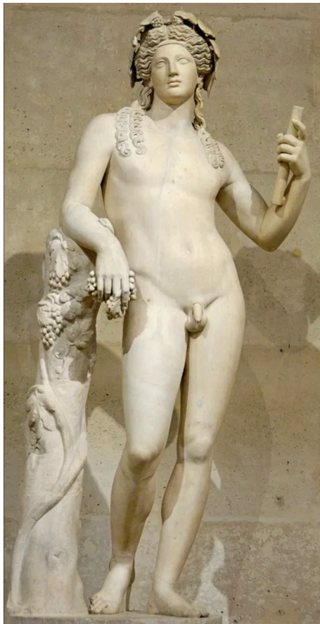
Image 1 Second century Roman statue of Dionysus, Louvre Museum

himself in glory, but when he did so, both she and her house were destroyed. Zeus rescued Dionysus from Semele's womb, and sewed the fetus into his own thigh until it could be fully formed. As a consequence, the young god was called twice-born, delivered first from a female, but second from a male. For his safety, Dionysus was entrusted to mortals who raised the child as a girl. This unusual origin would foreshadow Dionysus' own peculiar nature.