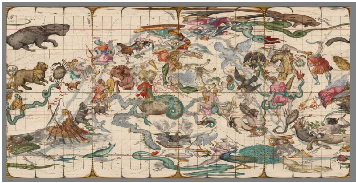
Celestial Atlas by Pardies (16th Century)