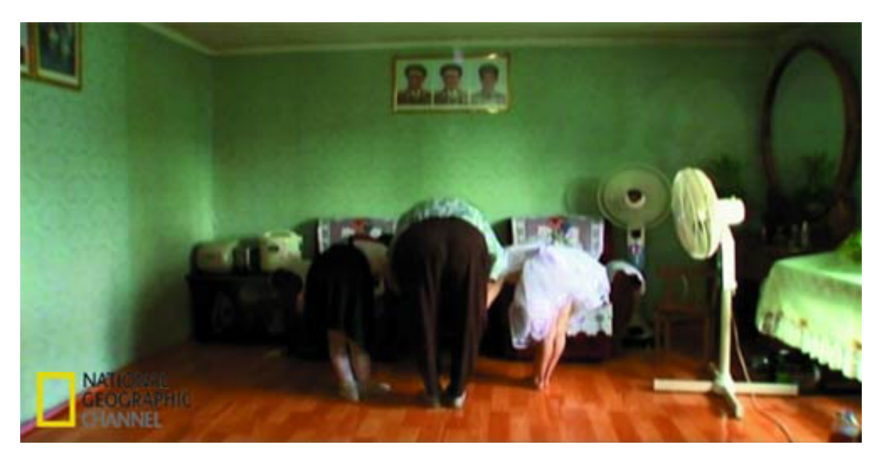
Image 6 A picture of North Korean family in the worshiping ceremony for Kim family. http://weekly1.chosun.com/site/data/img_dir/2007/06/01/

Meanwhile, extreme conservatives in South Korea and America mock North Korea for its insanity or become infuriated by its abuse of human rights. It is part of human nature to want to help the oppressed, but we may become hypocrites by projecting our own insanities onto North Korea without reflection on our own flaws and limitations. Hasty intervention often does not guarantee real improvements, and instead creates unnecessary tension among societies. For example, South Korean prisons do not provide beds for inmates and hot water is only given once a week for 20 minutes, regardless of the weather. Developed countries are still struggling with social injustices such as racism and unfair legal proceedings against minorities and poor people. Between 2007 and 2012, an estimated 630,000 people per year have experienced homelessness in America. More than 11,340 homeless people were reported in Korea as of 2016. Interestingly, South Koreans tend to consider