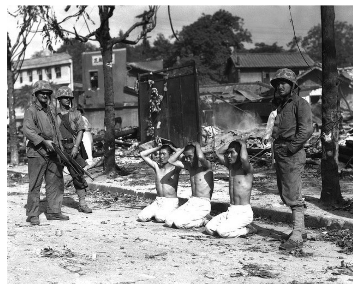
Image 5 Picture of American soldiers and Korean civilians. euinz.tistroy.com

In 1945, liberated Korea was divided in half by the victors of WWII. The Soviet Union occupied the North and UN and US forces occupied the South. The division of the Korean peninsula by the superpowers confused and rendered the Koreans powerless. Even before the Korean War broke out, the United States occupation of the South was seen as an invasion by the North Koreans and the Soviet Union occupation of the North was seen as an invasion by the South Koreans.