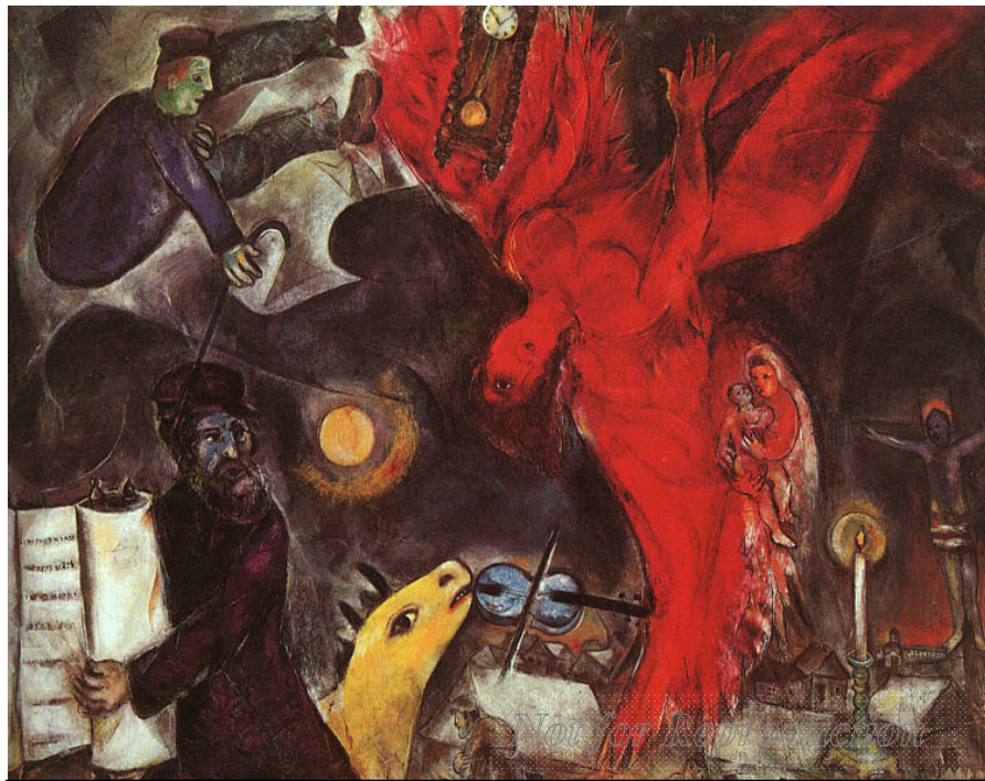
Figure 5 The Falling Angel . Marc Chagall, 1923-47

Sketching and painting in 1923, 1933 and 1947, Chagall created several versions of The Falling Angel (Fig. 5). Utilizing the image of the crucifixion in