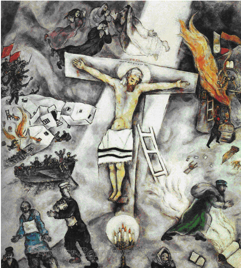
Figure 6 The White Crucifixion. Marc Chagall, 1939

In 1939, Chagall painted a tour-de-force entitled, The White Crucifixion .