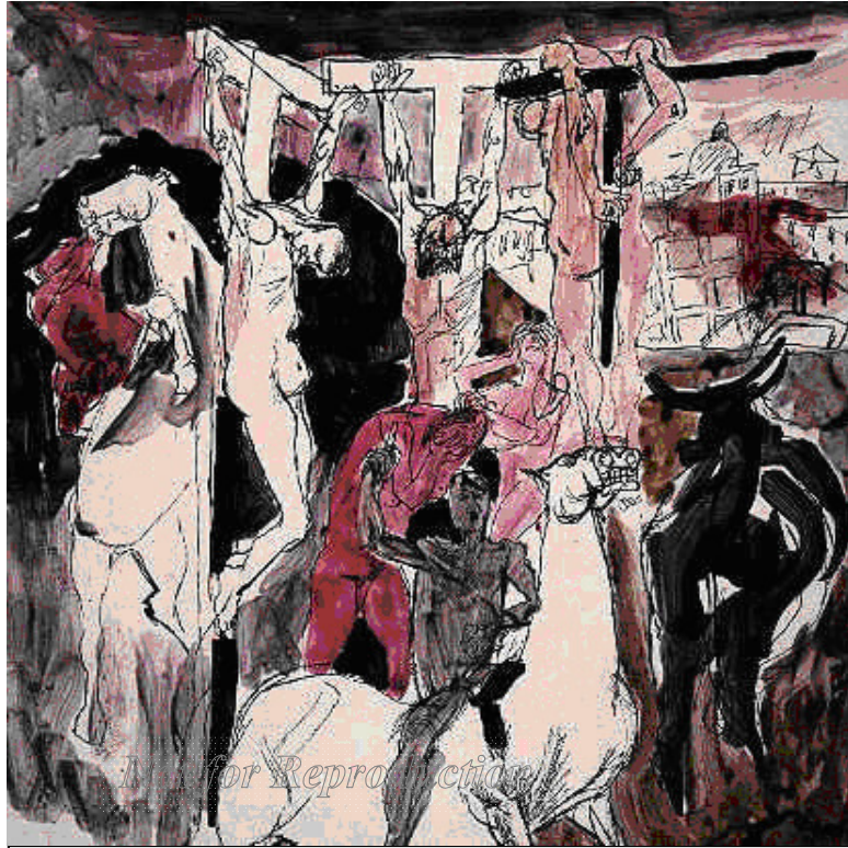
Figure 2 Die Passion. Renato Guttoso, 1940

Guttuso explained his use of the crucifixion image in this way, "This is a time of war. I wish to paint the torment of Christ as a contemporary scene ... as a symbol of all those who, because of their ideas, endure outrage, imprisonment and torment." These were dramatic re-visionings of