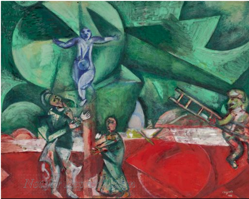
Figure 3 Golgotha. Marc Chagall, 1912