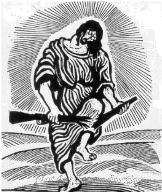
Figure 1 Otto Pankok, 1933

This novel use of the Crucifixion derives from two separate but related artistic traditions that became popular in the nineteenth century. The most well-known of these utilized elements of Christ's Passion, either within or removed from a biblical context, to symbolize sufferings of humanity, especially in times of war. (143)