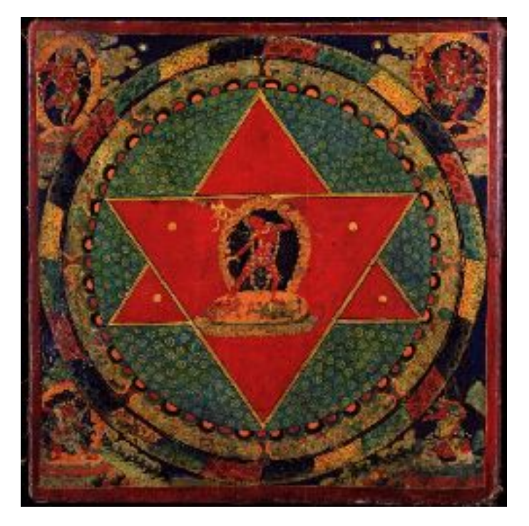
Figure 1 Mandala, Rubin Museum of Art