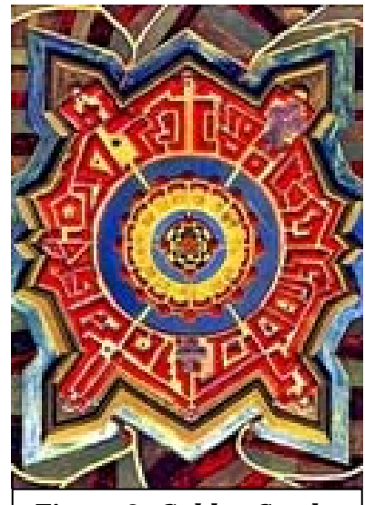
Figure 2 Golden Castle Mandala by CG Jung, 1928

Wilhelm's "Secret of the Golden Flower" arrived to receive Jung's introduction. Wilhelm's book with its "thousand-year-old Chinese text on the yellow castle, the germ of the immortal body" (1961, p. 197) as a central alchemical image echoed years of Jung's psychological experiences, which were reflected in his mandala drawings, as well as his dream of 1927 that has led to the creation of the Golden castle mandala days before the book arrived. It was for Jung a synchronicity that