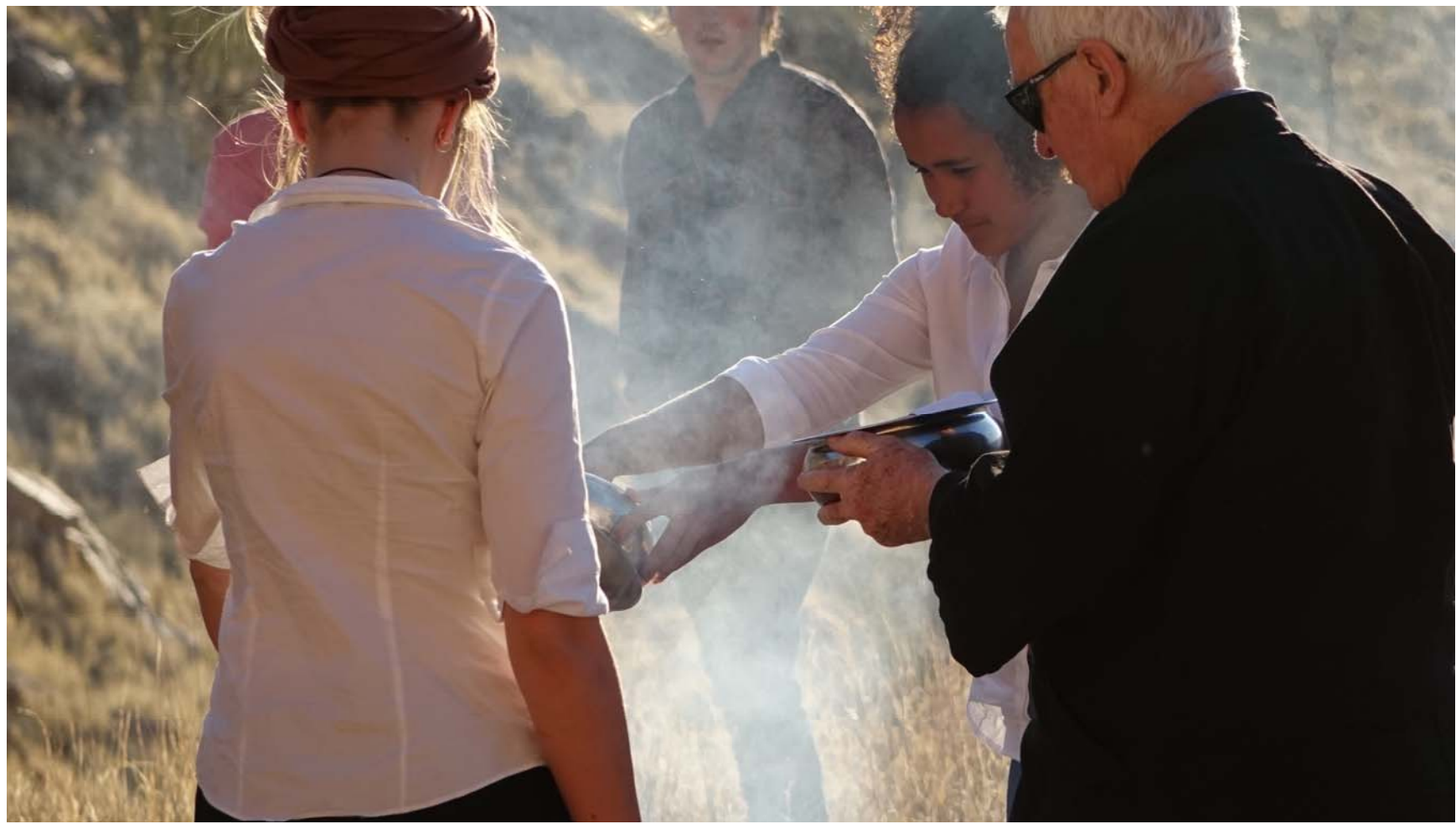
In our ritual libation, goat milk is offered to honour fire and earth.