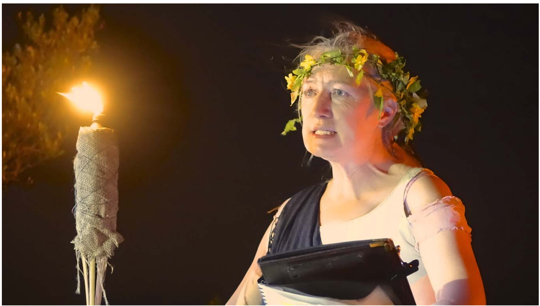
Demeter went looking for Kore. Where she walked, the plants died behind her. She was trying to see the face of the one who took Kore away. She went to her relatives, to Kore's father, Zeus. "You seen that slut of a daughter?" Father defended daughter, "My daughter – she's no slut!"