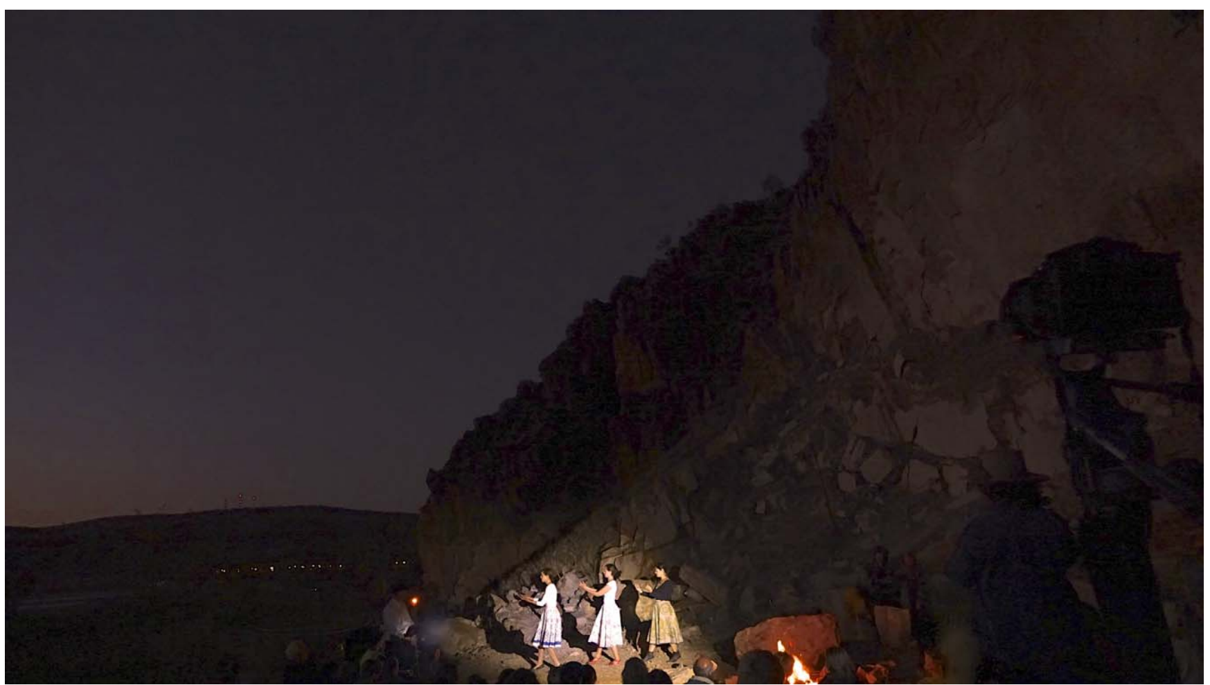
"What is this?" said Kore, "I have never seen this before. What is death?" She carried her dog in her arms. She followed her dog. She walked down, down into the rocks and the darkness.