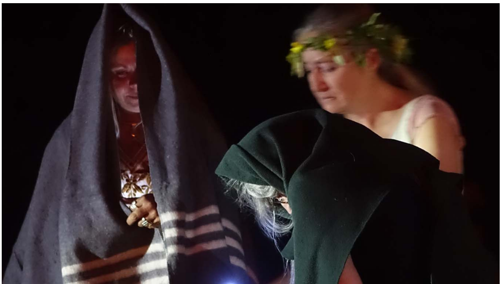
Demeter searches, sees people by a little fire. They let her into their fire "We got nothing to eat. My milk dries up, my baby's sick – he might die." Those people do not know that Demeter has lost her baby, brought the cold, stopped plants growing.