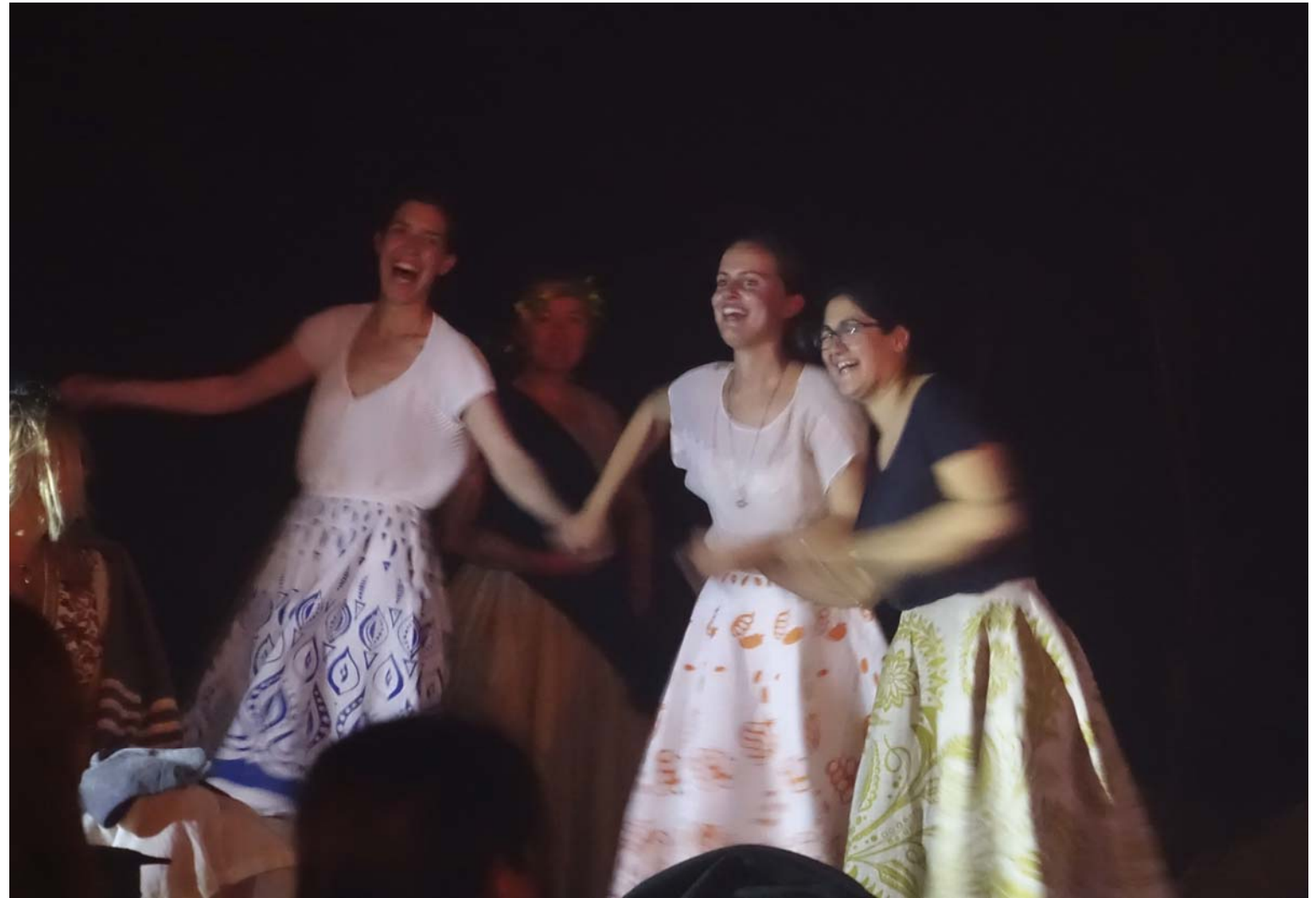
The world springs back to life. People sing. They go back to work in field and orchard. They harvest vines. They eat. They have fiestas.