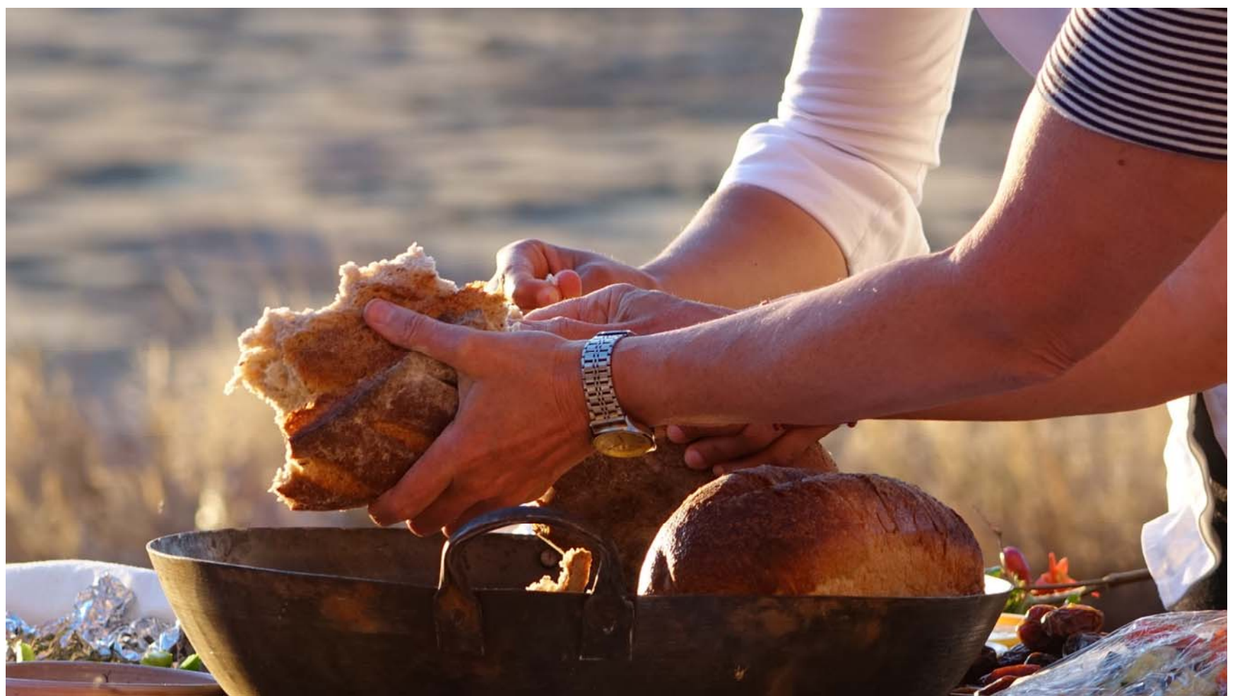
Hestia chides, "The humans don't know how to cook. They have to learn to make hot coals. They have to learn to roll and bake the bread." "I'll help," said Demeter. "We'll make the people happy."