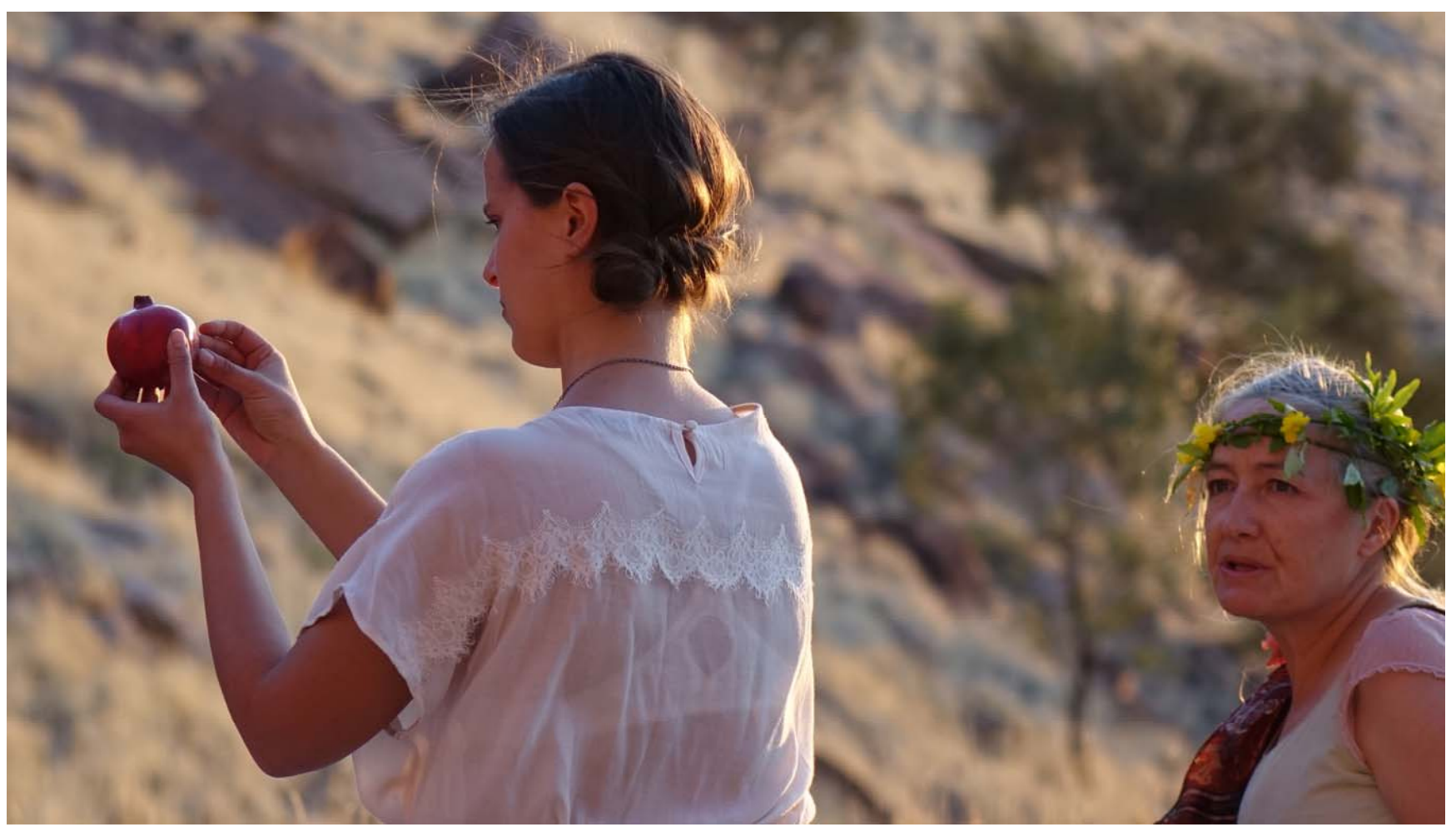
"This is Pomegranate", Demeter said. "Open it Kore! See the red seeds shine in the sun. Touch the juice. I am the womb of the world. Take it; eat this in rememberance of me."