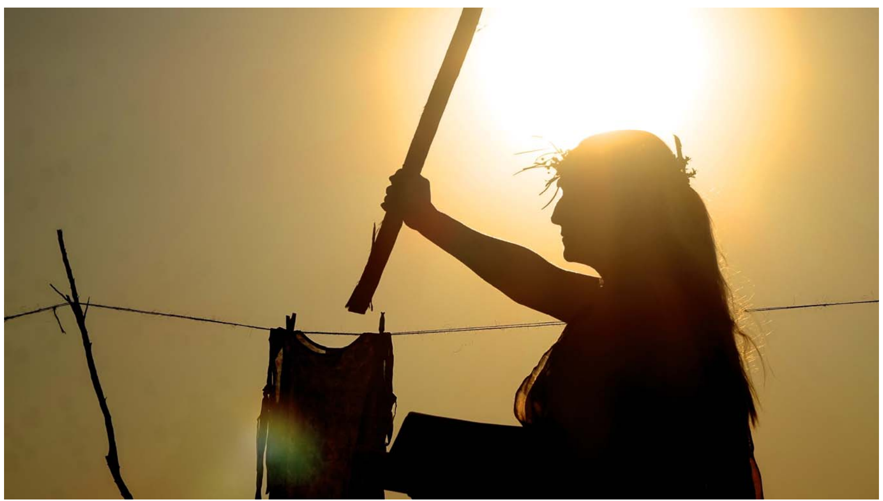
Demeter marks out a line between the mountains. The shining mountains, she calls them. She makes the line deep. It cuts through her body She cuts a long cut between her breasts. "Water runs always along this cut. Down this line a river will run." she says.