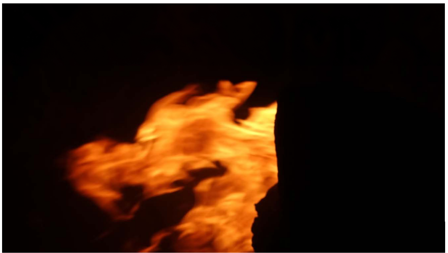
"You are very dark," Kore said, "I can hardly see you. Your hands move along the rocks and disappear." "I am very dark," Hades said, "You can hardly see me. You can feel me. My hands move along your skin and disappear."