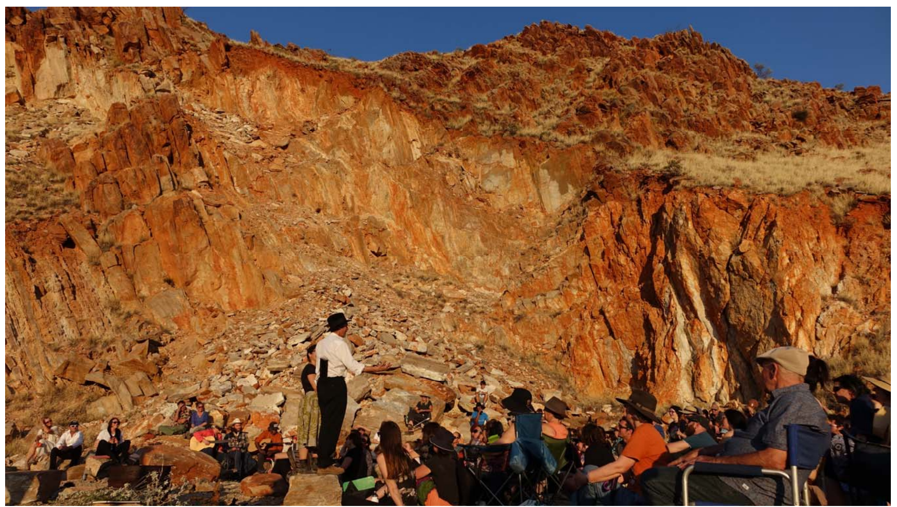
The quarry site