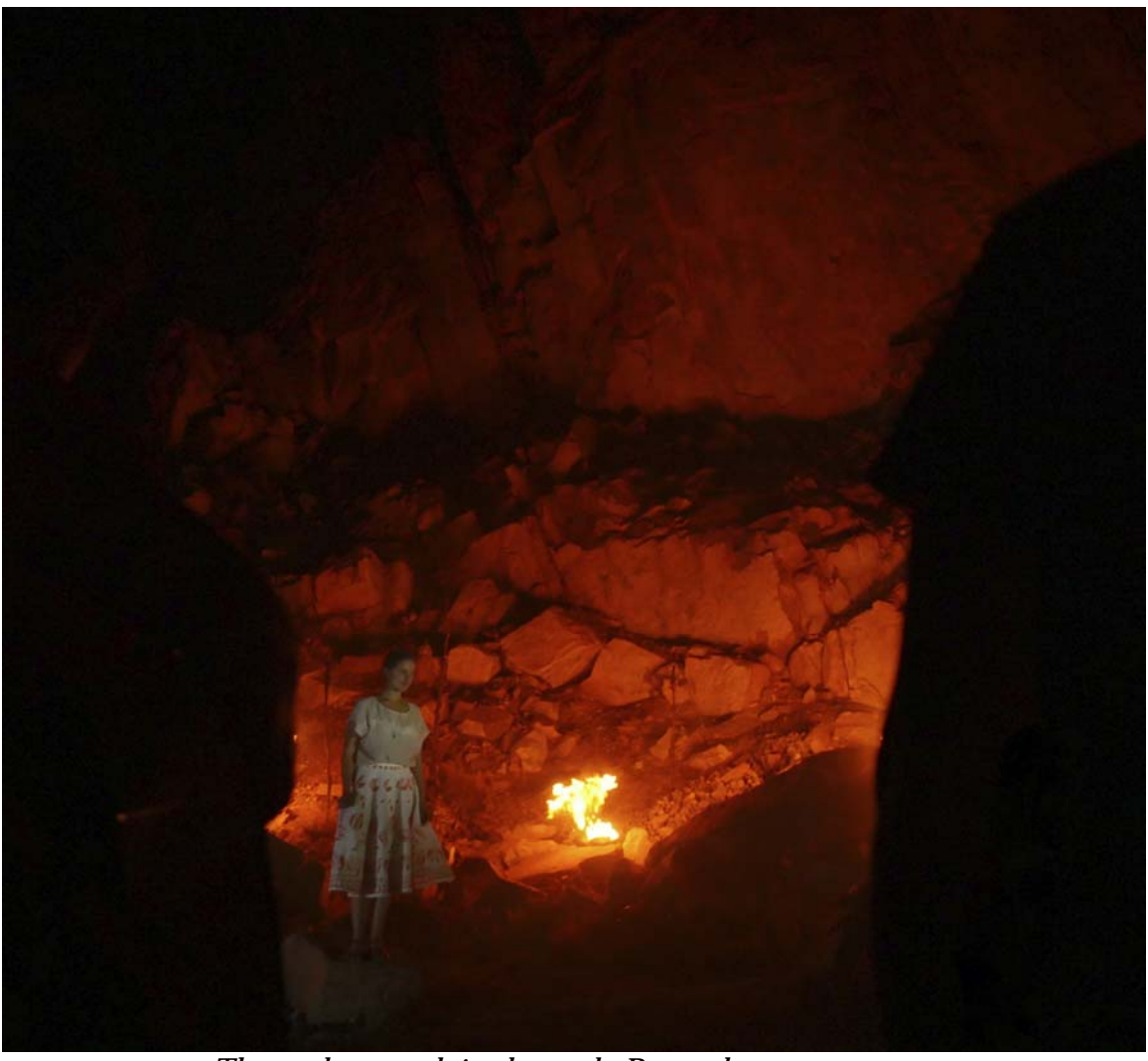
Through a crack in the rock, Persephone comes up.