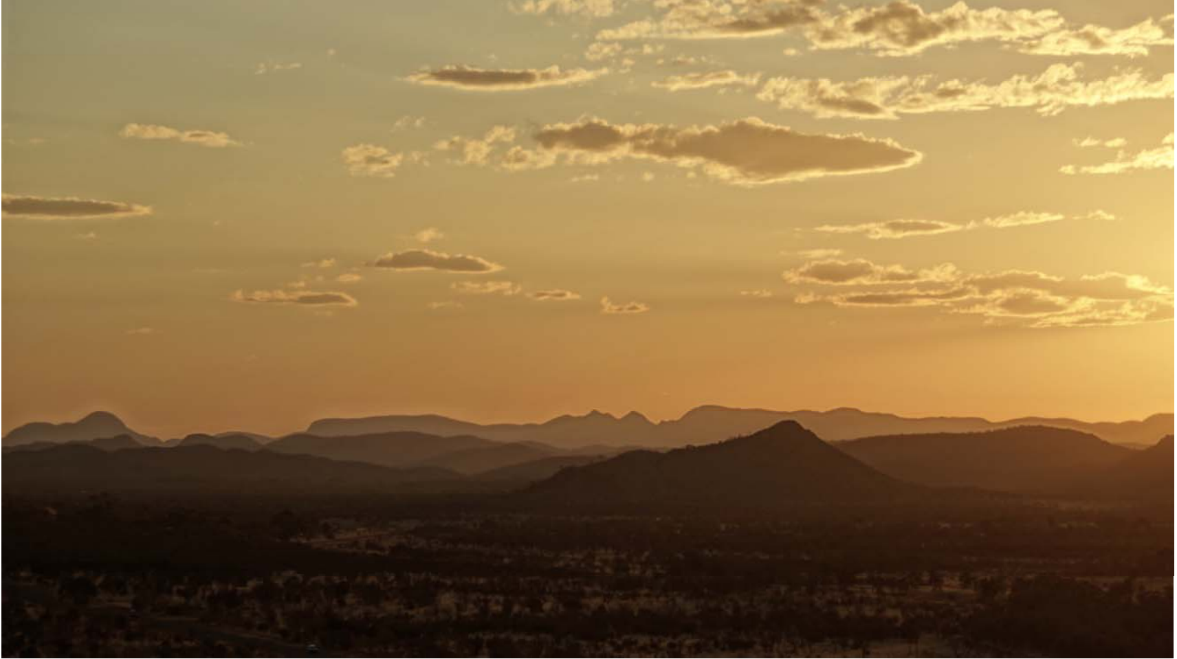
The lines Demeter draws are the lines we should not change. These places hold the world in balance. The rocks, the ranges, the valley, the river, the flow of clear water. She says, "I love this place. We love this place."