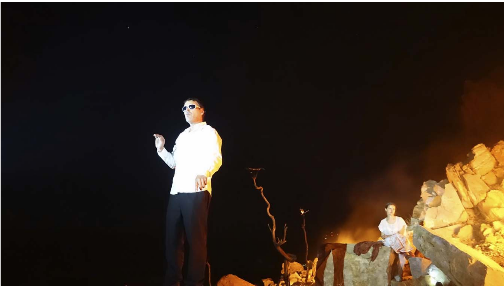
"People tell you different stories but no one saw them, only me – lizard on the rock. What happened to Kore? Nothing like you say. Pretty girl, stupid girl, followed her dog down. That black man grabbed her hair, snapped her like a fly. Took her away..."