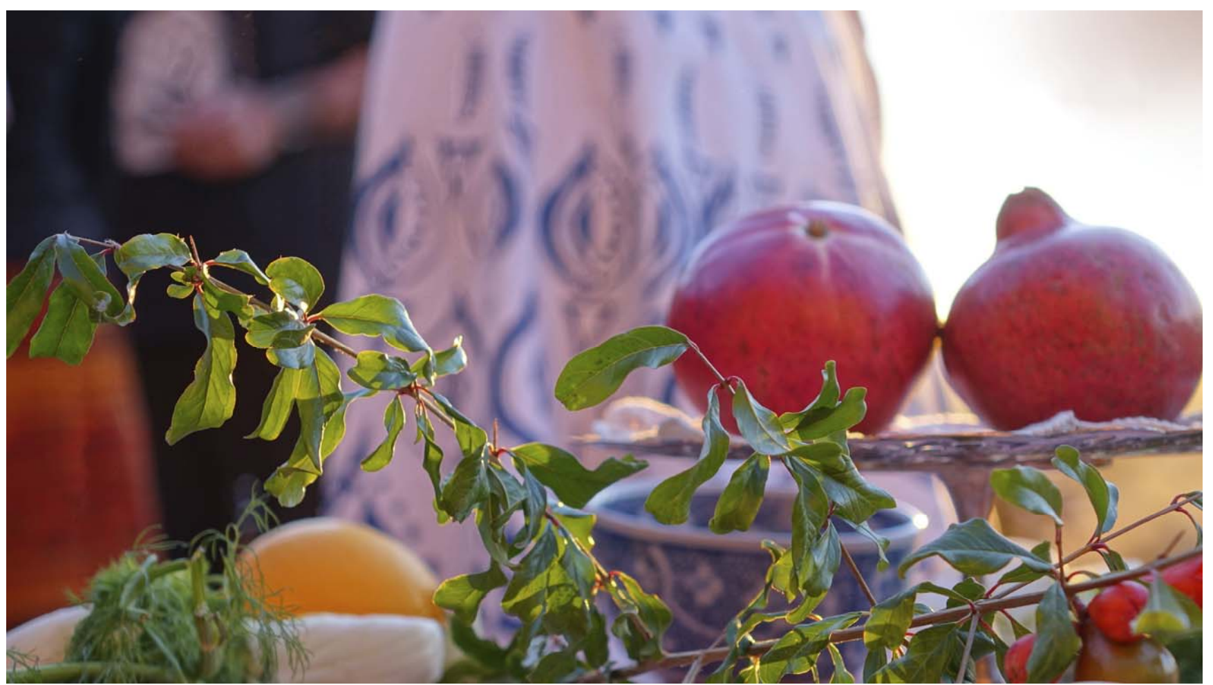
The foods shared at the picnic... spanakopita, tzatziki, olives, pomegranate, ouzo Pomegranate will nurture us.