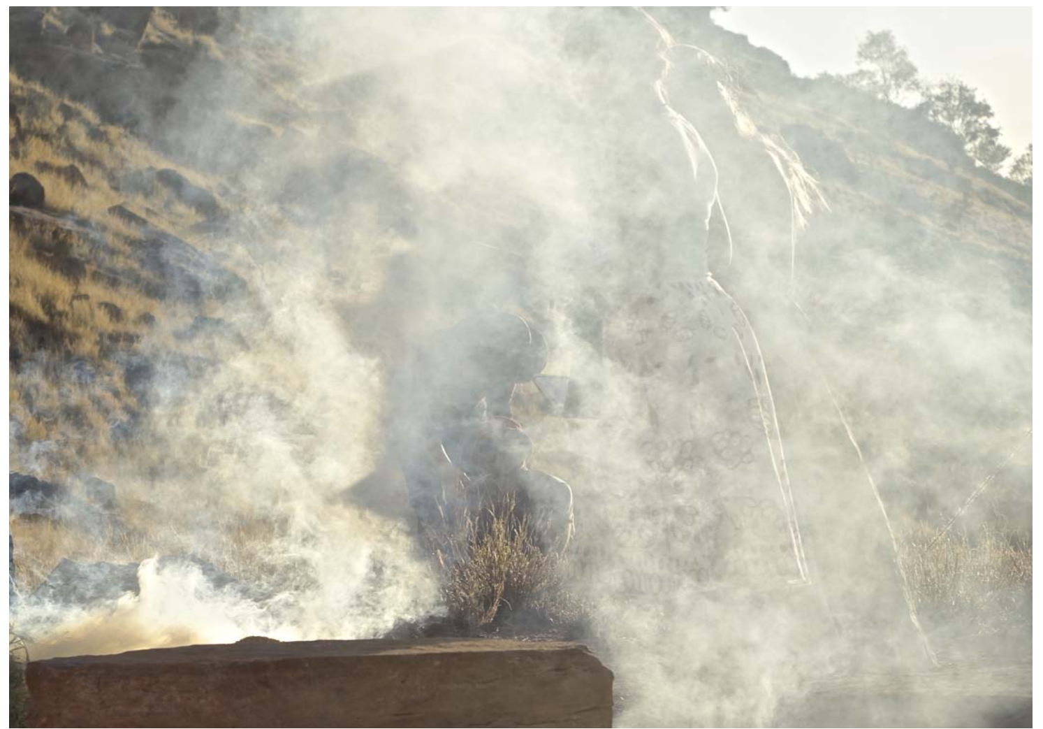
Pythia, the primal oracle, turns like smoke in the wind. The Snake turns her eye to Kore. The python calls "Kore, look at this place. Open your eyes, open your breath to the smoke." Pythia's mouth opens. Inside her jaws Kore sees the world beginning...