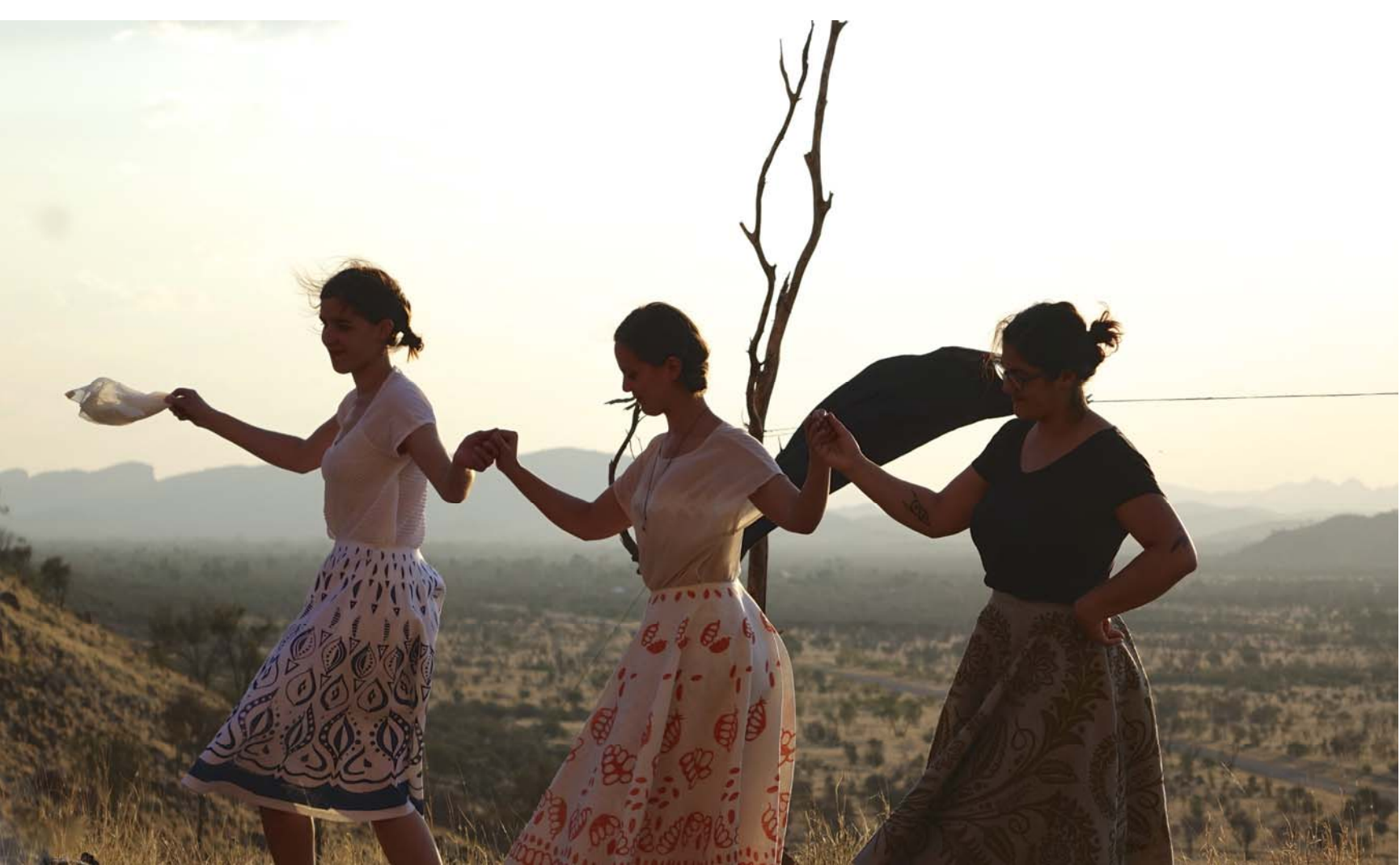
Three Graces and the Kore Dance honour Mother Daughter in the world.