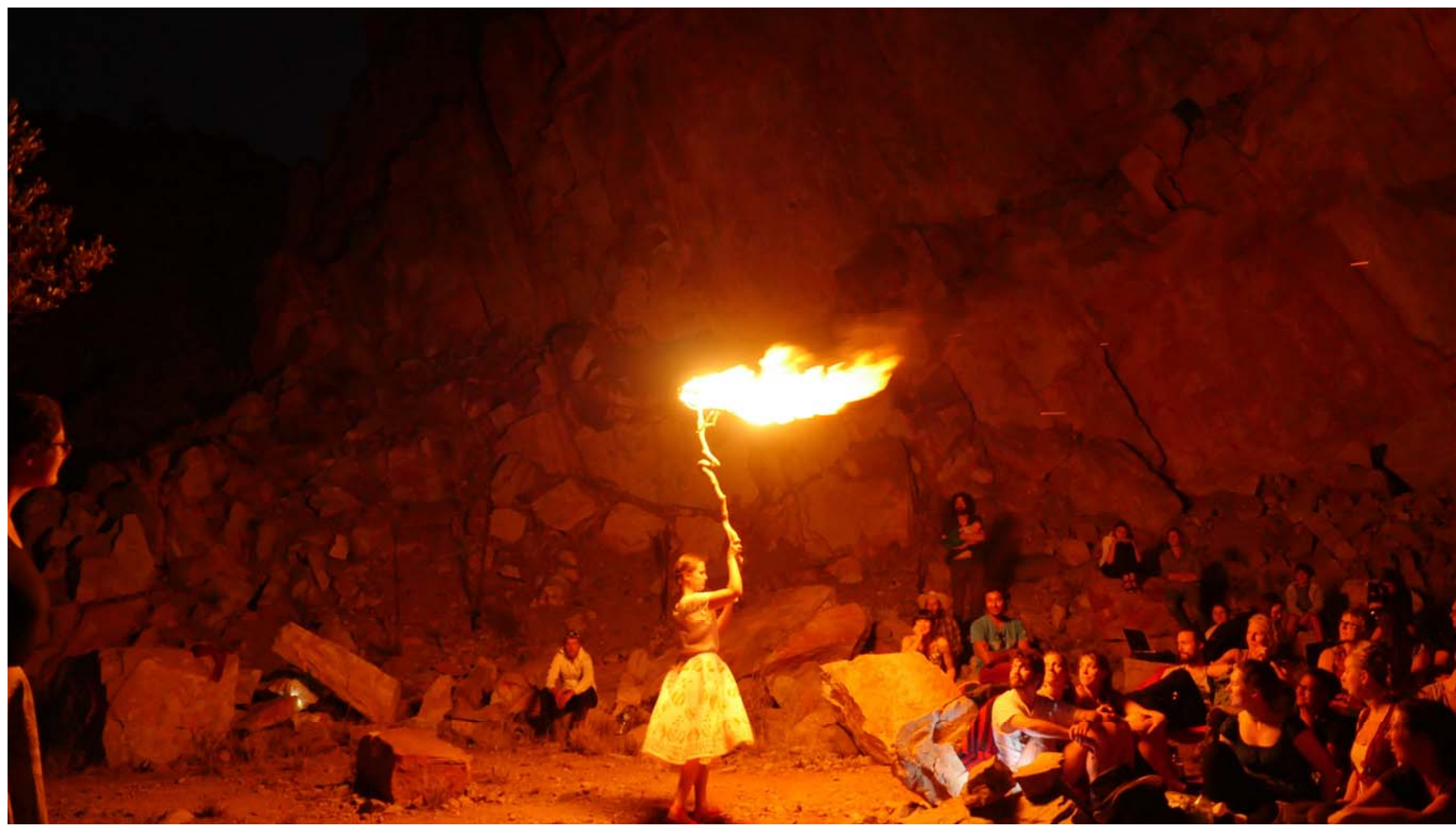
"The walls are black with smoke. There are drawings." said Kore. "These are to teach you," replied Hades. "Drawings of bison, gazelle, goat... Here are the roots of things, the seedbed... All these things die. And begin again. I am the continuing of things."