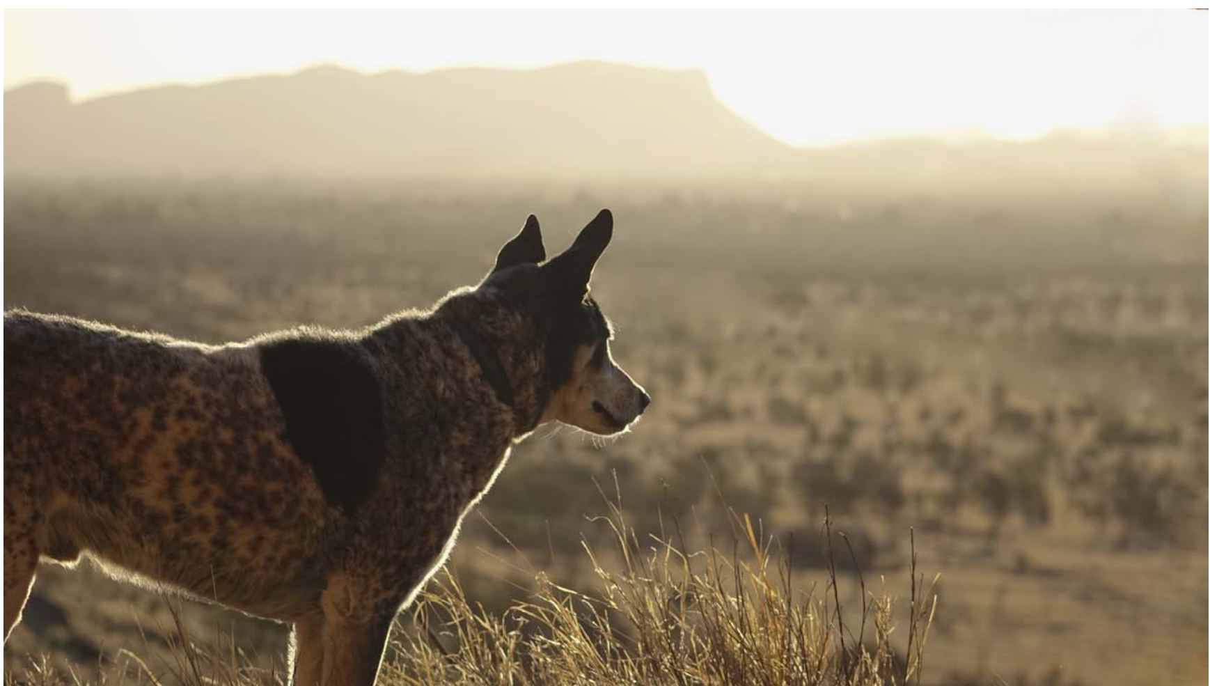
The Dog sat back on its haunches and said, "Does your mother think I don't see what she does? Where yellow flowers grow, there she stops for a piss. Where red poppies grow, she bled. Where trees grow strong in quiet places; she stopped to shit."