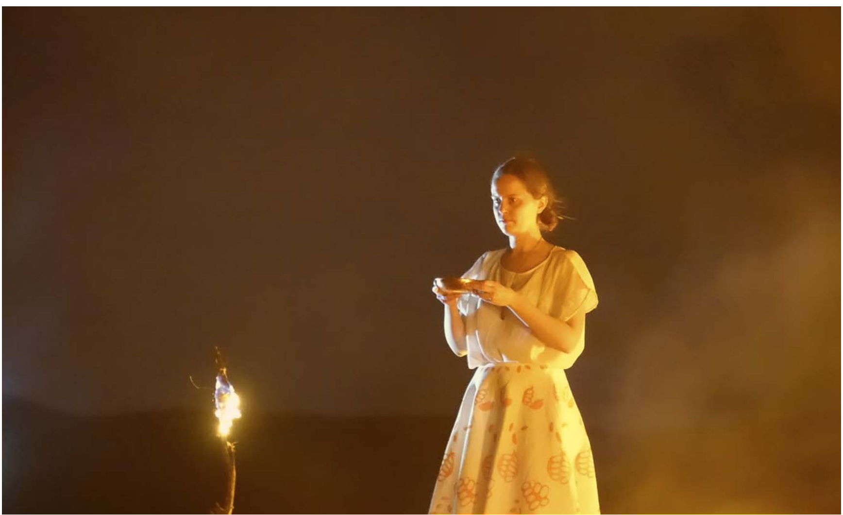
Wedding guests came. Hades placed wine before Persephone. "Take this. Drink this and remember me."