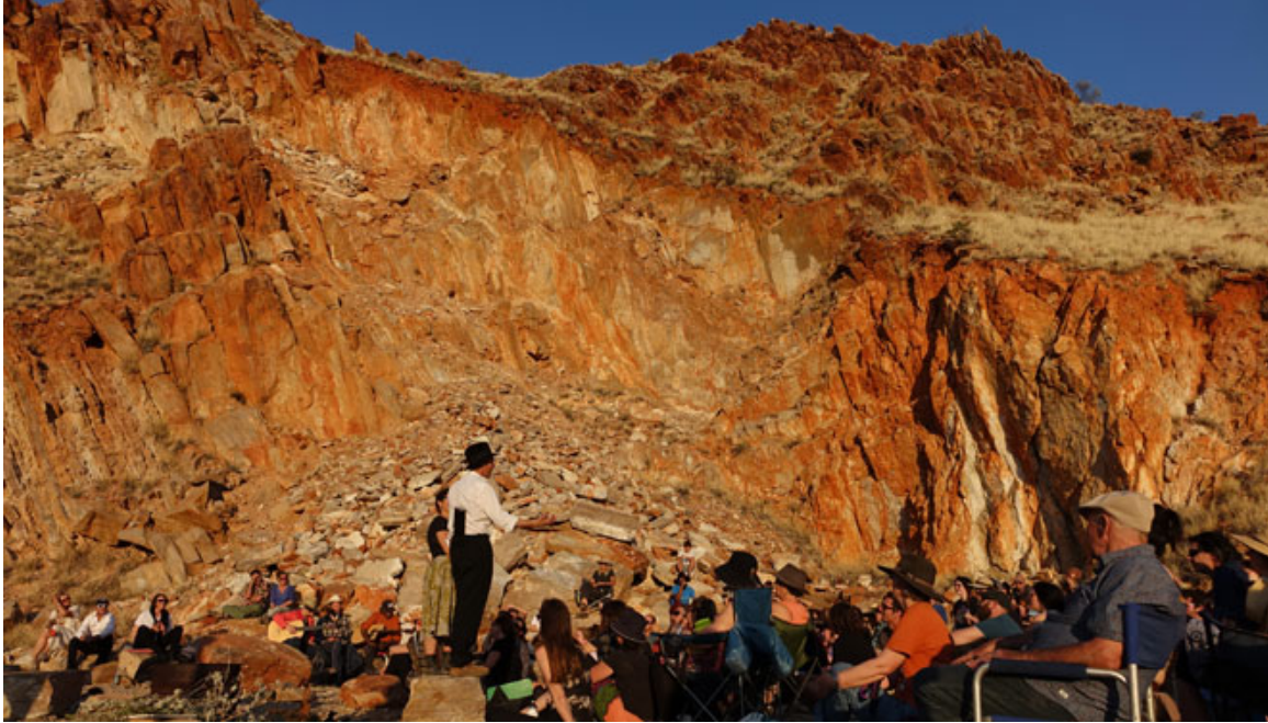
Gathered at the quarried Ilparpa site; Craig San Roque begins the story-telling.

It is as though a mouth in the rockface has been prised open and stomach contents disgorged, teeth too. This is the deepest of the scars left by the quarrying of stone from the range rising along the southern side of Ilparpa Valley. The disgorgement settles on a flattened turnaround for trucks and machinery, high above the valley; a second smaller turnaround has been carved out below. The road leading up to it has eroded into a deep gully; just a goat track at the side holds on, buttressed by buffel grass and rock. Up this track we go, for a picnic of promise.