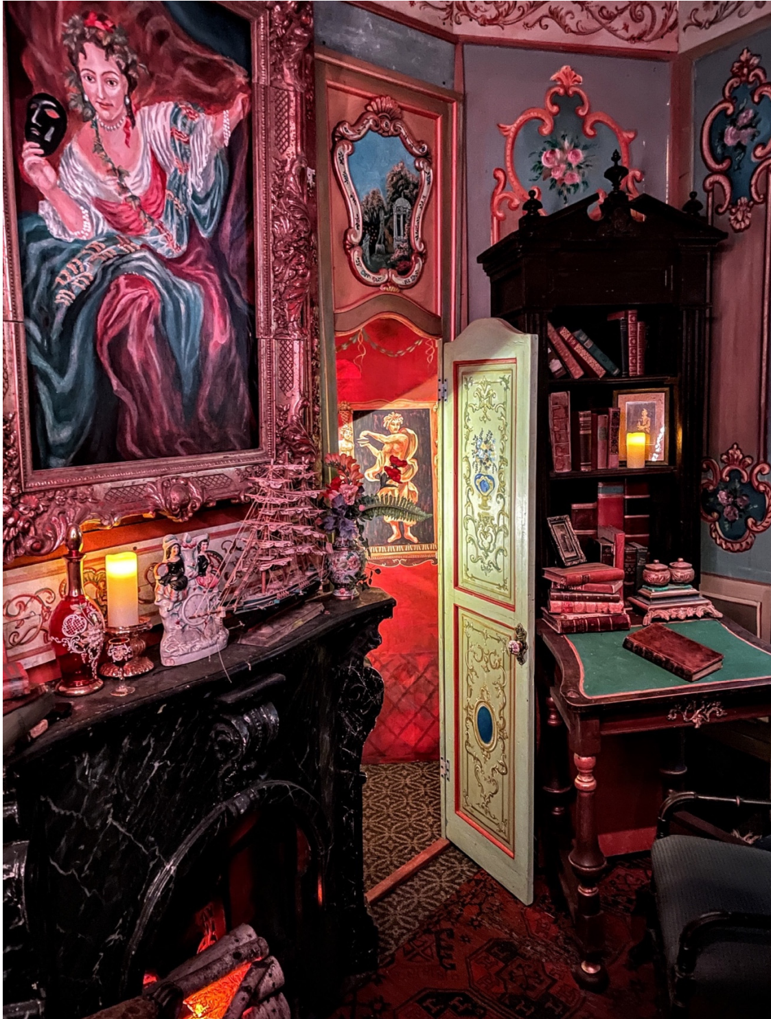
Figure 17 Writer's Room.

The images in this paper are strictly for educational use and are protected by United States copyright laws. Unauthorized use will result in criminal and civil penalties.