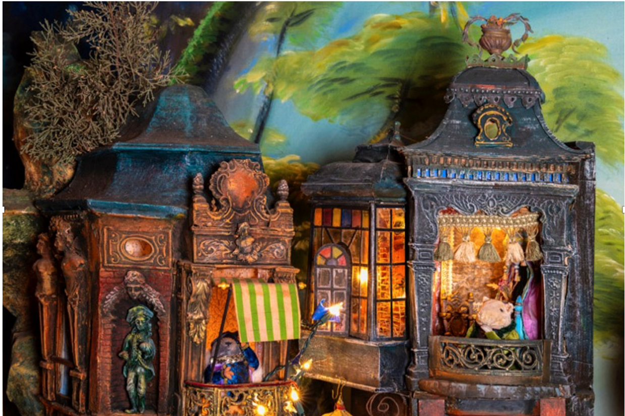
Figure 6 COVID Mole production in the Throckmorton Theatre front window, starring J. Arthur Mole.

Shortly after the Tarot reading, the project to keep the theatre alive took its first concrete form in a modest way. Steve assembled a miniature of the theatre itself in one of the theatre's front windows. It quickly became an evolving exhibit that morphed into a structure that housed a three act play about moles, starring J. Arthur Mole (Figure 6).