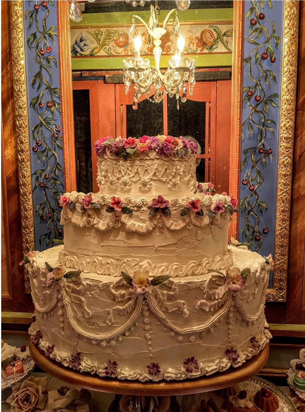
Figure 26 The Cake