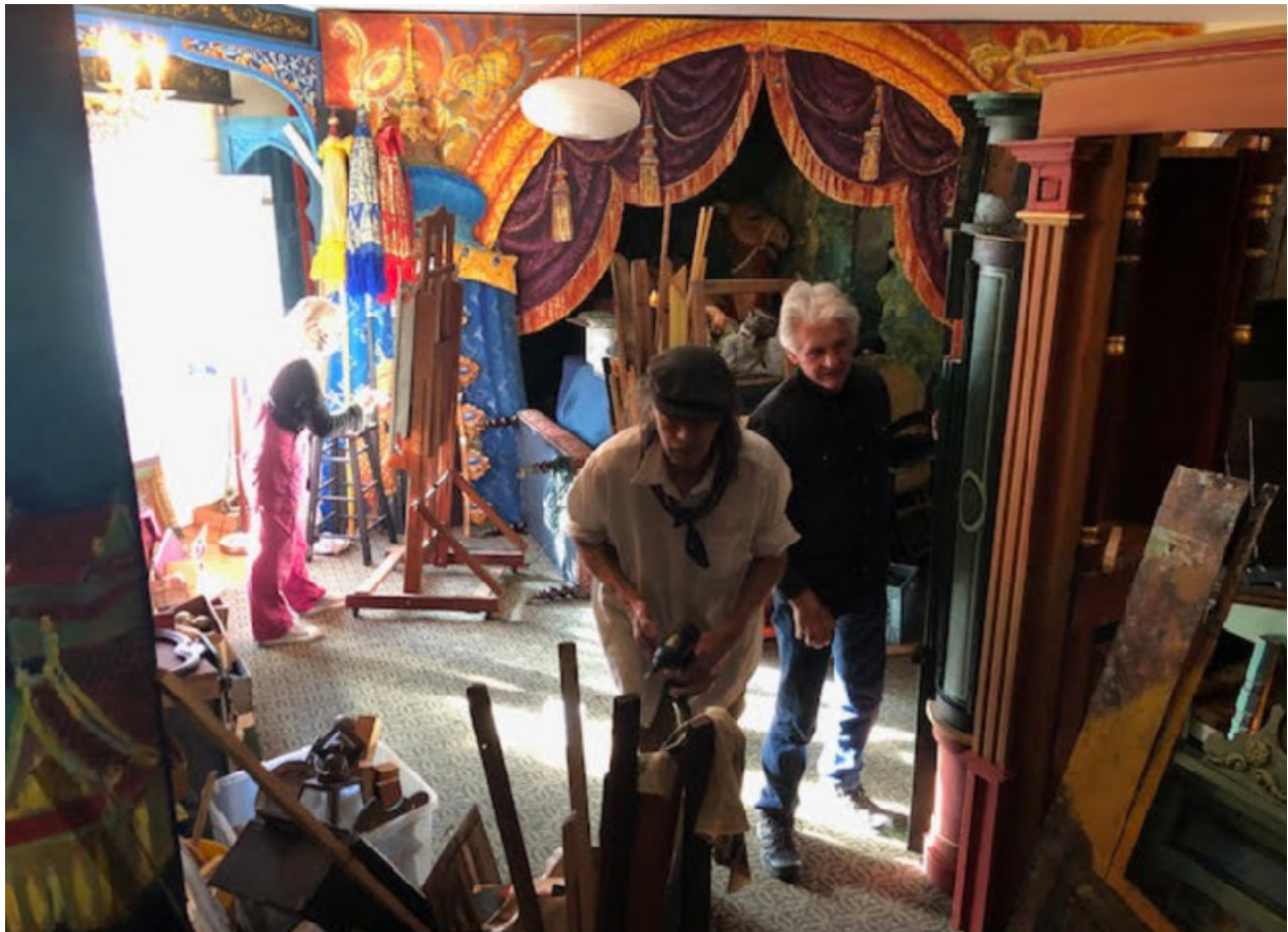
Figure 12 “A collage of ruins, of old sets, and these shreds of things” in the prop room.

The story of curating those objects into three-dimensional symbolic images as a window into other worlds is at the heart of the narrative that I want to tell about Steve's work. And in this narrative, there are stories within stories and worlds within worlds which Steve opened to us with his rich, almost childlike imagination.