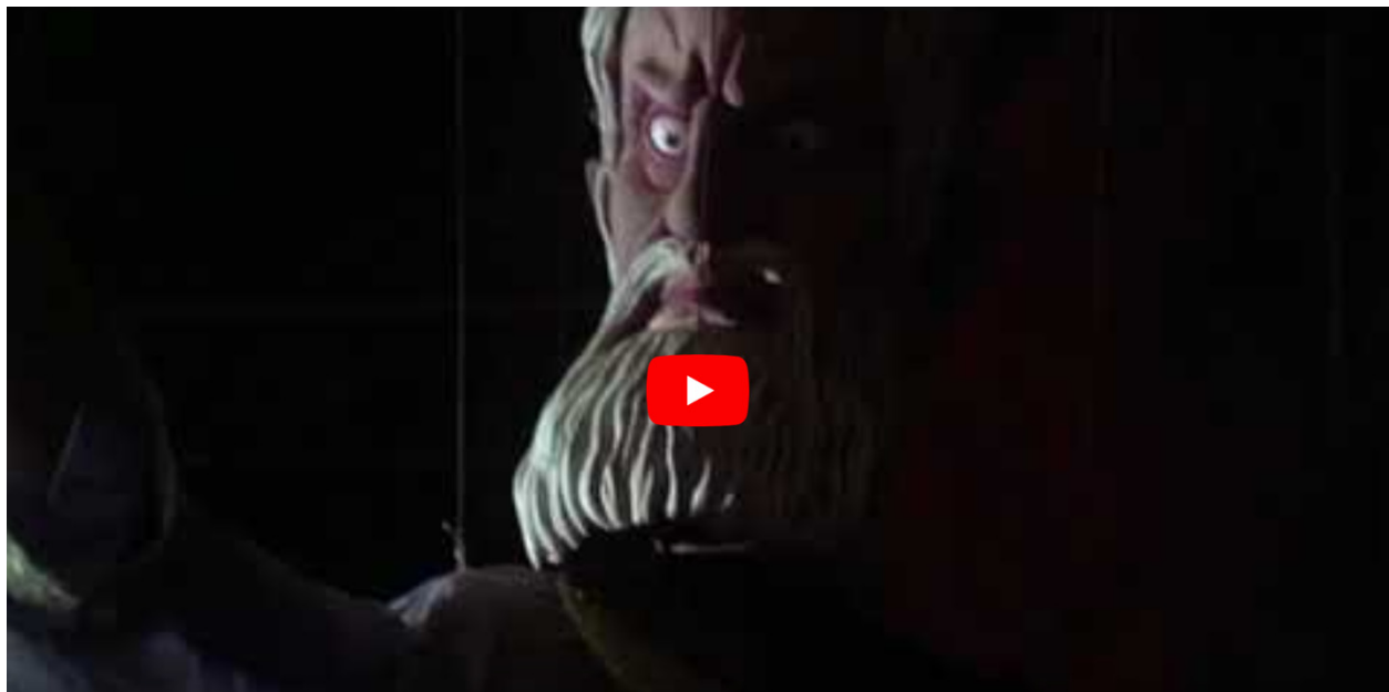
Clip 4 Alexander, God and puppets in Fanny and Alexander