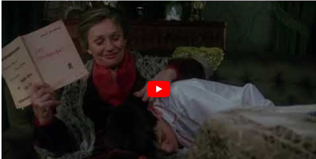
Clip 9 Reading Strindberg at the end of Fanny and Alexander