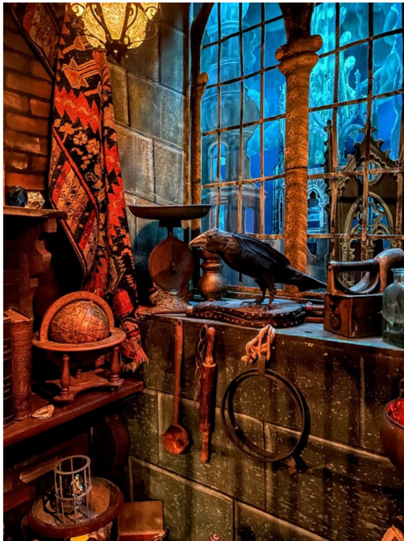
Figure 15 The Alchemist's Room.

The images in this paper are strictly for educational use and are protected by United States copyright laws. Unauthorized use will result in criminal and civil penalties.