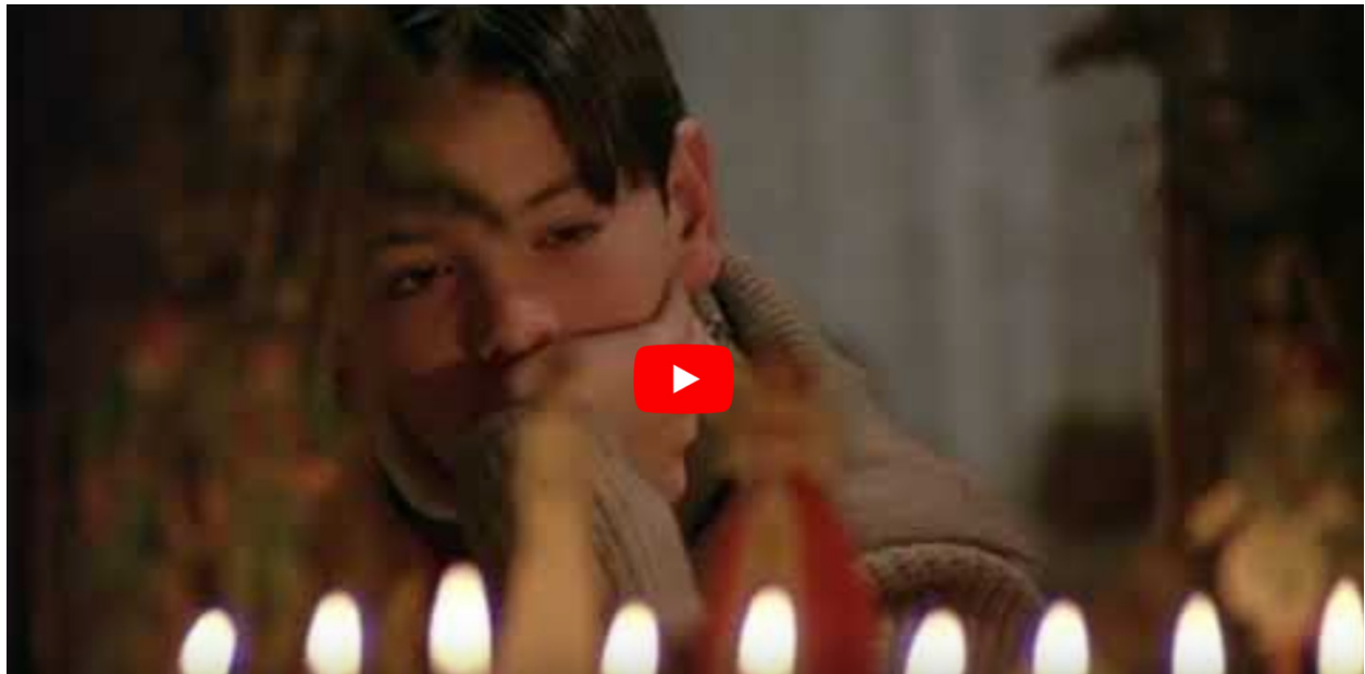
Clip 1 Alexander and the Puppet Theatre in Fanny and Alexander.