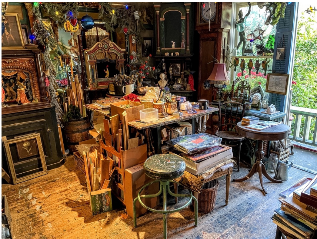
Figure 8 Steve Coleman's studio at the Throckmorton Theatre.

The images in this paper are strictly for educational use and are protected by United States copyright laws. Unauthorized use will result in criminal and civil penalties.