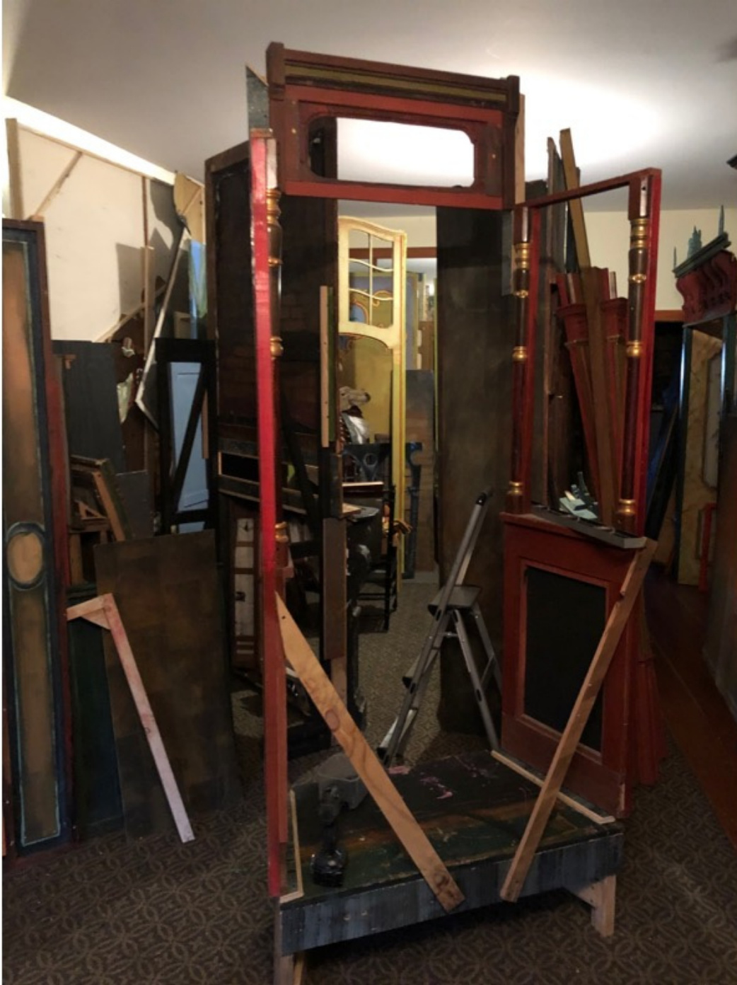
Figure 13 Would-be portals to the imaginal await their turn.

“This whole thing was created from a collage of ruins, of old sets and all these shreds of things, most of which never went together in the first place (Figures 12 and 13). But they were suddenly recomposed in these little vignettes that came