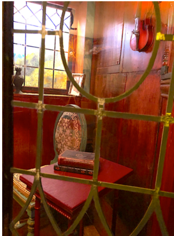
Figure 19 The Contemplation Room