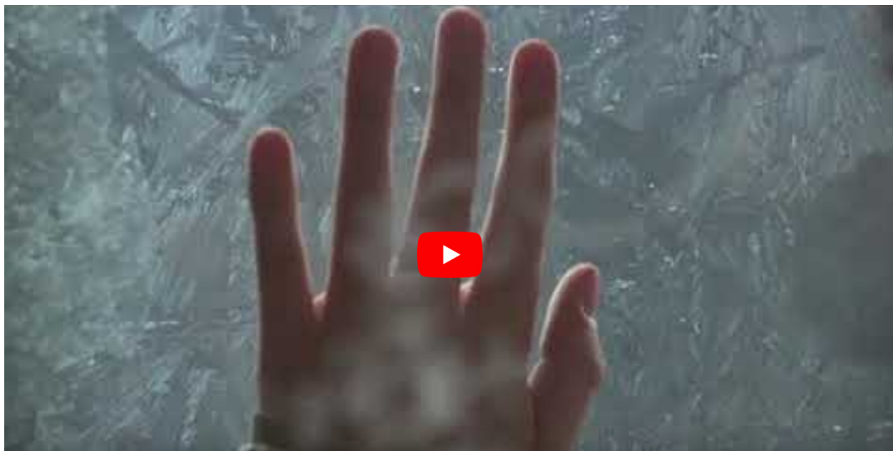
Clip 3 Alexander and the Ekdahl house rooms

“If you look at the way they light the scenes in her house, it’s like a series of proscenium in a theatre, these arches, with space going on beyond that. And then you want to know what’s going on in that next space because you can’t see where it goes off on the sides. Whereas in a normal room, they just show the whole room and you see everything at once and it’s all revealed. And that’s what I adore about Fanny and Alexander , too—that it’s not all revealed at once and you have to wonder what’s around in the next space, the next scene.”