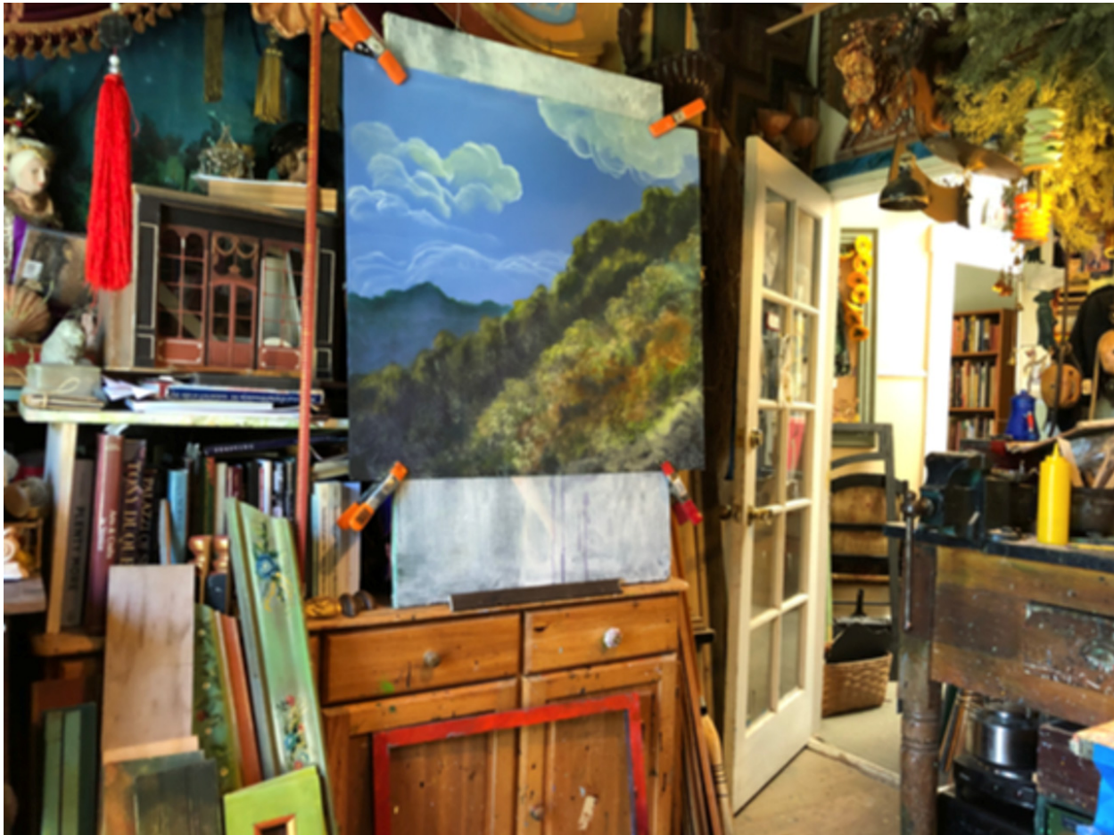
Figure 21 Painting the nature scene for outside the window of the Contemplation Room

And then looking out the window within the window (Figure 21), you go into a scene with the morning light on the slope of the mountain where there's just green openness and infinite space for your imagination to go into. And it's all in a tiny little space. It not big like a stage where you are creating on a large scale.”