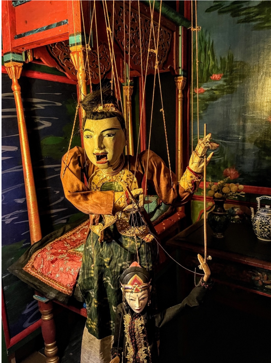
Figure 23 Big and Little Puppet in The Thai House Over the River: who's pulling the strings?