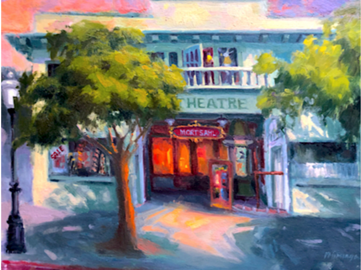
Figure 1 The Throckmorton Theatre by Victoria Mimiaga.