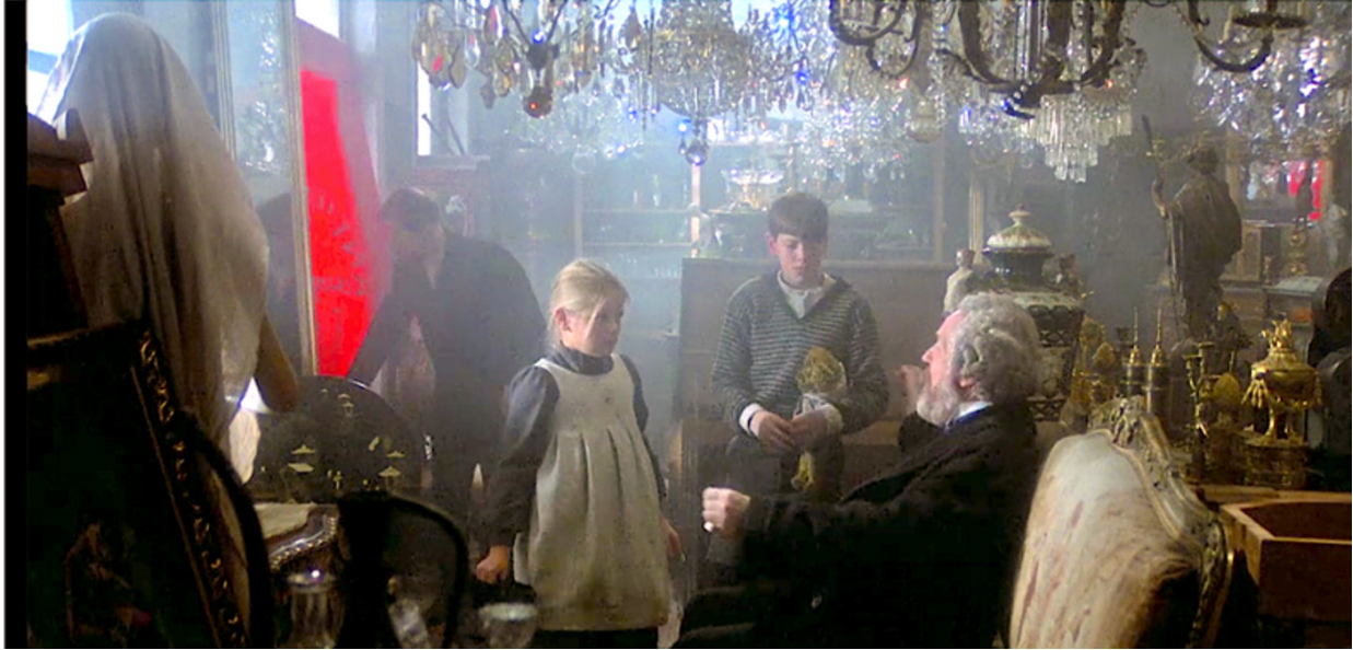
Figure 10 Fanny and Alexander in Isak's Store.