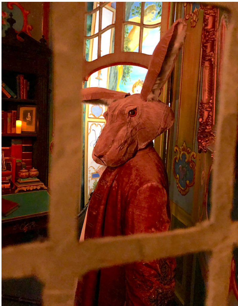
Figure 18 In the Writer's Room, the writer is a larger-than-life rabbit, standing quietly in a corner.