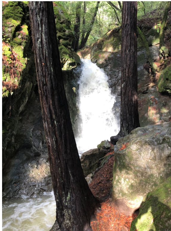
Figure 27 The flowing water of life: hope for renewal in Mill Valley after the threats of fire, drought, COVID, and polarization of the national psyche. Cascade Falls, Mill Valley, October 25, 2021.