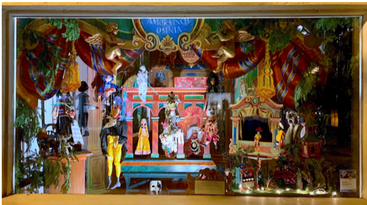
Figure 7 COVID puppet show in front window of Throckmorton Theatre.