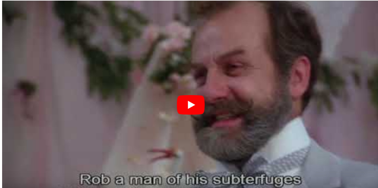
Clip 8 The numinous light in Fanny and Alexander: the Ekdahl Easter dinner table becomes a living mandala cake

This scene celebrating the joy of creation in Fanny and Alexander is not about any one person. It is about the whole extended Ekdahl family. And in celebrating the accomplishment of keeping the spirit of the Throckmorton Theatre alive in a time of darkness, the cake can be seen as celebrating a collaborative group, its own kind of extended family, that created something extraordinary. The Throckmorton Theatre cake was baked by a community of volunteers who were able to evoke a special world by moving back and forth between different realms through the vehicle of the imaginal.