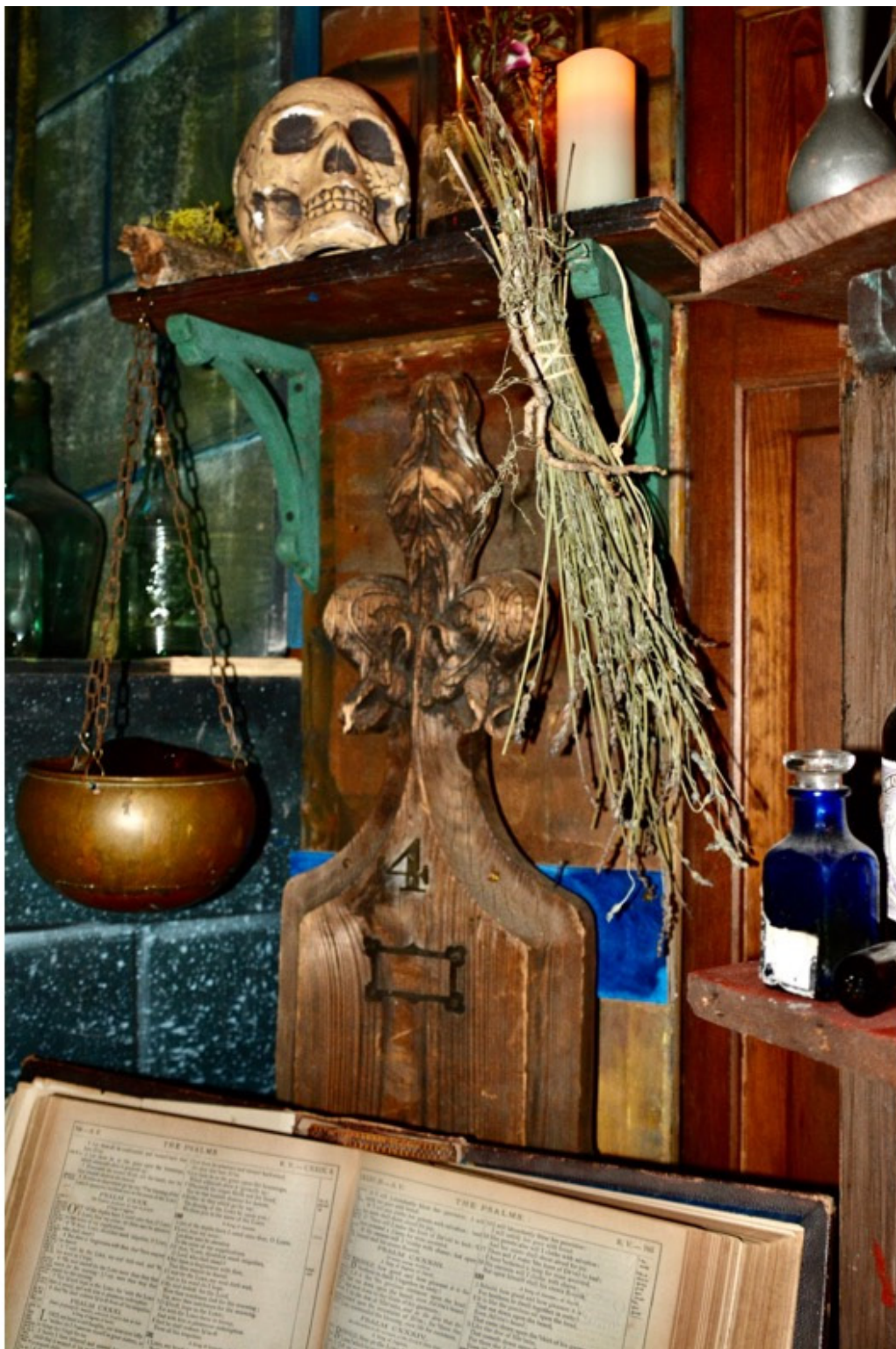
Figure 16 Close up of Alchemist's Room: skull, ancient text, and other objects.

The images in this paper are strictly for educational use and are protected by United States copyright laws. Unauthorized use will result in criminal and civil penalties.