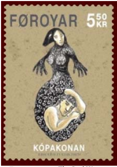
Faroese stamp, The Seal Woman

Two last features of the mermaid in need of comment her mirror and her golden comb, the tools she uses to reflect upon her nature and calm her sea-flung hair. The Book of Symbols notes that combing is "participating in the eros of unknotting, disentangling, smoothing, caressing and bringing light to the deeprooted mysteries of psyche and nature," and that this act with fingers "carried the numinous potency of enacting and shaping the creative ideas of emerging consciousness" ( Book of Symbols , p. 526). An analyst's careful sifting through and reflecting the lesser known contents of an individual's psyche can help one to feel the unifying tension at work in oneself.