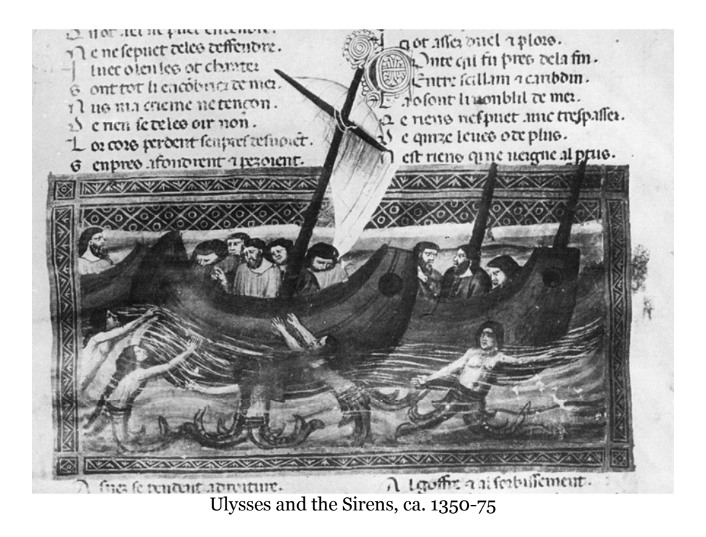
This paper is strictly for educational use and is protected by United States copyright laws. Unauthorized use will result in criminal and civil penalties.