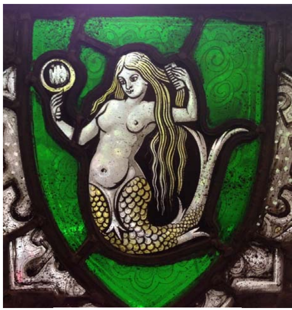
Mermaid with mirror and comb, Stained glass window at Yale HGS

In writing this piece, I realized that the mermaid has become a potent symbol for me, particularly at the initial stages of analytic training. Although I have practiced psychotherapy for a decade prior to training, and with the benefit of some analytic influences, my training has nevertheless proved to be an initiation into something new. In relocating to a new state I started a new practice and began to work more intentionally to hear the compensatory unconscious affects and attitudes alongside the conscious attitudes and goals. Thus I stand at an initiation with each of my cases, some wanting the impossible comfort of a total connection, some terrified and turning away from what they see, and some bravely embarking on their own complex journey.