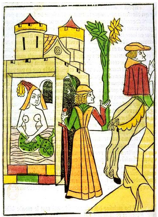
Illustration from the <u>Jean d'Arras</u> work, Le livre de Mélusine (The Book of Melusine), 1478

I turned to ARAS for amplification of the mermaid, an image which seems most thought of as an alluring, overwhelming, destructive and often fatal siren. Yet, she is also a mercurial intermediary, half human and half fish or serpent, and in her own way, a holder of the tension of opposites.