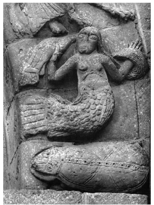
Fish tailed siren with sea-monster below, 11th-12th centuries

tree in whose branches the numen appears in the shape of a mermaid (=anima) with a snake's tail," and he extends this idea in a footnote: "there is a widespread idea that souls and numina appear as snakes.... For what the mother is to the unborn child, that water is to the believer. For in water he is moulded and formed" (CW 14 para. 75). In the mercurial form of the mermaid we are reminded that the unconscious seeks the light, and consciousness seeks connection to its source and meaning.