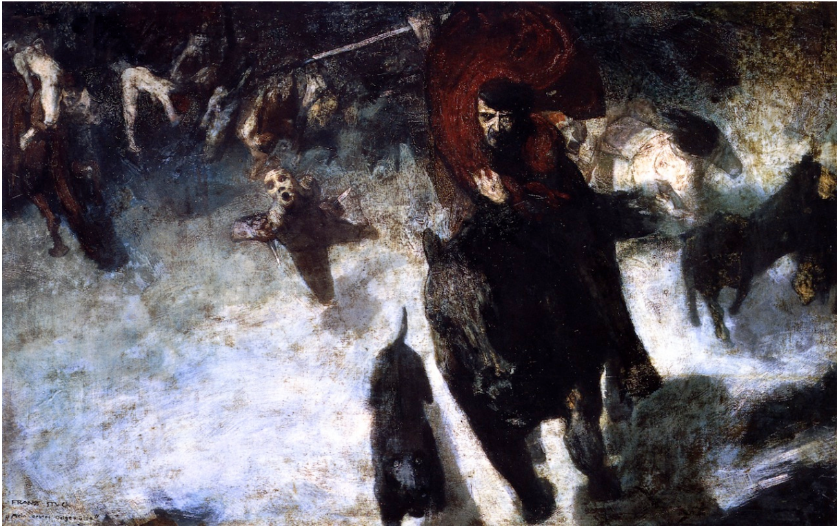
Image 1 Franz von Stuck Die Wilde Jagd, portraying Wotan hunting. The picture was painted in the same year as Adolf Hitler was born (1889) and is portraying what is happening in collective unconsciousness and consequently predicting as art is in many cases what will happen on a collective level in near future.