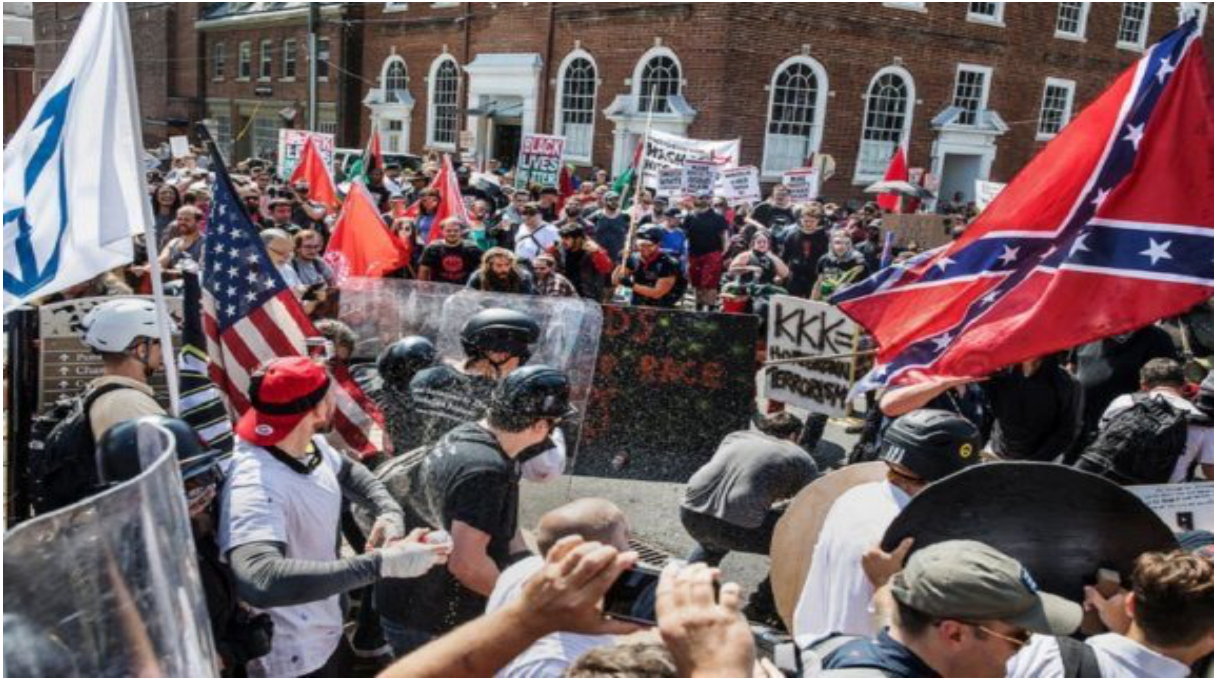
Image 4 White nationalists, foreground, clashing with counterprotesters, some of them members of the so-called antifa movement, in Charlottesville, Va.

As history tends to repeat itself, we have to look back to see if something similar to this has already happened and what the consequences were to society. One does not need to look far back. At the beginning of the twentieth century in the United Kingdom and in the United States of America the press was controlled by a few, but in Germany there was a boom of different newspapers. By 1912 there were 4000 newspapers, printing 5 to 6 billion copies a year. All political parties had their own newspapers; for instance, there were 870 papers read by conservative readers in 1912, 580 aimed at liberal readers, 480 for Roman Catholics of the centre parties and 90 connected to the socialist party. This spread of newspapers locally, transmitting different worldviews and enabling extreme views to find their place, is society forming its own imagined subgroups. In the end, one of them took over power and consequently ended the pluralism of newspapers in 1935, exercising total control by using the printing press to put a whole nation under its spell. (Corey, 2010)