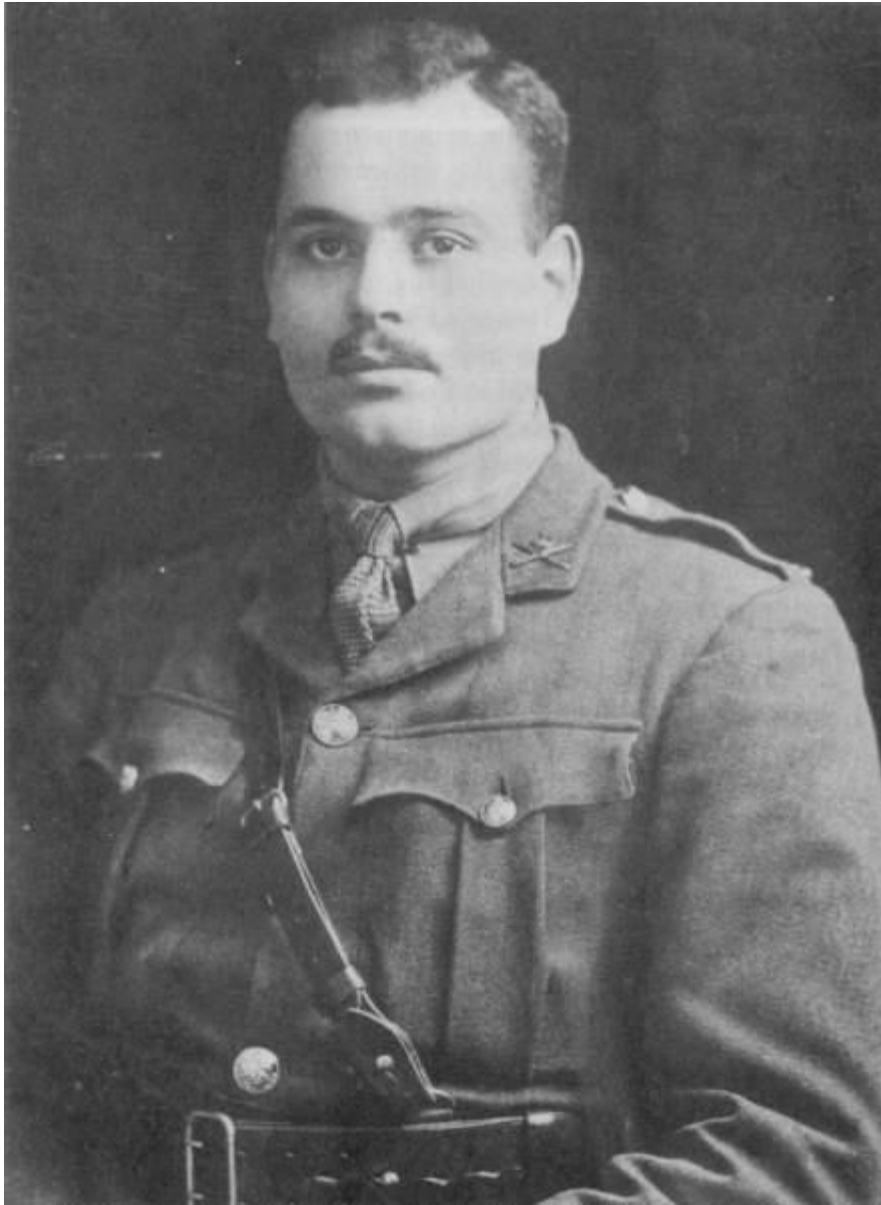
Image 2 Portrait of the English psychoanalyst Wilfred Bion in uniform in 1916.