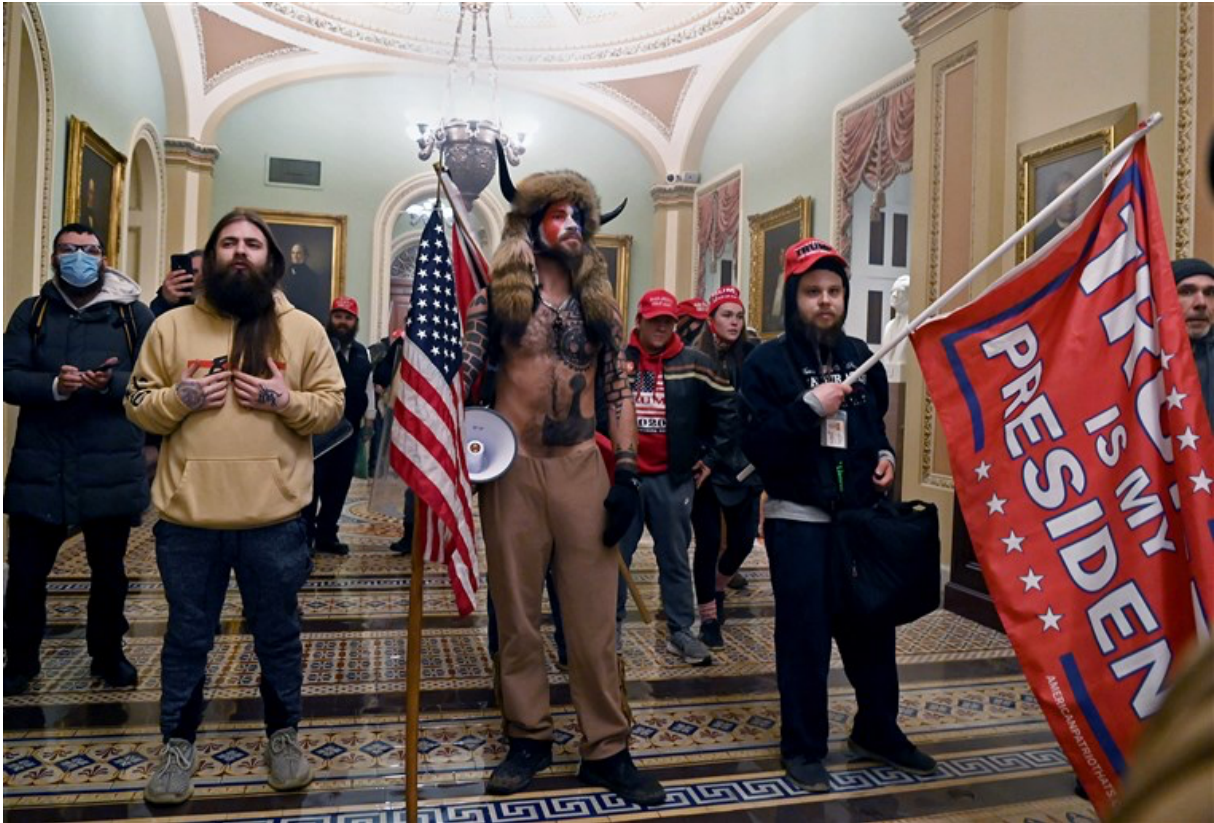
Image 6 Supporters of President Donald Trump enter the Capitol on Jan. 6, 2021.