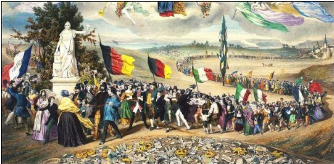
Image 3 "The Universal Republic". Lithograph by Frédéric Sorrieu. Published in 1848, it allegorically exalts republican, liberal and democratic values, which mobilize all the peoples of Europe.

According to Anderson, the major role in establishing this was the emergence of the printing press, which enabled the sharing of this common fantasy of a nation among people.