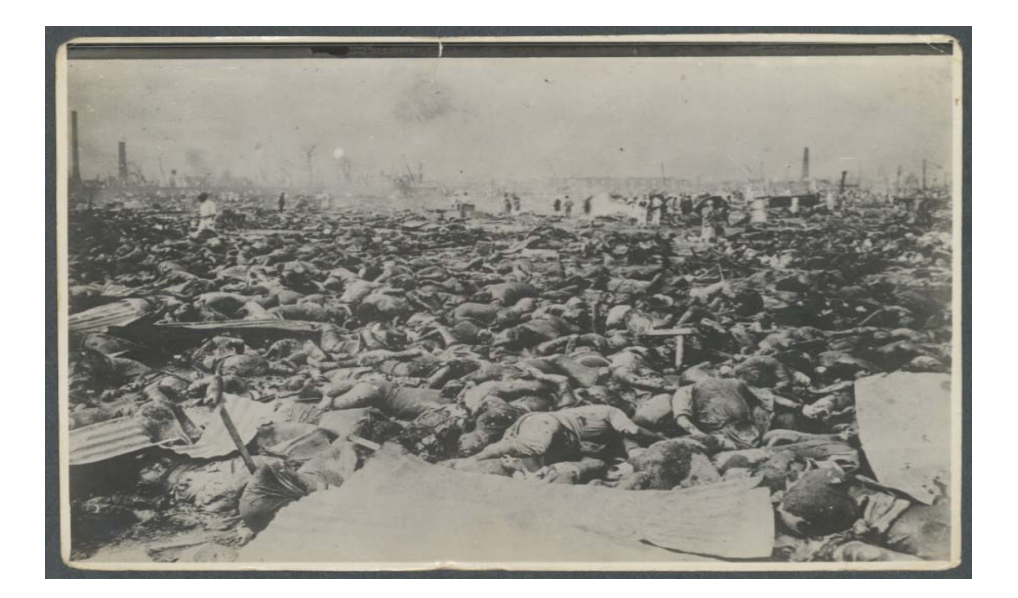
This paper is strictly for educational use and is protected by United States copyright laws. Unauthorized use will result in criminal and civil penalties.