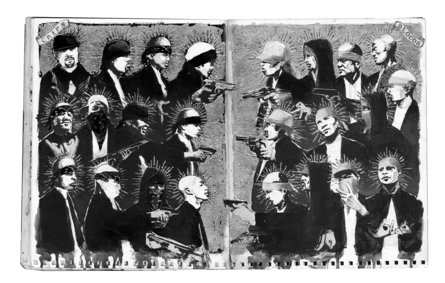
"Bloods and Crips." Rival groups — whether it be the Bloods and Crips or the Jungians and Freudians — can easily fall into conflicts in which the predominant exchange is between their archetypal defenses of the group spirit which can carry arms in many forms — from guns to laws to propaganda to cartoons. (Jake Messing, by permission. Mixed media painting, 14 x 22 in, from the "Martyrs" series, which can be viewed at <a href="https://www.jakemessing.com">www.jakemessing.com</a>.)

itself has become what Oppenheimer feared in himself when he quoted Vishnu: "Now I am become Death, the destroyer of worlds." As America has edged towards "becoming Death, the Destroyer of Worlds," it has found its mirror image in the Islamic suicide bombers whose actions proclaim: "We too love death — so you will never defeat us."