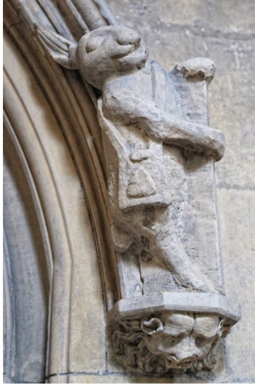
Figure 13 The Pilgrim Hare, St. Mary's Church, Yorkshire (The Pilgrim Rabbit, 2021).