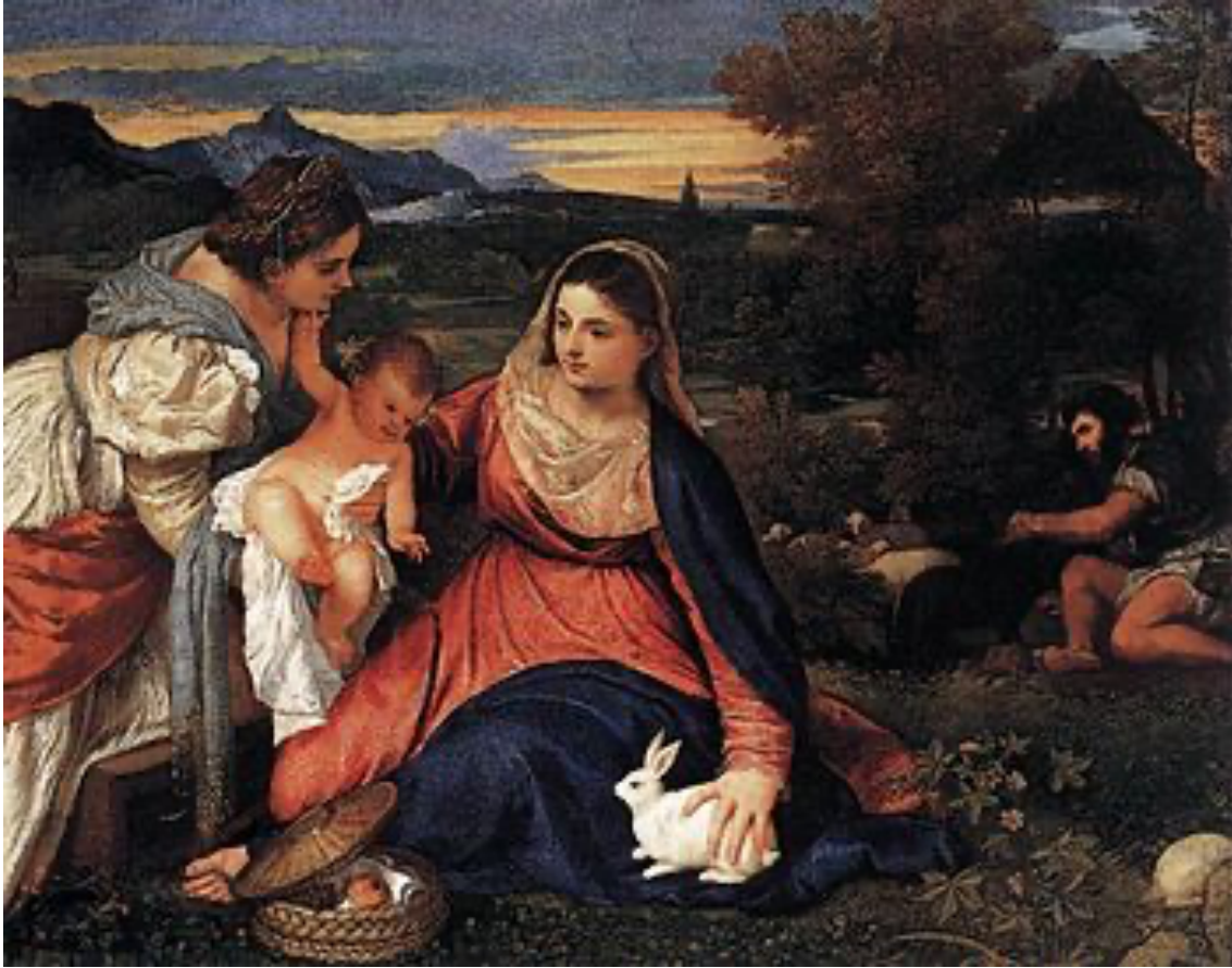
Figure 11 Titian (c. 1525-1530). Madonna of the Rabbit

White Rabbits, often laying or carrying eggs, are still seen in America in Spring, around the time of Easter, when the resurrection of the Christ is celebrated, and when rabbit breeding is most prolific. In this formation the White Rabbit can be viewed as a great magician, bestowing gifts and celebrating new life, but also acting in the roles of trickster, by hiding the eggs, and judge, by choosing who will receive these gifts and when. The rabbit burrow underground echoes the tomb of Christ, both transformational spaces. Mary Magdalene, who may be considered the shadow side of the Madonna, is said to be the first to become aware of Christ's resurrection from the tomb, and has been depicted holding a colored egg (Monastery Icons, 2022; see Figure 12).