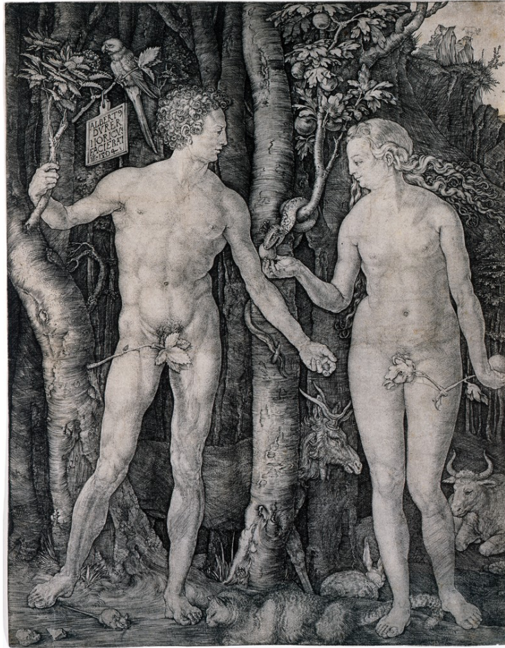
Figure 16 Duer, (1504). Adam and Eve (The Fall of Man). [Intaglio]. Retrieved from https://library.artstor.org/public/SS35538_35538_29885502

The symbolism of the color white further amplifies other aspects of the rabbit in its duality (Stevens, 1998), especially at mid-life; white can be a symbol of both purity, surrender, and death of a previous life, such as a Western bride's wedding gown, or a flag waved for a truce in battle. Unfortunately, the White Rabbit has also become associated with far right political and Christian extremism, racism, and men's rights (O'Callaghan et al., 2015). I am reminded of how the White Rabbit in the Alice books