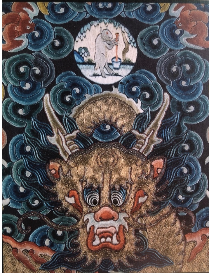
Figure 8 ARAS. (2010, p. 289). Rabbit on moon stirring the elixir of immortality. Embroidery, 18 th century, China.

One day after a sandplay consultation session, while smoothing out a recently wetted tray a White Rabbit caught my eye from the shelves. I spontaneously created a scene (Figure 9), starting by digging down to the bottom of the tray, holding the White Rabbit in my hand. I placed a large, clear jewel at the bottom, and built up the opening with natural materials, somewhat covering it.