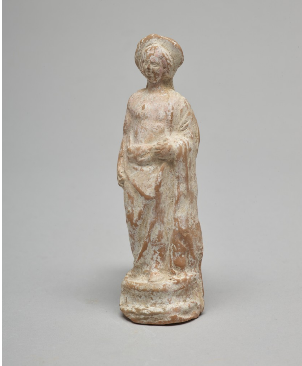
Figure 10 Creator Unknown (c. 400 BCE - 300 BCE). Figurine. [molded terracotta, pink and white slip]. Artemis with bow and rabbit. Retrieved from ARTSTOR, 2022.

The belief that rabbits could reproduce as virgins persisted from the ancient Greeks until the medieval period, when the White Rabbit became an allegory of the Virgin Mary's immaculate conception (Catholic Online, 2021; see Figure 11).