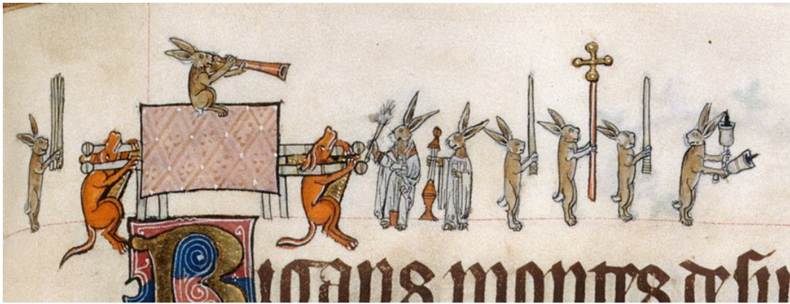
Figure 15 14 th Century English Manuscript. The World Upside Down . [Drollery].

Rabbits participating in human activities were frequent subjects in medieval art, known as “drolleries” or “grotesques” (Kern, 2016, Figure 15).