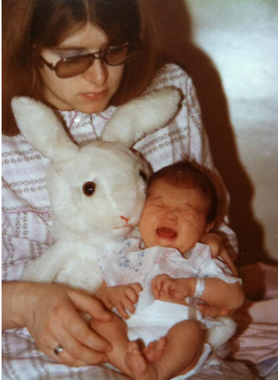
Figure 5 Born with the White Rabbit. Photo of Author and Mother, taken by Father

My mother bought a White Rabbit puppet when she was pregnant with me and used it as a focus object during her labor. I still have and cherish that puppet to this day. I had forgotten the photograph, though, and when I came upon it, found that it had