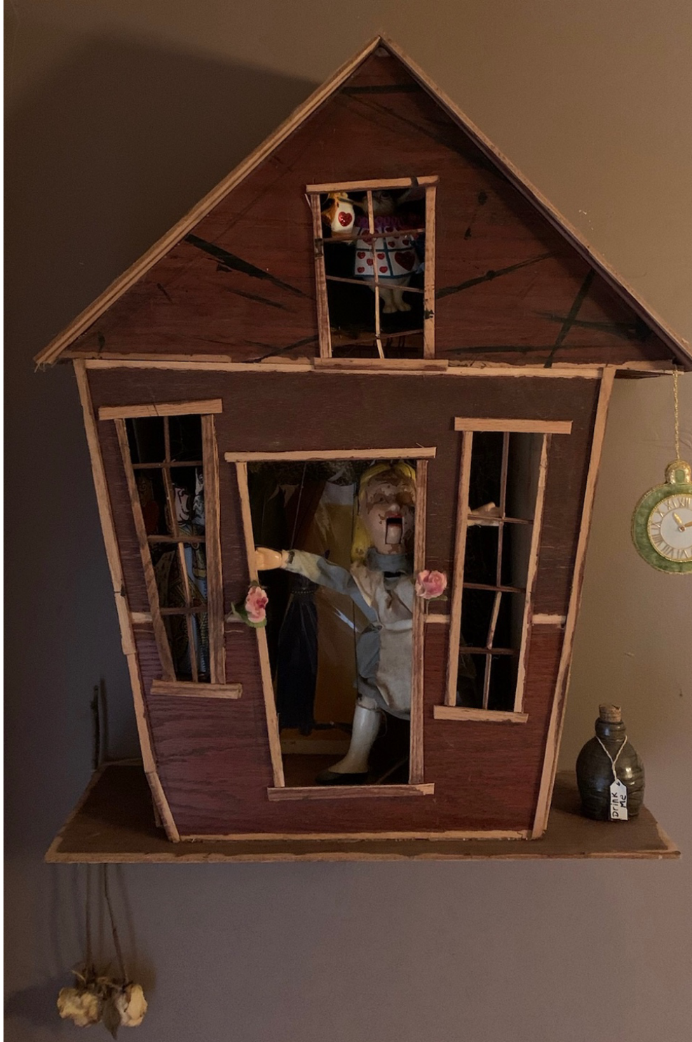
Figure 3 McRoberts, (N.D.). The Rabbit's House . [Assemblage & Mixed Media: Ornaments, marionette, handmade bottle and tag, greeting card, dried flowers, wood]. Author's personal collection.