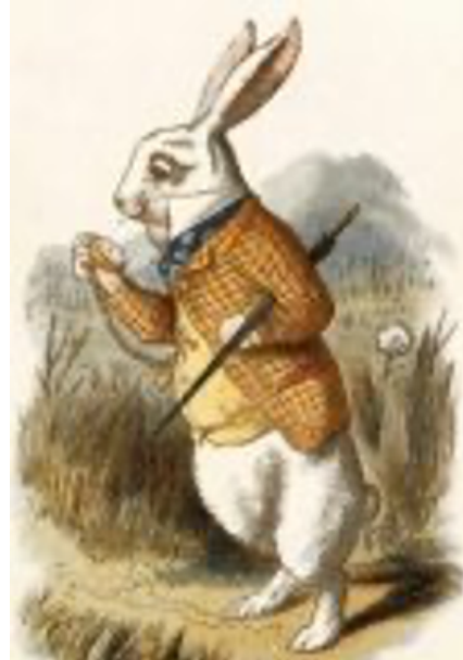
Tenniel's White Rabbit