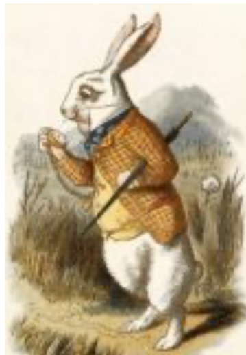
Figure 14 Tenniel's White Rabbit