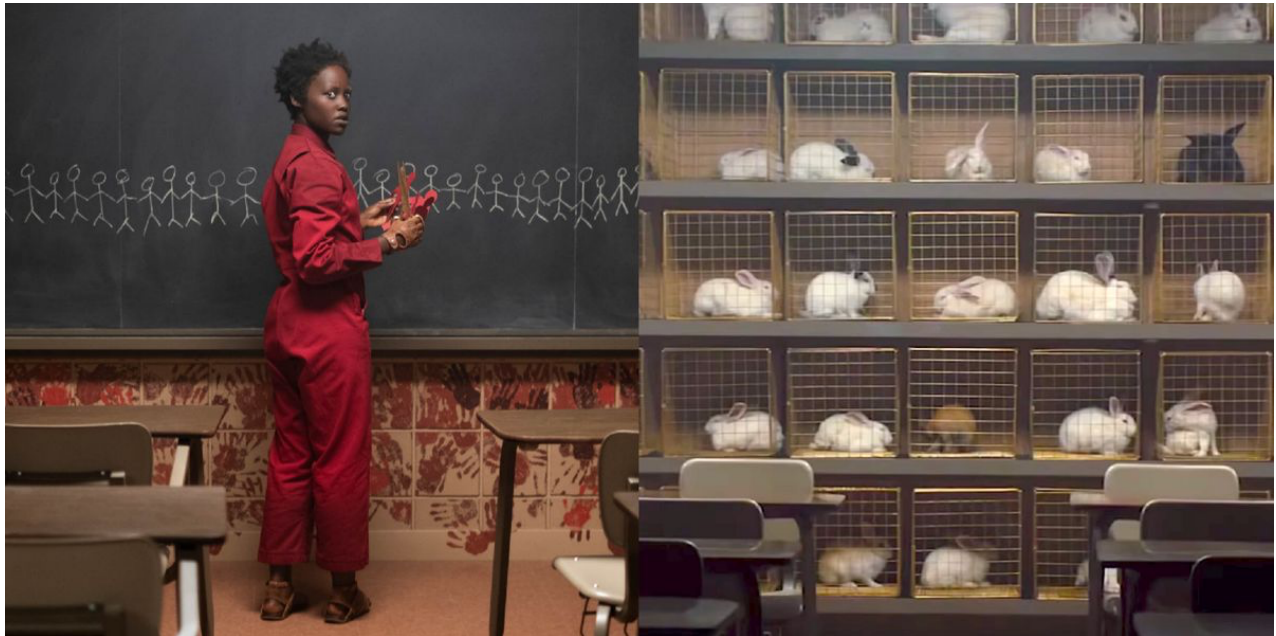
Figure 17 Us (Peele, 2019)

underground, they may be connected (tethered) to those above; at the end of the film, rabbits can be seen above running free.