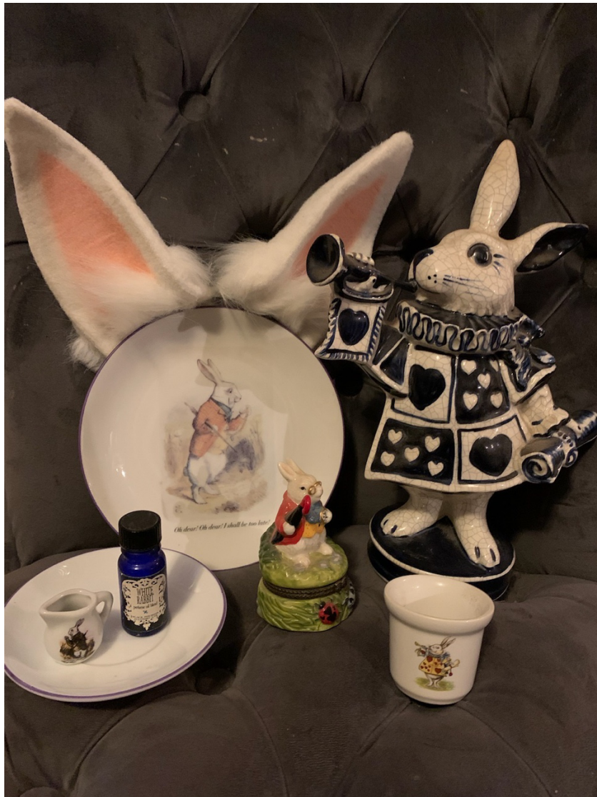
Figure 1 Selection of White Rabbit memorabilia from author's personal collection. Perfume by Black Phoenix Alchemy Lab. Tea-set by Rutter Porzellan, Germany (1993).

The White Rabbit has always been a symbolic companion of mine. Since I was a child, I have collected Alice in Wonderland and Through the Lookingglass (Carroll, 1865/1871/1960) memorabilia, most of it given to me as gifts from loved ones. From porcelain figurines and embellished teacups, to indie theater posters and interpretations in perfumery, White Rabbits dot my home and studio (see Figures 1- 3).