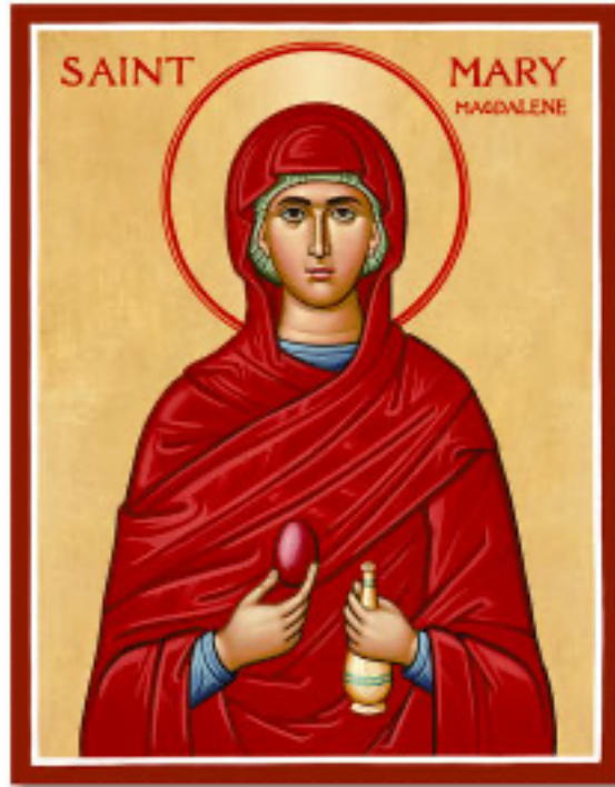
Figure 12 Saint Mary Magdalene & the Red Egg (Monastery Icons, 2022)

Mary Magdalene was misrepresented as a repentant prostitute in sermons and writings for hundreds of years before being canonized as a saint by the Catholic Church in 1988 and being declared “Apostle of the apostles” in 2016 (Holy See Press Office, 2016). In the contemporary political lexicon, “chasing the white rabbit” is used to describe both the act of creating a cover story, and one’s wily fascination with discovering the truth (Urban Dictionary, 2021).