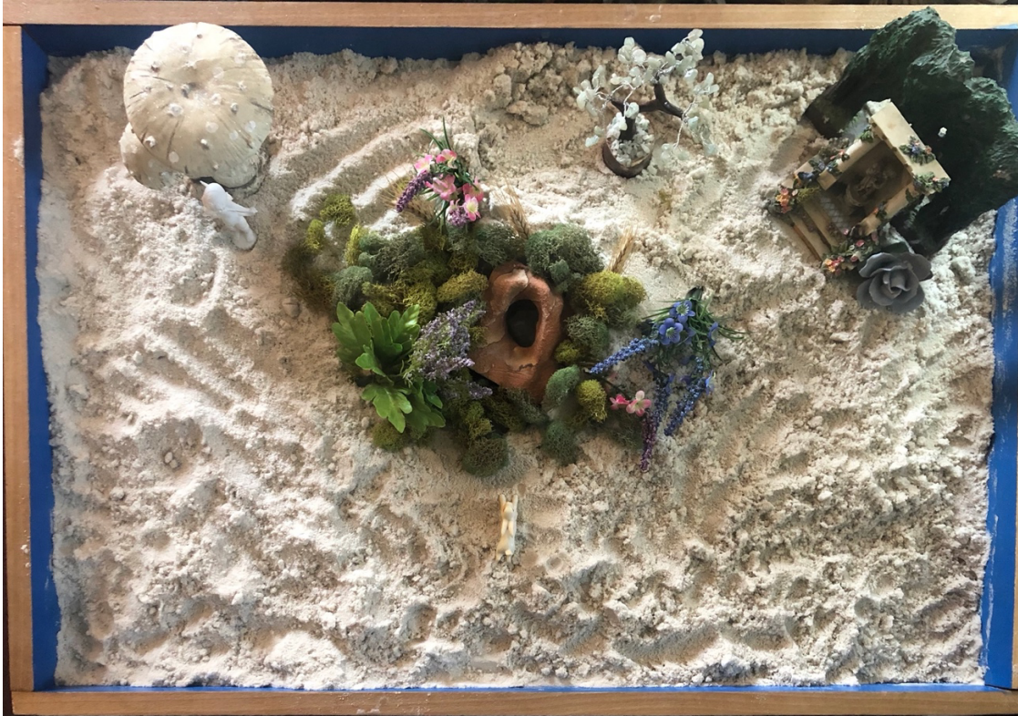
Figure 9 McRoberts (2021). Following the White Rabbit

Upon reflection, I recall lyrics from the movie Labyrinth (Henson, 1986),