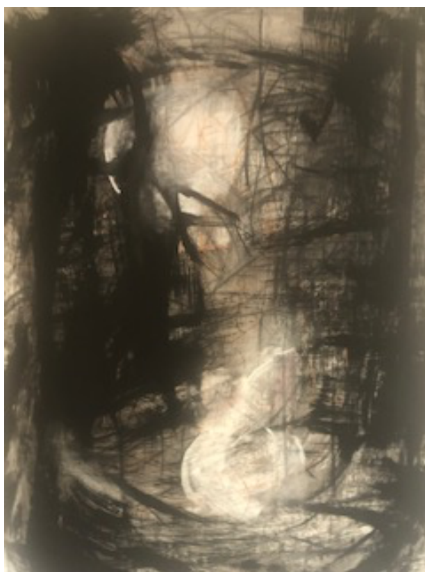
Figure 7 McRoberts (2021). White Rabbit Gazing at the Moon. [Mixed media].