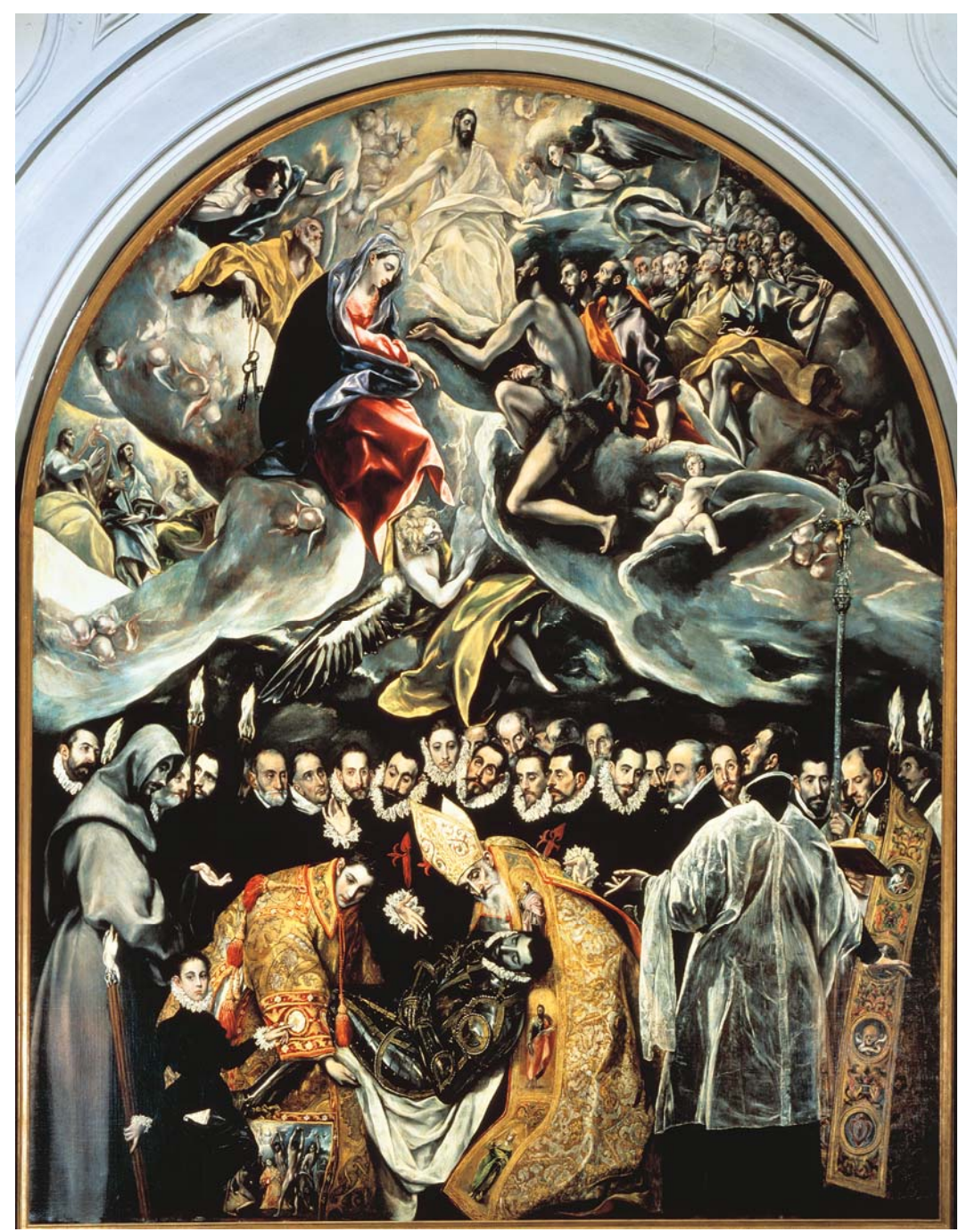
Figure 6 El Greco, Burial of Count Orgaz, 1586

He imagines it as Picasso's descent into the underworld. In the form of Harlequin Picasso wanders through Hades bringing up to the canvas grotesque, earthy, primitive shapes, an "accumulation of rubbish and decay." (p. 139) Although Jung acknowledges that Picasso's Nekyia is a meaningful katabasis eis antron , a descent into the cave of initiation and secret knowledge, and finds that the artist expressed a motif of union of opposites, of light and dark animas, he believes that the artist is unconscious of this process. Jung is repulsed by the