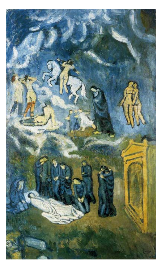
Figure 5 Pablo Picasso, Evocation (The Burial of Casagemas), 1901

pictures as those of schizophrenics. He sees Picasso's paintings gradually becoming abstract as they come more from "inside' situated behind consciousness." (CW15, p. 136.) On the way, Jung offers a perceptive analysis of Picasso's Blue Period<sup>30</sup>.