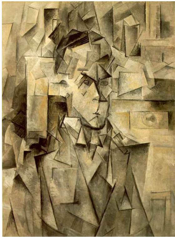
Figure 2 Pablo Picasso, Portrait of Wilhelm Uhde, 1910

Thus, we cannot say that Jung was ignorant or unappreciative of modern art. So, why would it be difficult for Jung to follow his own guidance for the proper psychological approach to art?: We [must] let a work of art act upon us as it acted upon the artist. To grasp its meaning, we must allow it to shape us as it shaped him. Then we also understand the nature of the primordial experience. (CW 15, p. 105.) Why would it be difficult for Jung to stay in the attitude of not knowing, of not understanding toward modern art, a fruitful approach that he has taken toward any psychic material<sup>2</sup>.