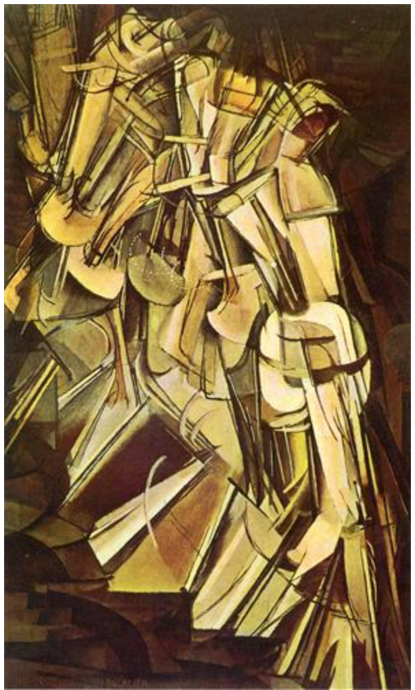
Figure 1 Marcel Duchamp, Nude descending the Staircase, No. 2, 1913

squares, but figure is up and down the stairs at the same time, and it is only by moving the picture that one can get the figure to come out as it would in ordinary painting where the artist preserved the integrity of the figure in space and time." [Analytical Psychology, 1925, p. 54.]