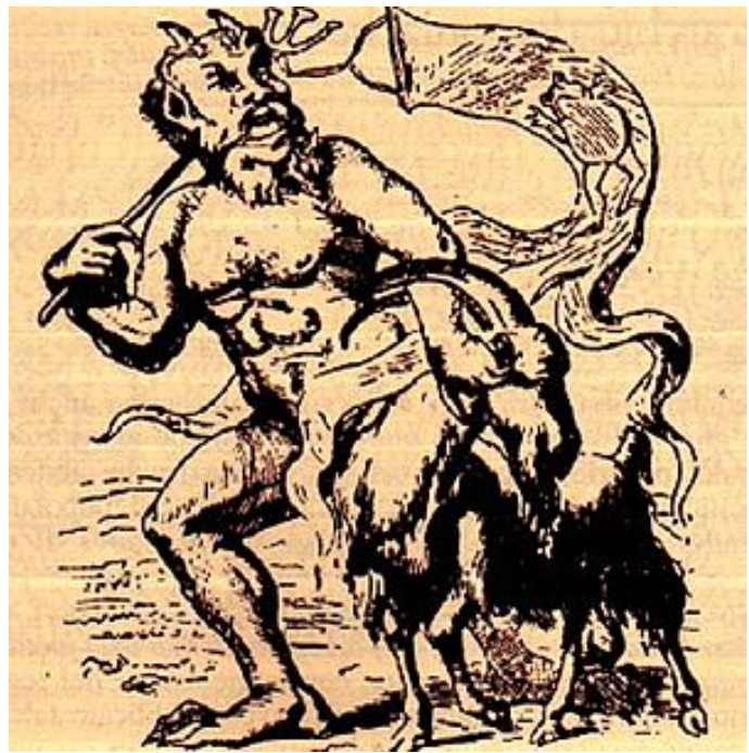
Figure 3 A depiction of Azazel in his familiar form of a goat-like demon, from <u>Collin de Plancy</u>'s <u>Dictionnaire Infernal</u> (Paris,1825).

Jung believed that fallen, exclusively "bad" angels, begot "inflation" similar to the megalomania that he observed in modern dictators. [MDR, p. 328] Fallen angels of the Book Of Enoch can be seen as archetypal ideas incarnating in human experience that lead humans to higher consciousness through development of arts and sciences. Jung thought that such a surge of archetypal energy leads to gigantic over-signification of the creative individual. He uses a curious expression: "an inflation of the cultural consciousness," as if collective human importance was elevated excessively through creative expression.