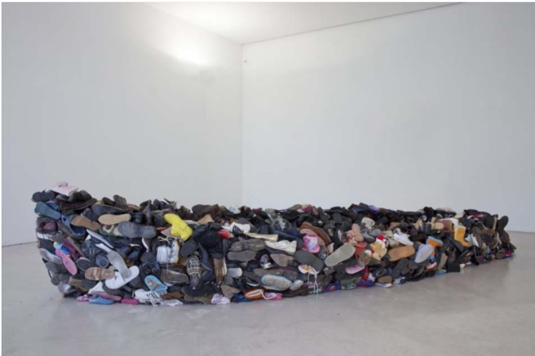
Figure 1: Sislej Xhafa's work Barka is a boat made of hundreds of shoes owned by the migrants who arrived in Lampedusa in 2011. i

'Art does not reproduce what we see, rather it makes us see', Paul Klee.