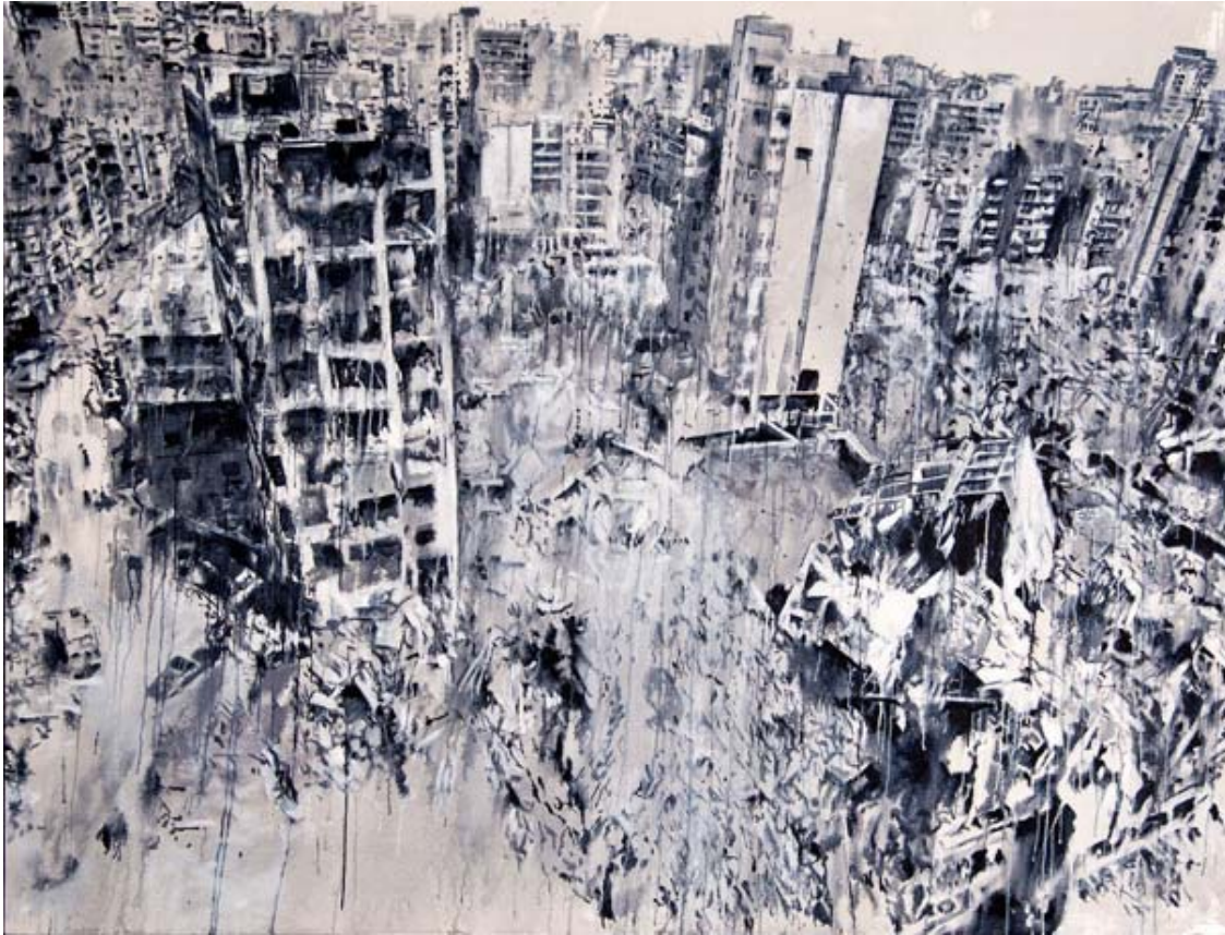
Figure 9: From "Storeys" by Tammam Azzam, 180 x 235 cm, acrylic on canvas, 2015. v

"I believe that art can't save the country. ... But I believe at the same time that all kinds of culture, art or writing, cinema or photographs, can rebuild something in the future", exiled Syrian artist Tammam Azzam.